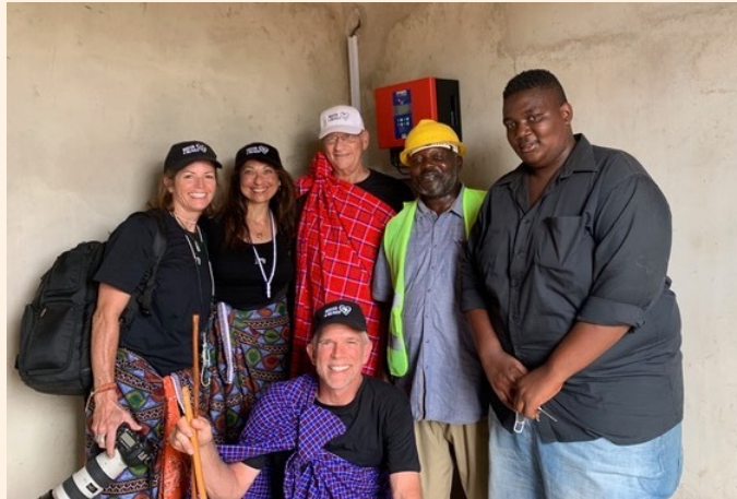
Where the solar pump and remote monitoring system are housed.

What stops something like the failed electricity system at Vikonje from happening to our projects? To ensure a permanent solution, our partner, innovation:Africa (iA), integrates three critical components in our proven, sustainable approach :