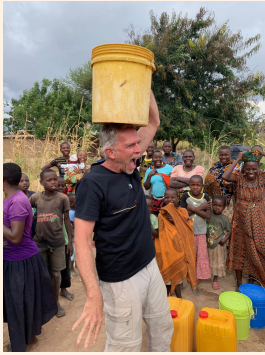
Balancing a filled water jug - NO EASY TASK!!