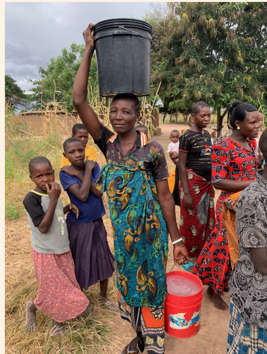
Before Water 4 Mercy: Walking for miles to find dirty, diseased water to drink.

For details on how your group can participate in a Donor Trip with Water 4 Mercy or to schedule a Speaking Engagement for your organization, contact us at 727-439-4222, Nermine@Water4Mercy.org or visit our website at www.Water4Mercy.org .