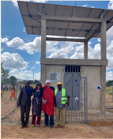
The new pump house in Ndebwe.