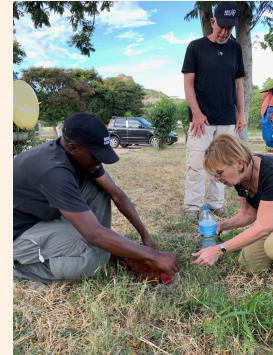
Tending to our African rooster with water.

"There's a primal satisfaction and sense of good when you're able to do something to help others less fortunate than you are. So many people would love to find ways to help their fellow man.