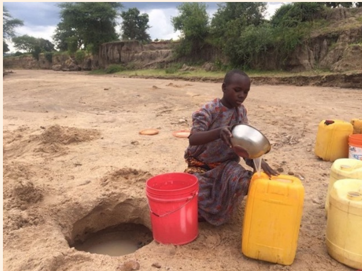
Before Water 4 Mercy: Digging to find dirty, diseased water to drink.

With drip irrigation farming, you also bring hope and restore dignity to the African.