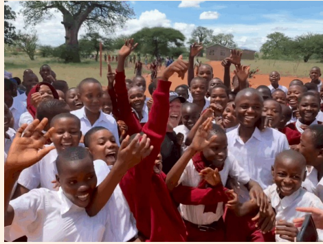
Having fun during the festivities!