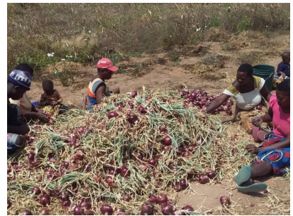
Surplus onions yield more profits at market

AITEC's multi faceted and holistic solutions will end thirst, hunger and poverty by sharing innovative and advanced solar, water & agricultural solutions developed by Israeli experts.