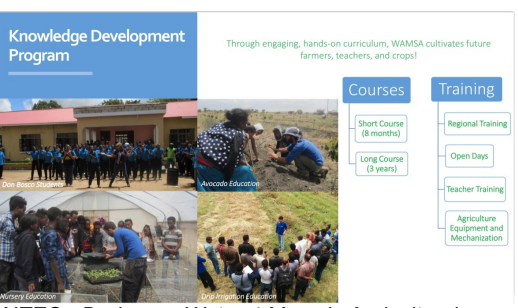
AITEC - Dodoma - Water 4 Mercy's Agricultural Innovation & Technology Center