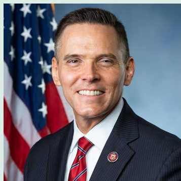
Ross Spano, Representative of Florida's 15th District. Spano currently serves the 116th