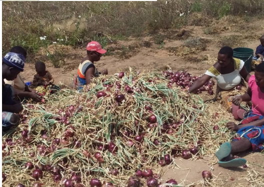
Surplus onions yield more profits at market