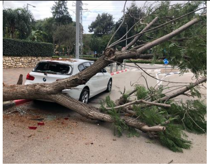
A tree is blown down by the wind in the central city of Rishon Lezion

The flooding occurred in an area of Nesher that floods almost every year, but the situation has worsened in recent years due to the local roadworks.