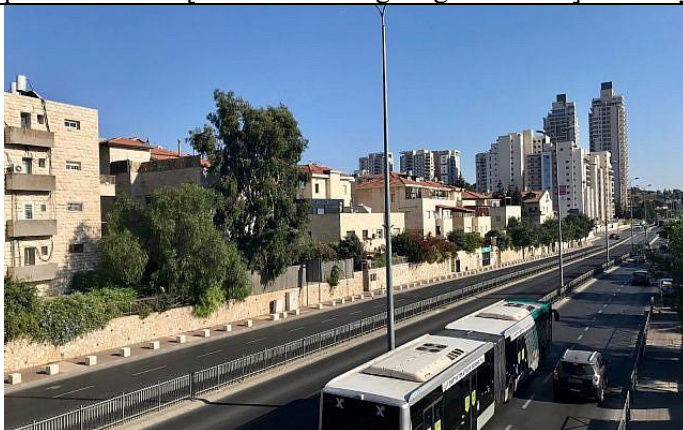
Part of Hebron Road, looking south

momentum. There will be more restaurants, shops, dry cleaners. Property prices will go up as embassy staff look for housing. Maybe there'll be another private school. A big embassy and a new light rail line will have an incredibly positive effect. [The surrounding neighborhoods] will only see an economic upturn."