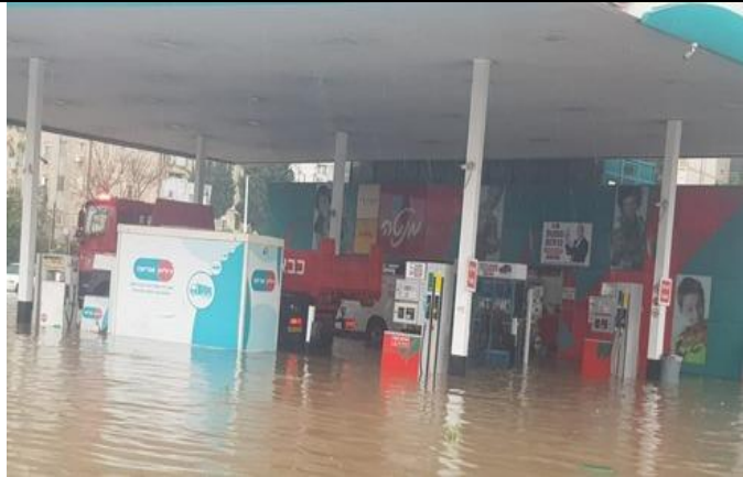
Flooding at a gas station in Nesher

The five, including a pregnant woman, were rescued from two separate vehicles by firefighters at a gas station in the city of Nesher near Haifa. No one was hurt in the incident.