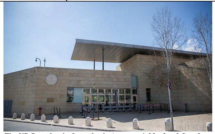
The US Consulate in Jerusalem's Arnona neighborhood, Israel,