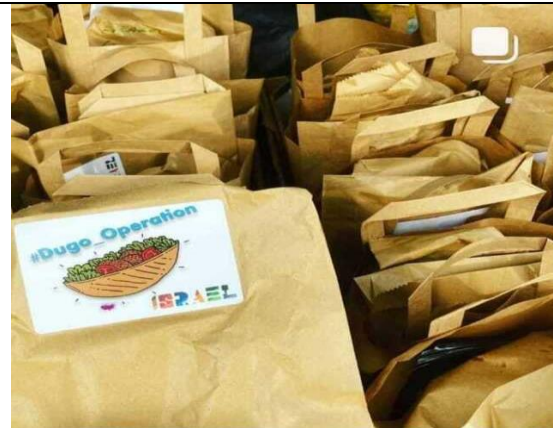
Bags of falafel the Israeli Embassy in London distributed to a local homeless shelter as part of 'Operation: Dugo' The mission in London, meanwhile, donated one hundred falafel portions to a homeless shelter.