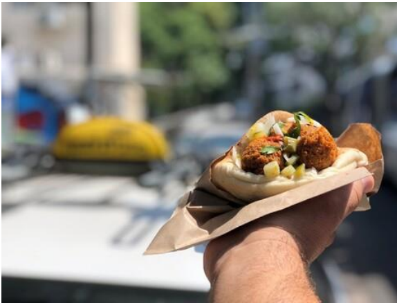
Falafel