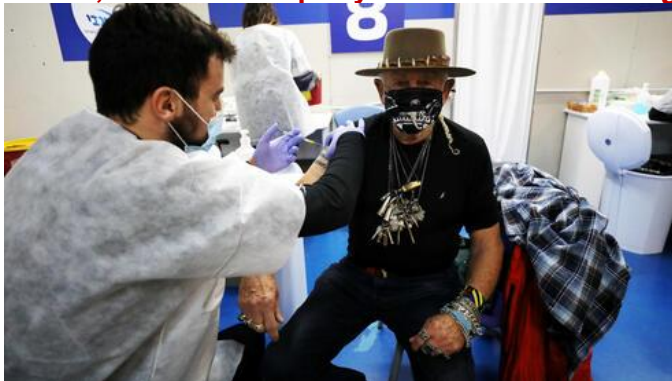
A man receives a vaccination against the coronavirus disease (COVID-19) at a temporary healthcare maintenance organisation (HMO)

At the Lev Ganim assisted-living facility in the city of Netanya, residents, still in protective masks, held a dance party to celebrate receiving their second and final injections.