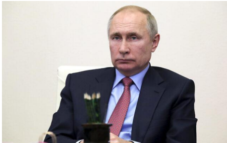
Russian President Vladimir Putin attends a meeting on economic issues via video conference at the Novo-Ogaryovo residence outside Moscow, Russia, January 21, 2021.

Russia’s media watchdog warned online platforms against encouraging minors to participate in the rallies or risk hefty fines.