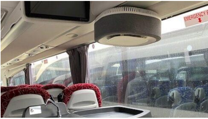
The Aura Air system installed on a bus

All of the air monitoring can be done through an app.