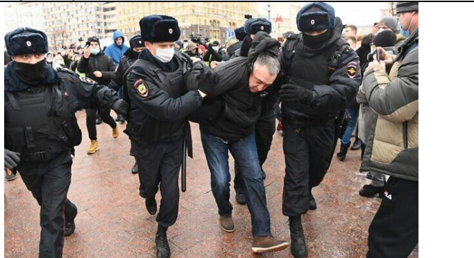
Police officers detain a man prior to an expected rally in support of jailed opposition leader Alexei Navalny in downtown Moscow on January 23, 2021. - Navalny, 44, was detained last Sunday upon returning to Moscow after five months in Germany recovering from a near-fatal poisoning with a nerve