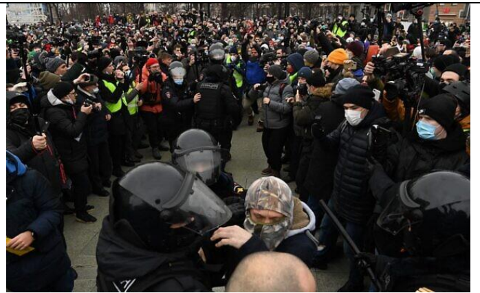
Police detain a man during a rally in support of jailed opposition leader Alexei Navalny in downtown Moscow on January 23, 2021