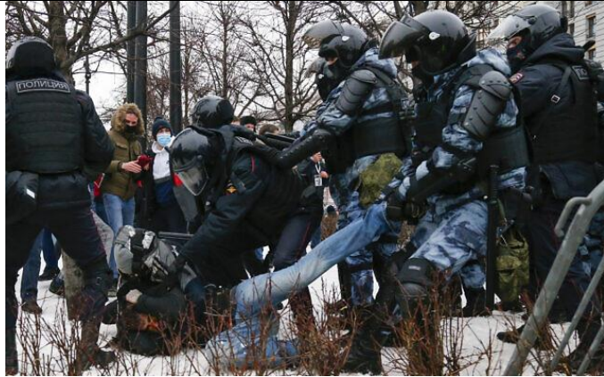
Police detain a man during a protest against the jailing of opposition leader Alexei Navalny in Moscow, Russia, January 23, 2021.