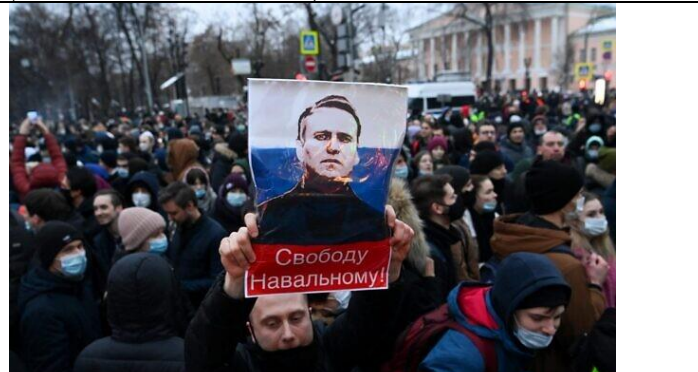
Russian protesters march in support of jailed opposition leader Alexei Navalny in downtown Moscow on January 23, 2021. The placard with an image of the Kremlin critic reads "Freedom to