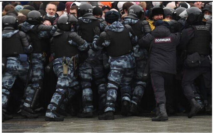
Police try to disperse protesters during a rally in support of jailed opposition leader Alexei Navalny in downtown Moscow on January 23, 2021.