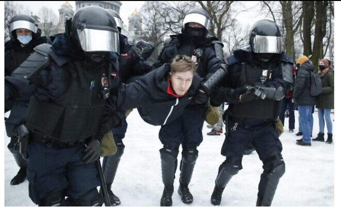
Police detain a man during a protest against the jailing of opposition leader Alexei Navalny in People gather in Saint Petersburg, Russia, January 23, 2021.