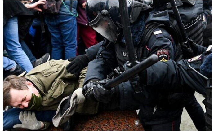
Protesters clash with riot police during a rally in support of jailed opposition leader Alexei Navalny in downtown Moscow on January 23, 2021.

MOSCOW — Russian police on Saturday detained over 2,000 people, including the wife of jailed Kremlin critic Alexei Navalny, as several thousands took to the streets nationwide to denounce President Vladimir Putin's rule.