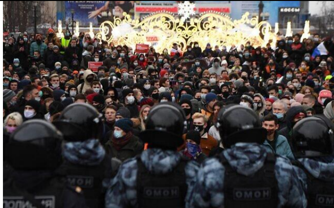
People attend a rally in support of jailed opposition leader Alexei Navalny in downtown Moscow on January 23, 2021.