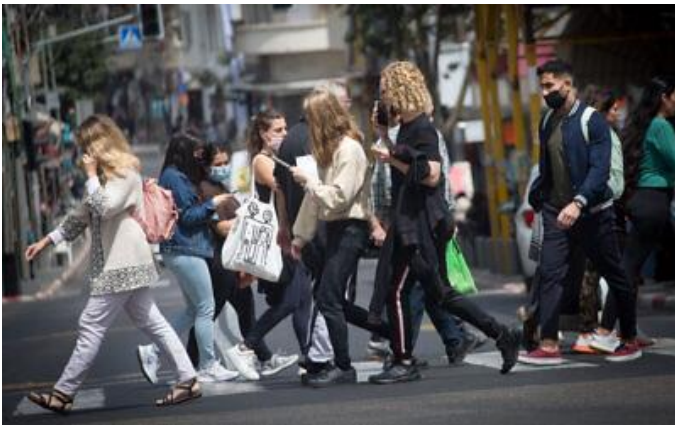
Israelis in Tel Aviv on April 11, 2021.

Ministers last week canceled the requirement for fourth graders to study in pods, as well as the requirement for students to present a health declaration signed by their parents to enter the classroom.