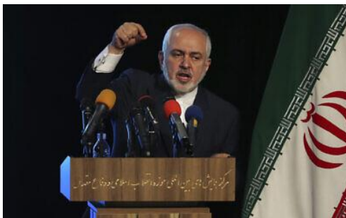
Iran's Foreign Minister Mohammad Javad Zarif speaks at a conference in Tehran, Iran, Tuesday, Feb. 23, 2021.

“The Zionists want to take revenge on the Iranian people for their success in lifting the oppressive sanctions,” Iranian Foreign Minister Mohammad Javad Zarif was quoted by Iranian press as saying, “but we will not allow it and take revenge on the Zionists themselves.”