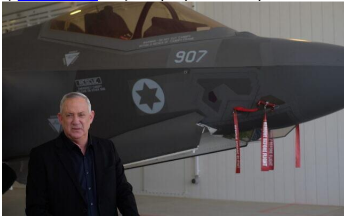
Defense Minister Benny Gantz stands in front of an F-35 fighter jet at the Nevatim air base on April 12, 2021.

By Judah Ari Gross Today, 5:04 pm Updated at 6:44 pm