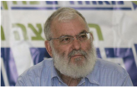
Former Israeli national security adviser Yaakov Amidror.

His comments come amid indications the Israel-Iran conflict is increasingly being waged at sea, marking a change in the conflict that previously took place primarily via airstrikes, cyberattacks, alleged espionage activities, and on land. Meanwhile, Israel’s intelligence agencies warned Monday of Iranian efforts to lure Israelis abroad to kidnap or otherwise harm them.