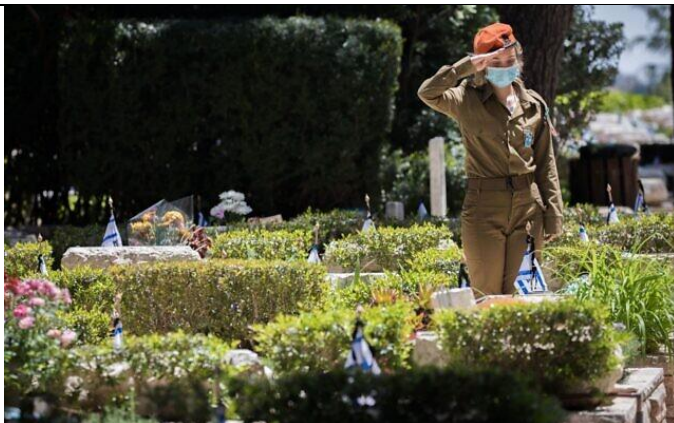
An Israeli soldier places flowers on the graves of fallen Israeli soldiers at the Mount Herzl military cemetery hours before the start of Memorial Day, in Jerusalem on April 20, 2020.