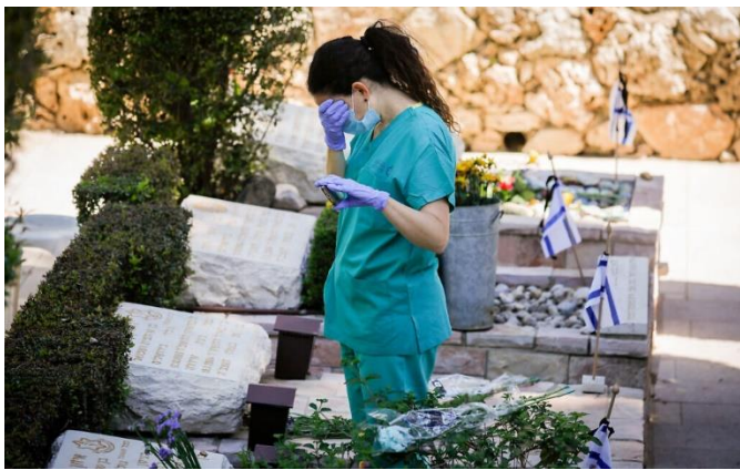
A nurse stands at a grave at the Mount Herzl Military Cemetery as Israel marks Memorial Day, Yom Hazikaron, April 28, 2020.

The new measures, effective as of Thursday, include raising the number of people allowed to gather outdoors from 50 to 100. The current limit of 20 people indoors remains in place.