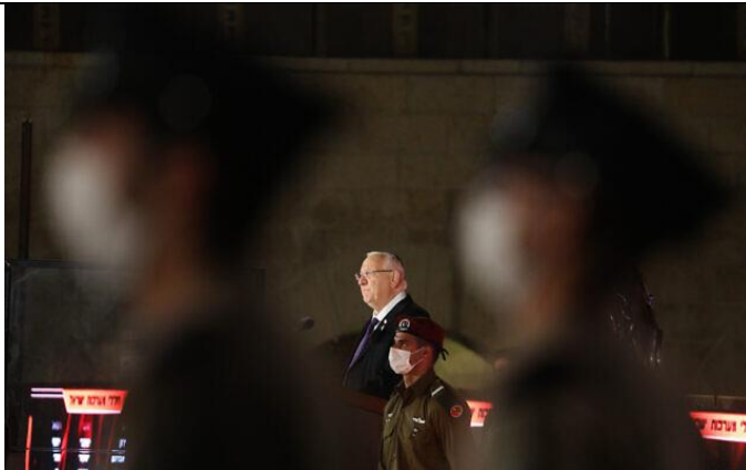
President Reuven Rivlin speaks at a ceremony marking Memorial Day for Israel's fallen soldiers and victims of terror, at the Western Wall in Jerusalem's Old City, on April 13, 2021.