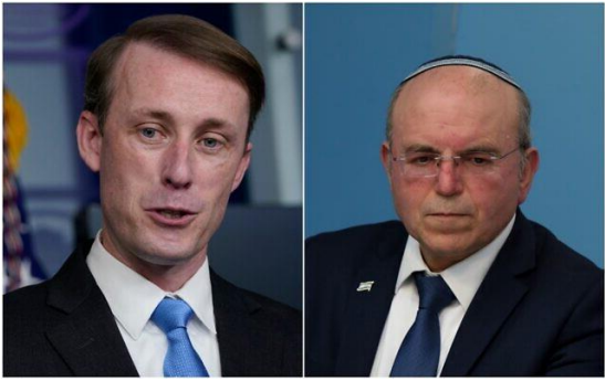
Israeli National Security Council chairman Meir Ben-Shabbat (right), and US National Security Advisor Jake Sullivan.

The Biden administration stressed its commitment to preventing a nuclear-armed Iran during a strategic meeting with Israeli officials on Tuesday, as Middle East tensions rose and Iran announced it was stepping up uranium enrichment to unprecedented levels.