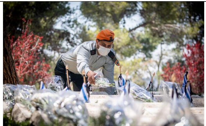
Israeli soldiers visit graves of fallen soldiers in Mount Herzl Military Cemetery in Jerusalem, on April 13, 2021, ahead of Israeli Memorial Day, which begins tonight.