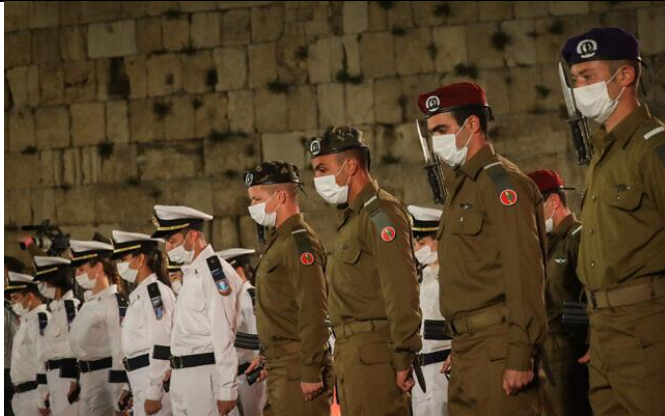
Israeli soldiers stand still as a memorial siren sounds during the ceremony marking Memorial Day for Israel's fallen soldiers and victims of terror, at the Western Wall in Jerusalem's Old City, on April 13, 2021.

The one-minute siren at 8 p.m. was immediately followed by the state ceremony at the Western Wall in Jerusalem. On Tuesday night, additional public memorials will be held, including at Tel Aviv's Hayarkon Park and in the Knesset in Jerusalem.