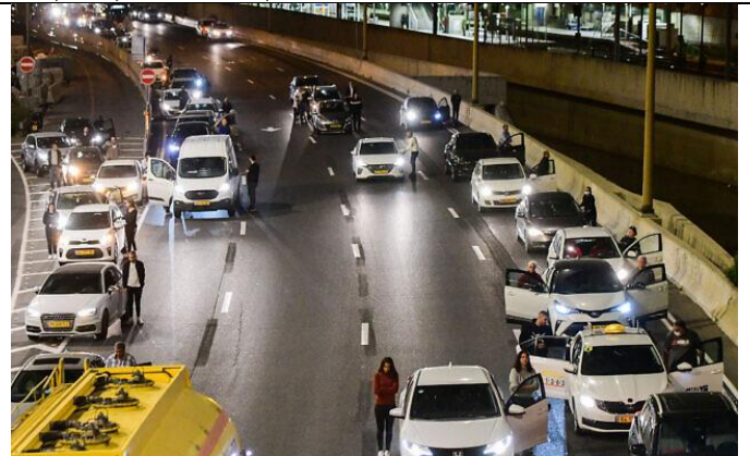
People stand still as one minute siren sounded across Israel, marking Memorial Day which commemorates the fallen Israeli soldiers and victims of terror in Ayalon highway, Tel Aviv, April 13, 2021.