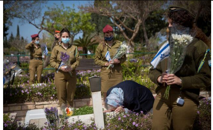
Israeli soldiers lay flowers and Israeli flags on the graves of fallen soldiers at the Kiryat Shaul Military Cemetery on April 13, 2021, ahead of Israeli Memorial Day, which begins tonight. *** Local Caption *** יום הזיכרון בית קברות חיילים דגלים חללים קרית שאול זיכרון בית קברות