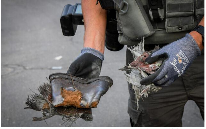
A rocket fired from the Gaza Strip that directly struck an apartment building in Ashkelon on May 11, 2021.