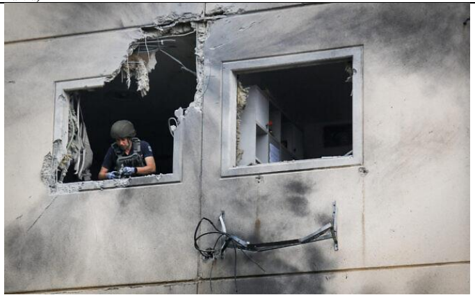
An apartment building that was hit by a rocket fired from the Gaza Strip in the city of Ashkelon on May 11, 2021.