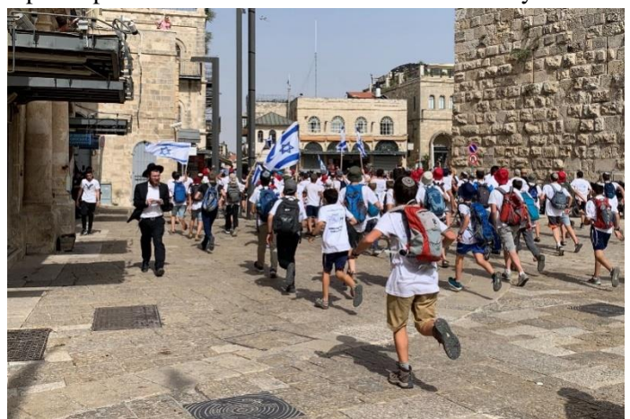
through Damascus Gate."

The decision came after the Israel Defense Forces, Shin Bet security service and military liaison to the Palestinians all recommended that the planned route of the march be changed to limit the chances of direct confrontations between the participants and the Muslim residents of the city.