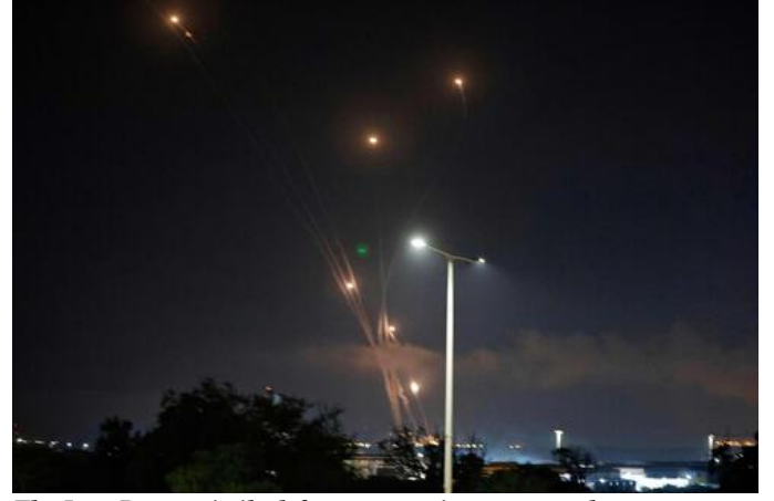
The Iron Dome missile defense system intercepts rockets over Ashkelon on Monday night

There were no reports of injuries in the wave of attacks, which set off sirens in multiple locations in the south. Two people did go to the ER at Barzilai Medical Center in Ashkelon suffering from shock.