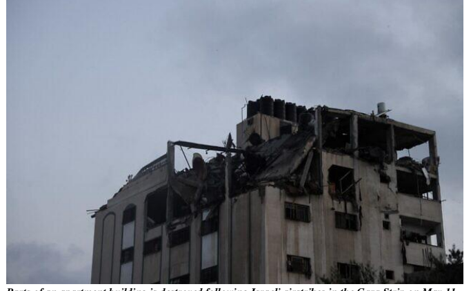
Parts of an apartment building is destroyed following Israeli airstrikes in the Gaza Strip on May II, 2021