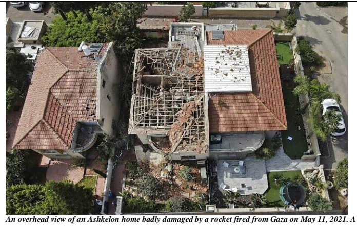
man was seriously hurt in the attack.