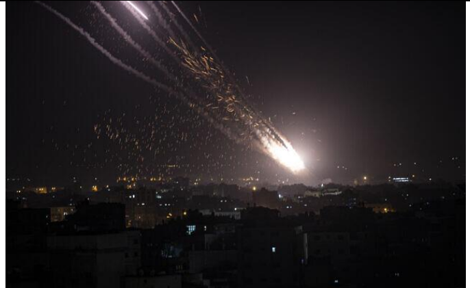
Rockets are launched from the Gaza Strip towards Israel, Monday, May. 10, 2021.

By Judah Ari Gross Today, 6:34 amUpdated at 1:42 pm