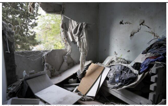
A picture taken early on May 11, 2021 shows a damaged building in the southern Israeli city of Ashkelon after rockets were fired by the Hamas terror group from the Gaza Strip towards Israel overnight amid spiraling violence