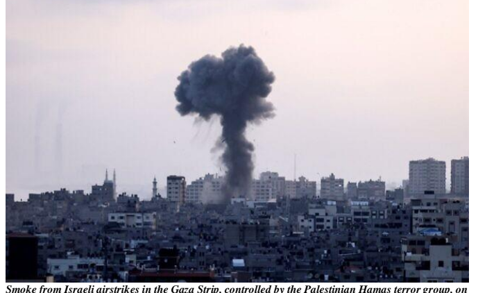
Smoke from Israeli airstrikes in the Gaza Strip, controlled by the Palestinian Hamas terror group, on May 11, 2021.

Palestinian terror groups in the Gaza Strip fired a massive barrages of rockets at southern Israel throughout Tuesday, wounding at least 24 people and drawing deadly retaliatory airstrikes from the Israel Defense Forces.