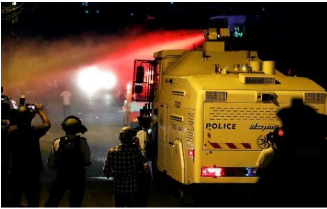
Israeli security forces spray Palestinian protesters with “skunk” water in the East Jerusalem neighborhood of Sheikh Jarrah on June 21, 2021, during clashes between Israelis and Palestinians.

The pending Sheikh Jarrah evictions have sparked widespread anger among Palestinians and Arab Israelis and international condemnation.