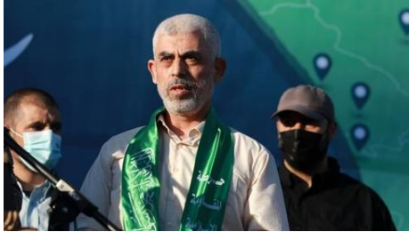
Hamis leader in the Gaza Strip Yahya Sinwar

The parties met in order to prevent last month's conflict between the Jewish State and Gaza's terrorist factions from rekindling, but Israel refused to comply with any of Hamas' demands.