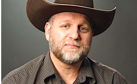
Ammon Bundy (Twitter profile)