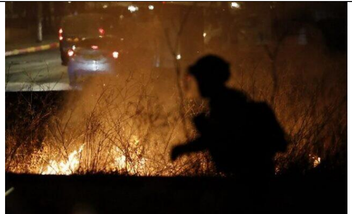
Israeli Border Guards in the east Jerusalem neighborhood of Sheikh Jarrah on June 21, 2021, during clashes between Israelis and Palestinians.

Palestinian protesters and Jewish residents clashed late Monday in a volatile East Jerusalem neighborhood before police moved in to disperse the Palestinians, wounding at least 20.