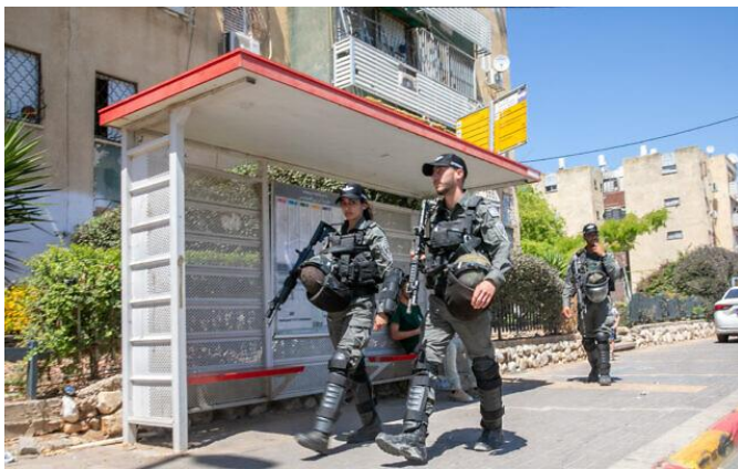
File: Border Police patrol the streets of the central Israeli city of Lod after riots. May 19, 2021

However, such rounds can kill, especially if used incorrectly. The use of the controversial rifle has been cited as a cause of death for Palestinians in clashes with Israeli troops.