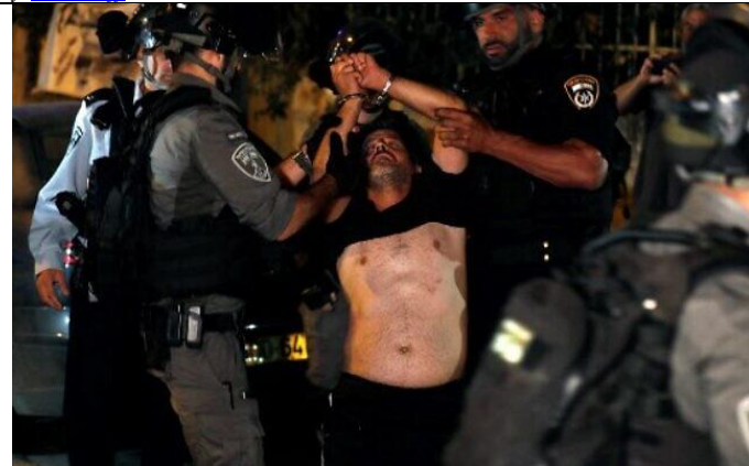
A Palestinian demonstrator is arrested by Israeli security forces during protests in the East Jerusalem neighborhood of in the Sheikh Jarrah on June 21, 2021.