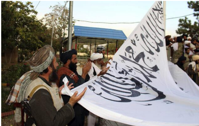
Taliban fighters pray while raising their flag at the Ghazni provincial governor’s house, in Ghazni, southeastern, Afghanistan, August 15, 2021.

“They evacuated the dogs who worked in the security forces, but not those who aided them. They took out their equipment, but left the human beings behind... these are the Americans,” Nasrallah said.