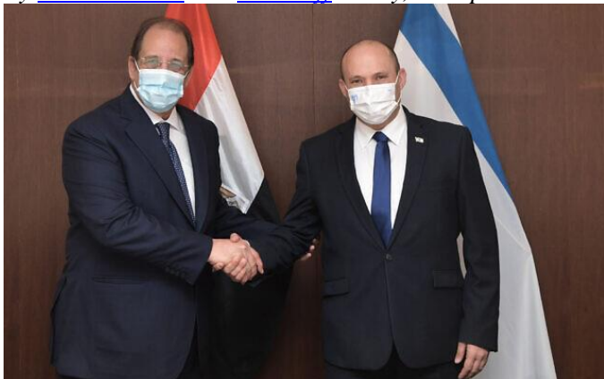
Prime Minister Naftali Bennett (right) meets with Abbas Kamel, the director of the Egyptian General Intelligence Directorate, in Jerusalem on August 18, 2021.