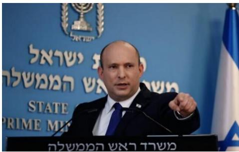
Prime Minister Naftali Bennett holds a press conference at his office in Jerusalem on August 18, 2021.

"Iran is at the most advanced point ever in the field of [uranium] enrichment, but we know and we have a plan to deal with this and maintain the security of Israeli citizens," Bennett added.