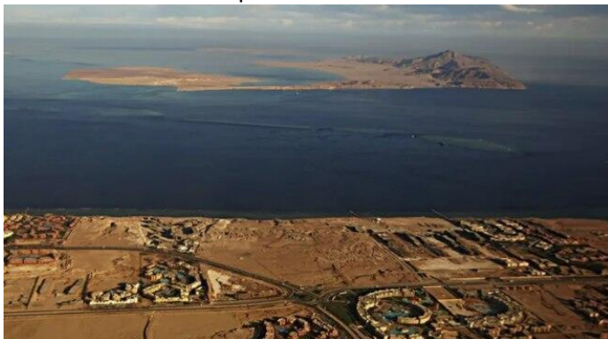
The Red Sea islands of Tiran (foreground) and Sanafir (background) are seen in the Strait of Tiran between Egypt's Sinai Peninsula and Saudi Arabia

The agreement fixing the maritime boundary between Egypt and Saudi Arabia was signed in 2016 despite opposition from some in Egypt. Tiran and Sanafir were returned to Egypt by Israel as part of the peace deal and some consider the islands sacred Egyptian land. Israel has demanded that the transfer of ownership of the islands does not violate its peace agreement with Egypt, which stipulated that a multinational force led by the United States would operate there.