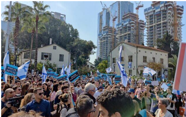
Israeli tech company employees stage a one-hour protest in Tel Aviv against judicial overhaul, January 24, 2023

Hundreds of workers in the tech sector held a one-hour warning strike on Tuesday, blocking roads in central Tel Aviv as they protested the government’s contentious plans to overhaul the judicial system.