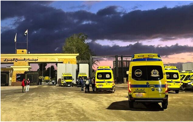
Ambulances wait on the Egyptian side of the Rafah Border Crossing with the Gaza Strip on February 4, 2026, days after Israel permitted a limited reopening of the Palestinian territory's border post.