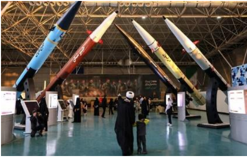
An Iranian man and a child visit an exhibition showcasing missile and drone achievements in Tehran on November 12, 2025.

More recently, the US navy built up forces in the region following Iran's violent crackdown against anti-government demonstrations last month, the deadliest since Iran's 1979 revolution.