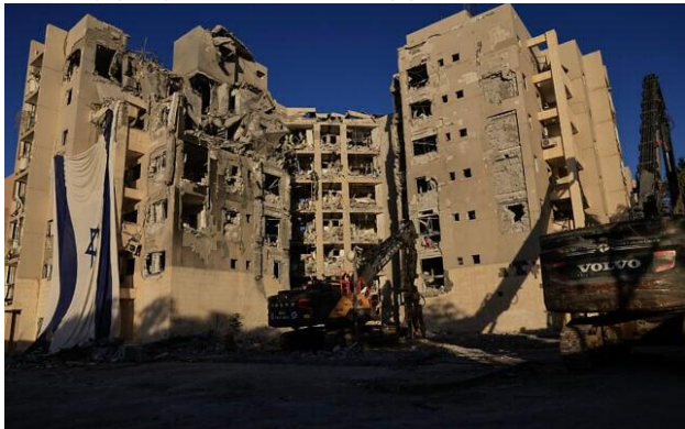
A high-rise residential building in Beersheba that was hit by an Iranian missile on the final day of the war in June, 2025, is demolished, on October 8, 2025.

Since the US strikes in June, Tehran has said its uranium enrichment work — which it says is for peaceful, not military purposes — has stopped.