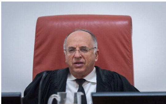
Supreme Court Deputy President Noam Sohlberg at a hearing at the court, in Jerusalem, February 2, 2026.

Deputy Supreme Court President Noam Sohlberg on Wednesday announced the panel of justices that will hear petitions to order the government to establish a state commission of inquiry into the October 7, 2023, Hamas invasion and atrocities.