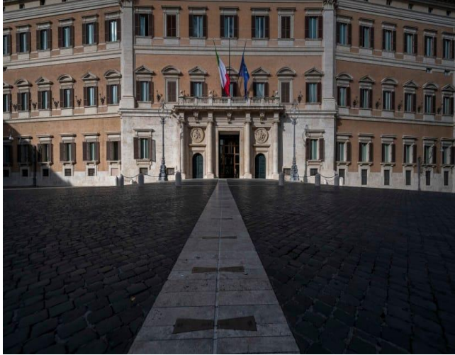
A general view of the Palazzo Montecitorio, seat of the Italian Chamber of Deputies, on October 16, 2020 in Rome, Italy.