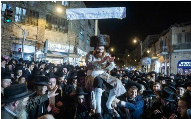
An ultra-Orthodox Jew takes part in a parade in the Mea Shearim neighborhood of Jerusalem for a Haredi draft dodger who was released from military prison, December 18, 2025.

“We wish donors would contribute for every young man. Furthermore, we tried to launch a grant program for every detainee but for various reasons, it hasn’t materialized yet,” a spokesman for the group lamented in an email.