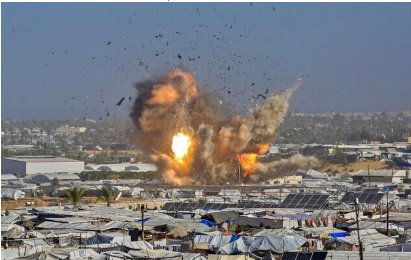
An Israeli airstrike in the west of Khan Younis, southern Gaza Strip, January 31, 2026.

Palestinian terror operatives have killed four Israeli soldiers since the truce, according to Israeli authorities.