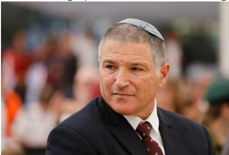
Shin Bet Director David Zini

“During the fighting, and especially after the ceasefire, Hamas and terror groups have worked to rebuild and strengthen their military and civilian systems, including restoring damaged military infrastructure, recruiting and training operatives and resuming logistical and command functions,” officials said.