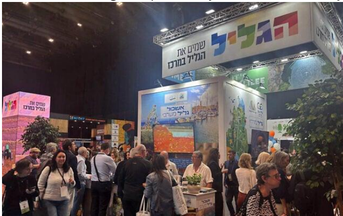
Visitors at the annual International Mediterranean Tourism Market (IMTM) fair in Tel Aviv, Feb. 3, 2026.

While the war in Gaza wound down following a ceasefire agreement signed in October, current tensions over a potential US attack on Iran are stoking uncertainty over the security situation. Tehran has said it would strike US allies in the region, specifically Israel, if attacked by Washington.