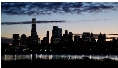
The skyline of Lower Manhattan is seen at dawn from across the Hudson River in New York City, US, October 18, 2025.

. By JERUSALEM POST STAFF FEBRUARY 4, 2026 20:09Updated: FEBRUARY 4, 2026 21:53