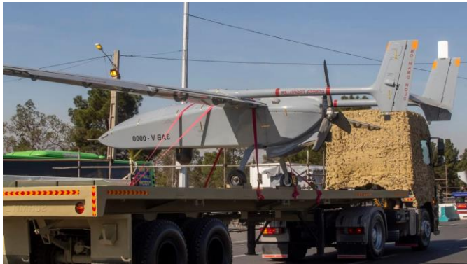
Iranian Army drone fleet parades on the occasion of National Army Day on April 18, 2025 in Tehran, Iran.

By DANIELLE GREYMAN-KENNARD FEBRUARY 4, 2026 20:52 Updated: FEBRUARY 4, 2026 22:10