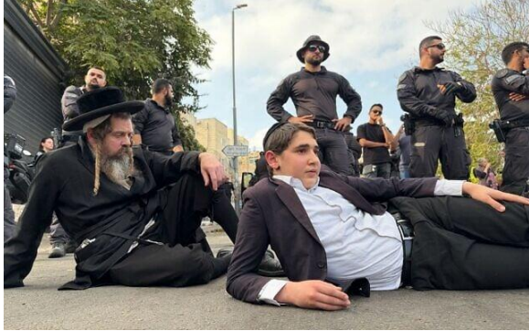
Haredi men block the road outside the IDF recruitment center in Jerusalem on November 12, 2025.

Some 80,000 ultra-Orthodox men aged between 18 and 24 are currently believed to be eligible for military service, but have not enlisted.