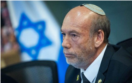
State Comptroller Matanyahu Englman attends a meeting at the Knesset in Jerusalem on May 12, 2025.

Netanyahu described the decision by the High Court to halt the comptroller's October 7 investigation six days after his own testimony as having "unusual timing," according to the Knesset spokesman.