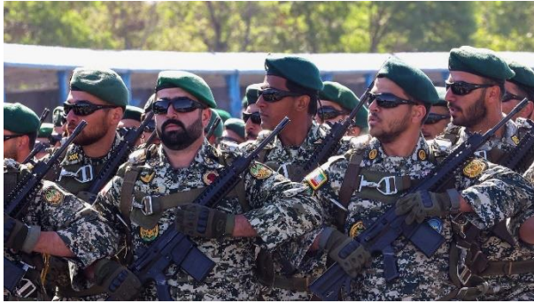
Soldiers march during a military parade to mark the Iran's annual Army Day in Tehran on April 18, 2025.

Iran has published a detailed concept for war with the United States, describing missile barrages, proxy escalation, cyber operations, and threats to global oil flows, according to the IRGC-linked Tasnim news agency.