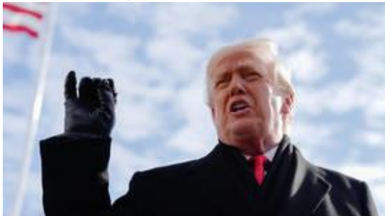
FILE PHOTO: US President Donald Trump.

US nuclear experts should work on a new and “modernized” deal instead, the president has said