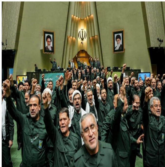
According to IRGC-aligned Fars News Agency, the Khorramshahr 4 has an accuracy of around 30 meters and is “one of the main pillars of Iran’s active deterrence.”

According to Press TV, the Khorramshahr 4 has a range of 2,000 km (1,240 miles) and is capable of carrying a 1,500 kg warhead .