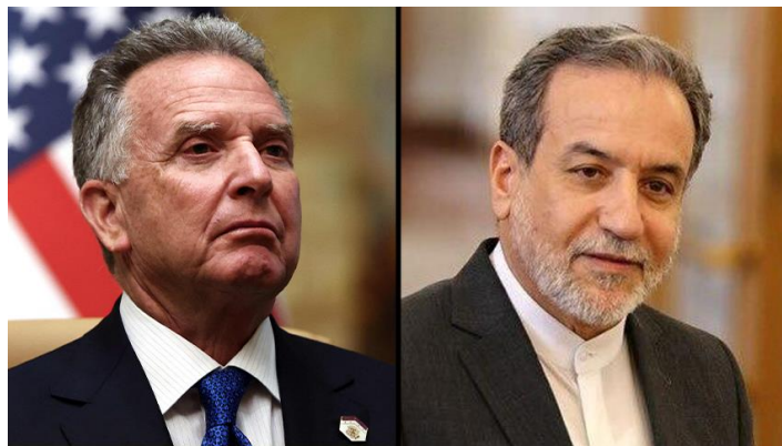
Iranian Foreign Minister Araghchi and US envoy Witkoff, who are set to meet tomorrow in Oman

goal of the talks would be to formulate a "framework" for an agreement.