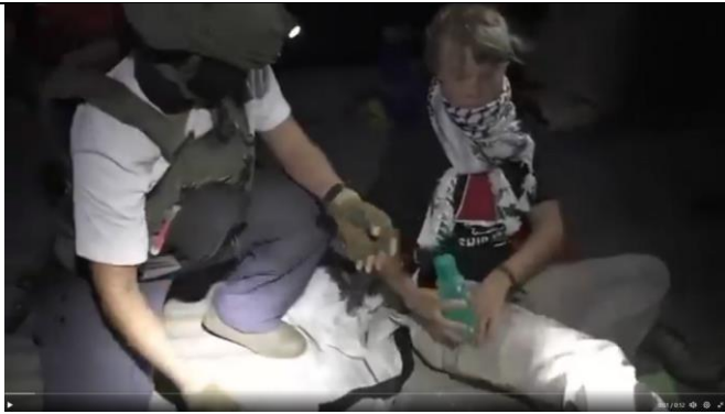
Greta Thunberg after being detained by the Israeli Navy during the previous flotilla in October