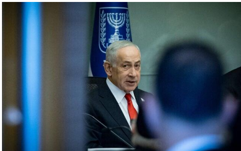
Prime Minister Benjamin Netanyahu takes part in a Foreign Affairs and Defense Committee meeting at the Knesset in Jerusalem on February 5, 2026.

Addressing a closed meeting of the Knesset Foreign Affairs and Defense Committee on Thursday, Prime Minister Benjamin Netanyahu reportedly sought to once again distance himself from the failures surrounding Hamas's October 7, 2023, attack, averring that the intelligence presented to him did not indicate such an invasion and that his previous efforts to deter Hamas