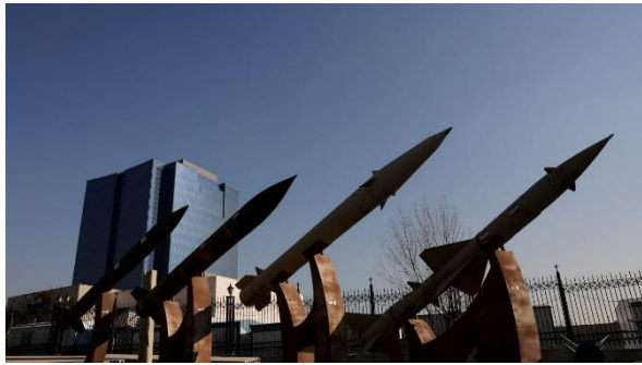
Iranian missiles are displayed in a park in Tehran, Iran, January 31, 2026

By REUTERS , GOLDIE KATZ FEBRUARY 5, 2026 22:18 Updated: FEBRUARY 5, 2026 23:13