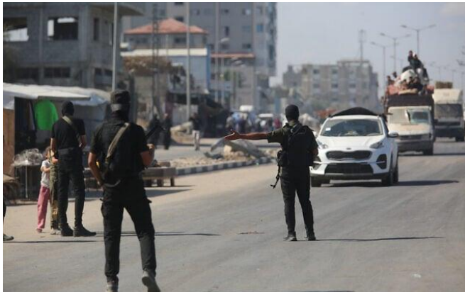
Hamas police forces deploy in Gaza City on October 11, 2025.

“Only a couple of housing projects is not going to defeat Hamas. You need to do a lot... to have an effect,” he said.