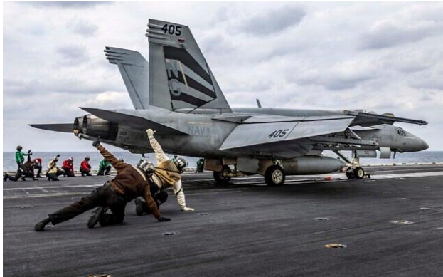
In this handout photo released by the US Navy on January 31, 2026, an F/A-18E Super Hornet attached to Strike Fighter Squadron (VFA) 151 launches from the flight deck of the Nimitz-class aircraft carrier USS Abraham Lincoln (CVN-72) as it conducts routine flight operations in the Arabian Sea on January 28, 2026

More recently, the US built up forces in the region following Iran's violent crackdown against anti-government demonstrations last month, the deadliest since Iran's 1979 revolution.