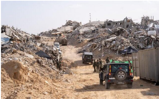
IDF soldiers stand amid rubble in the Rafah area of the southern Gaza Strip, December 8, 2025.

The United Arab Emirates has drafted plans to build a compound to house thousands of displaced Palestinians in a part of south Gaza under Israeli military control, according to a map seen by Reuters and people briefed on the plans.