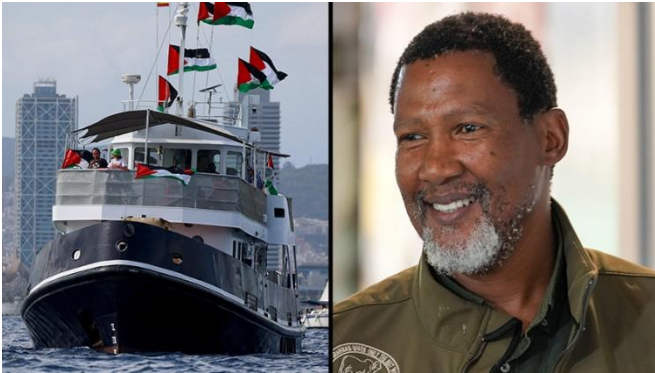
(Photo: REUTERS/Nacho Doce, AP Photo/Jerome Delay) Announcement of a New Flotilla to Gaza (Video: Reuters)

As with the earlier flotilla, which the Israeli Navy intercepted in October last year at the height of Yom Kippur, the new effort is being organized by the protest group the Global Sumud Flotilla. The October flotilla, which was preceded by two smaller sailings in June and July, involved 40 boats and ships. Israel detained 450 participants, including Swedish climate activist Greta Thunberg. They were later deported to their home countries.