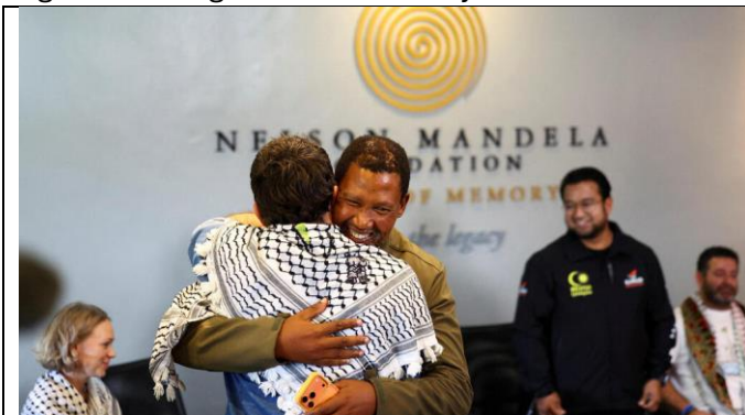
Mandela's grandson embraces an activist wearing a keffiyeh at the news conference

No precise launch date has been announced. Activists say the flotilla will also be accompanied by an overland convoy. They expressed hope that the convoy would attract thousands more participants in countries such as Tunisia and Egypt, though it is considered highly likely that authorities in Cairo would prevent them from reaching the Gaza border in the Sinai Peninsula. Sumud said the initiative is intended not only to break the blockade and deliver what it described as life-saving humanitarian aid, but also to establish a sustained civilian presence in Gaza. According to the group, teams including medical personnel, teachers, engineers and unarmed civilian volunteers would work alongside Palestinians to help them cope with what it calls ongoing Israeli attacks and to begin rebuilding the health care system and basic infrastructure damaged over the past two years.