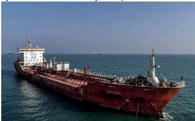
Illustrative: This picture taken on October 31, 2022, shows an oil tanker seized by Iranian naval forces at the Gulf port of Bandar Abbas in southern Iran.

TEHRAN — Iran’s Islamic Revolutionary Guard Corps (IRGC) on Thursday seized two oil tankers with their foreign crews in Gulf waters for “smuggling fuel,” the Tasnim news agency reported.