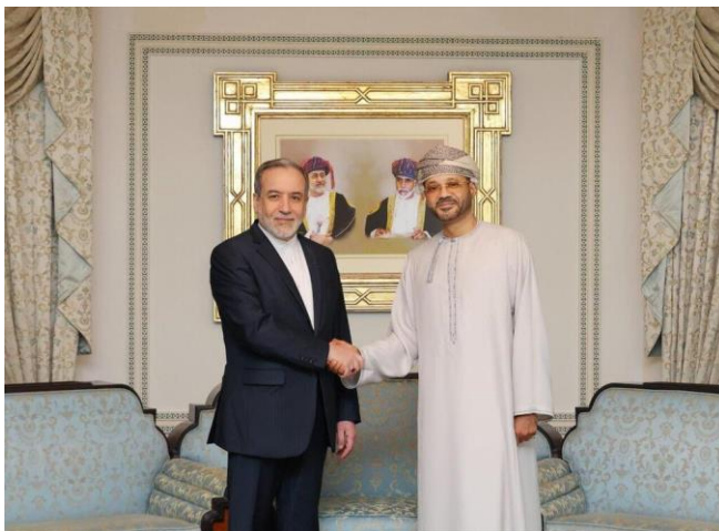
Abbas Araghchi

He added that attacks on Iran's nuclear facilities had failed to achieve their goals. "The only option left to them is negotiations," he said. "We do not accept dictates or control from anyone and are prepared to answer any question."