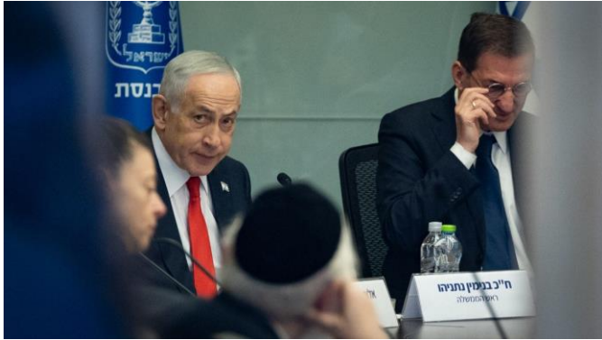
Prime Minister Benjamin Netanyahu attends a Defense and Foreign Affairs Committee meeting at the Knesset, in Jerusalem, February 5, 2026

By JERUSALEM POST STAFF FEBRUARY 8, 2026 20:59 Updated: FEBRUARY 8, 2026 22:17