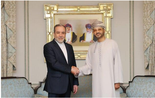
In this photo released by Oman's Foreign Ministry, Iranian Foreign Minister Abbas Araghchi, left, shakes hands with his Omani counterpart Sayyid Badr al-Busaidi during their meeting prior to indirect US-Iran negotiations, in Muscat, Oman, February 6, 2026.

It remained unclear on Sunday when and where, or if, there will be a second round of talks. Trump, after the talks Friday, offered few details but said: “Iran looks like they want to make a deal very badly — as they should.”