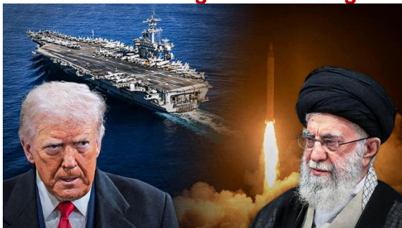
Donald Trump and Ali Khamenei

If an agreement of this kind does take shape, Israel should support the United States and not condition its backing on dismantling Iran's missile program or ending its support for regional proxies.