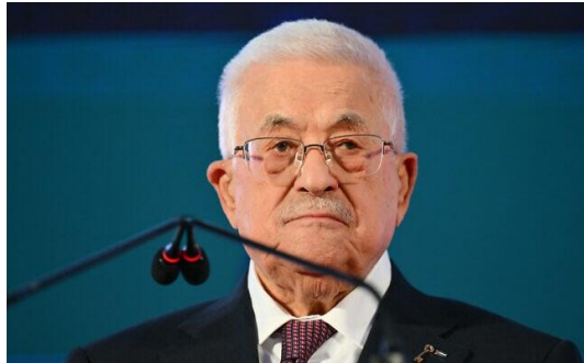
Palestinian Authority President Mahmoud Abbas attends the Atreju political meeting organized by the young militants of Italian right-wing party Brothers of Italy (Fratelli d'Italia) on December 12, 2025, in Rome.

WAFA said Abbas's office "warned of the dangers of any infringement upon Islamic and Christian holy sites, emphasizing that any violation of the Ibrahimi Mosque and the transfer of authority over it are unacceptable," using a Muslim term for the Hebron compound.