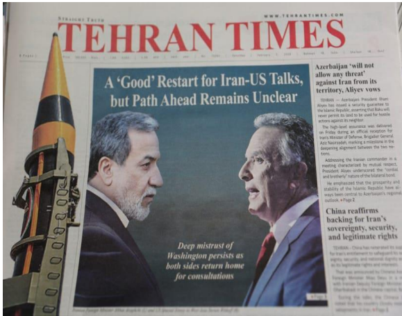
Tehran Times, an Iranian newspaper, with the cover photo of Iranian Foreign Minister Abbas Araghchi and US special envoy Steve Witkoff, February 7, 2026.

Prime Minister Benjamin Netanyahu will depart on Tuesday for a meeting with US President Donald Trump at the White House, scheduled to take place on Wednesday.