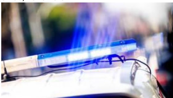
FILE PHOTO.

Three Ukrainian draft officers have been detained in the city of Dnepr for allegedly beating a 55-year-old civilian to death, local police have said.