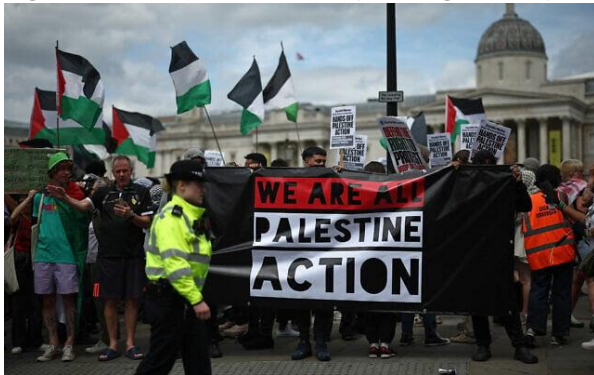
Police officers monitor protesters holding a banner during a protest in support of the anti-Israel, pro-Palestinian group Palestine Action, in Trafalgar Square, central London, on June 23, 2025.