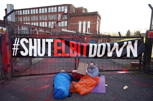
Illustrative — Activists from the Extinction Rebellion North and Palestine Action groups protest at the gates of the Elbit Ferranti factory in Waterhead, Oldham, in north-west England on February 1, 2021.

The defendants argued the attack was aimed at destroying weapons to halt what they described as Israel’s “genocide” in Gaza, following the Hamas-led October 7, 2023, massacre and Israel’s subsequent military campaign. They insisted they did not intend to harm people, despite police bodycam footage shown at trial depicting Corner striking an officer with a sledgehammer.