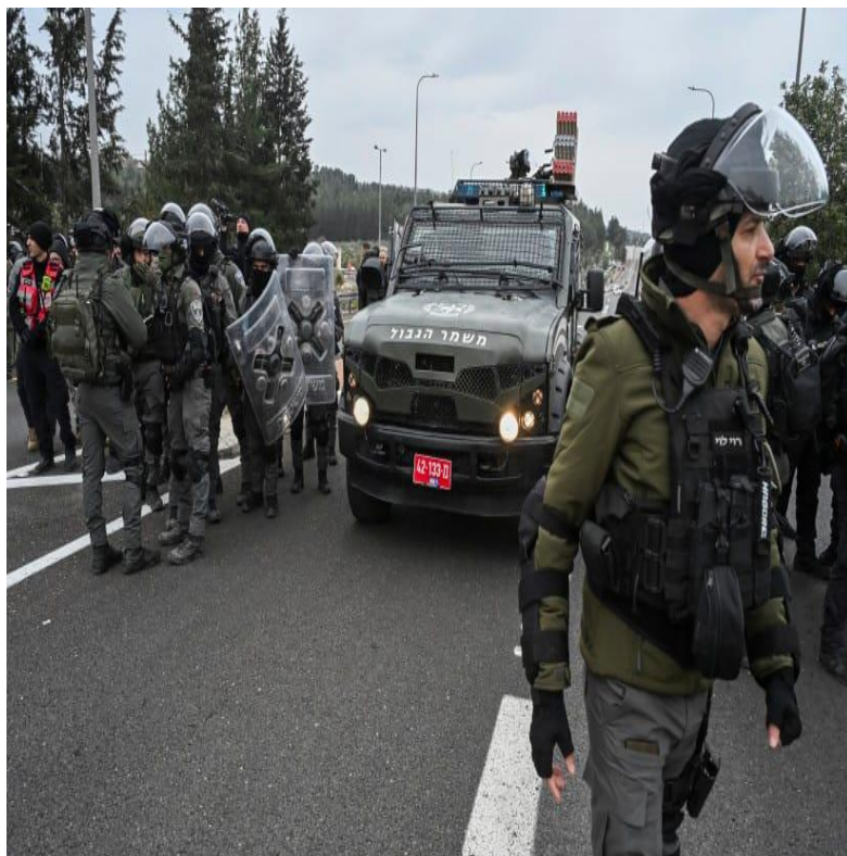
Members of the Arab community in Israel protest against the violence in their community, in Sakhnin, northern Israel, January 22, 2026.