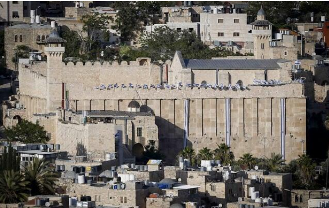
A view of the Tomb of the Patriarchs after Israeli officials hung Israeli flags on its fortification and put a seven-branched candelabrum, menorah, on it in Hebron, in the West Bank, on April 29, 2025.

Until now, in accordance with the 1997 Hebron Agreement, any construction changes in the Jewish community had to pass through both the municipality and the Civil Administration. With the cabinet's approval, such changes will now require authorization only from Israel's defense establishment.