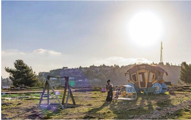
An Israeli family is seen at the outpost of Yahish Zion, near the settlement of Psagot, in the West Bank, on February 4, 2026.

Defense Minister Israel Katz and Finance Minister Bezalel Smotrich on Sunday announced a series of security cabinet decisions to “dramatically” change land registration and property acquisition procedures in the West Bank, easing Jewish settlement in the territory.