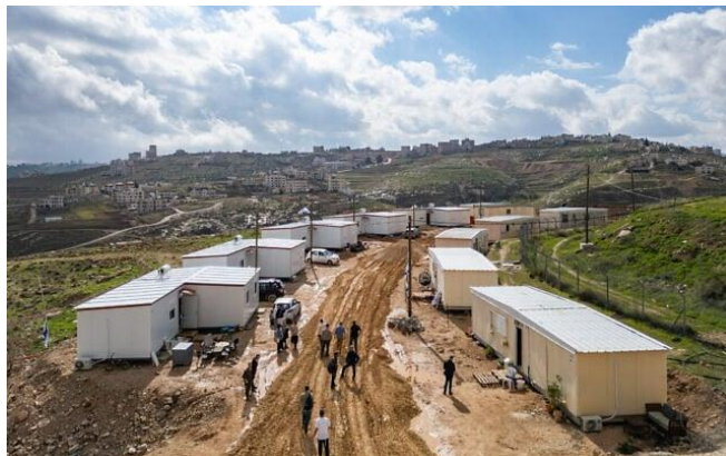
A general view of the newly established Jewish settlement of Yatziv in the Gush Etzion area of the West Bank, January 19, 2026.

that the decisions "rectified an injustice of many years and are entrenching Israeli sovereignty on the ground, de facto."