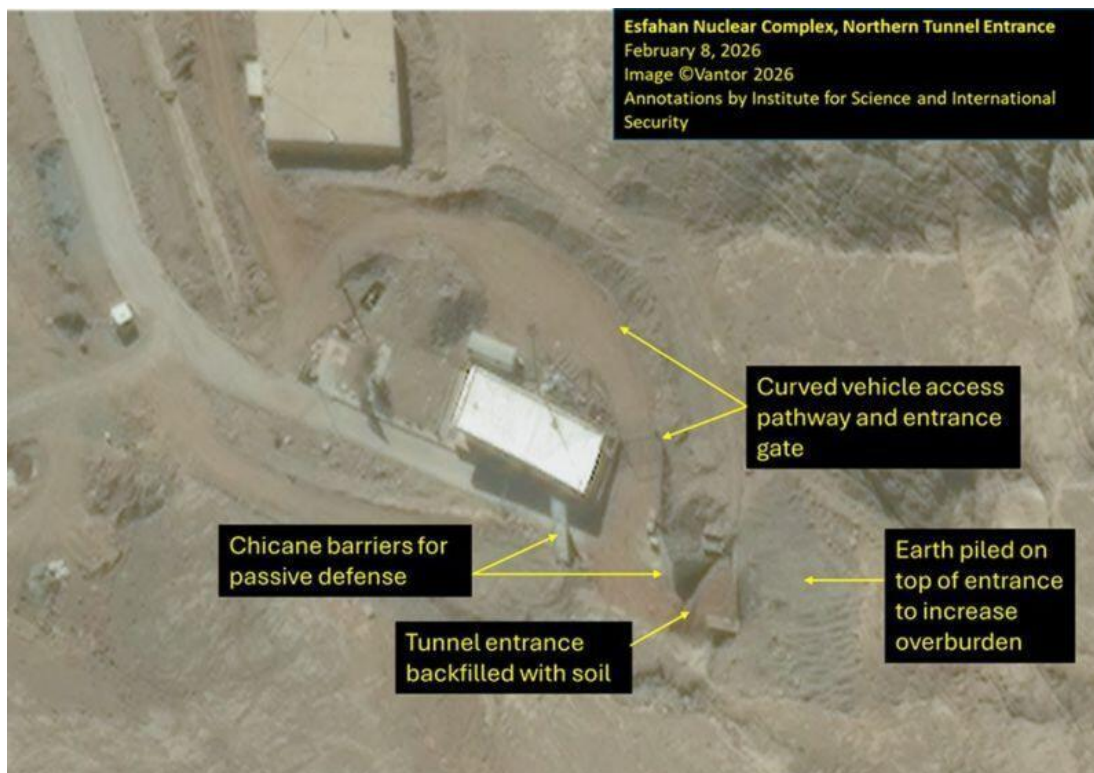
The northern tunnel entrance

It is also possible that Iran transferred equipment or certain materials into the tunnels to protect them. Similar preparations were documented in the days before the United States joined the 12-day war in Operation 'Midnight Hammer,' when the facilities at Fordow, Natanz and Isfahan were attacked.