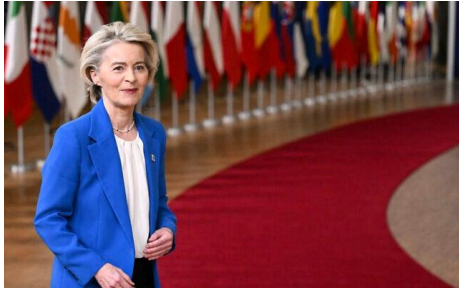
European Commission President Ursula von der Leyen looks on as she arrives to attend the European Council meeting in Brussels on December 18, 2025.

Israel has pushed for years for a normalization deal with Riyadh, which has called for a Palestinian state in return. Recently, however, Saudi Arabia has signaled a move away from normalization.