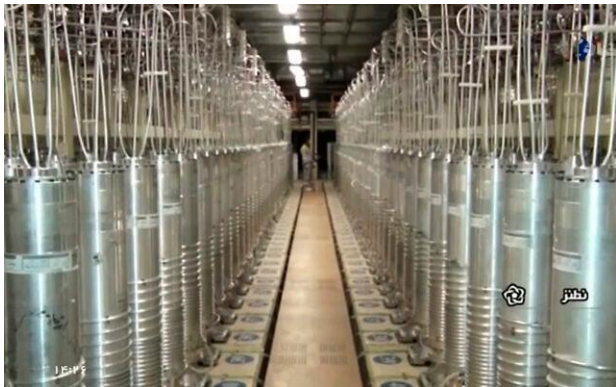
Centrifuges line a hall at the Uranium Enrichment Facility in Natanz, Iran, in a still image from a video aired by the Islamic Republic Iran Broadcasting company on April 17, 2021, six days after the hall had been damaged in a mysterious attack.

At the talks in Oman last week, the US and Iran agreed to discuss Tehran’s nuclear program, though Washington and Israel also want to put Iran’s ballistic missiles and its support for proxy terror groups in the region on the agenda. Iran has rejected this.