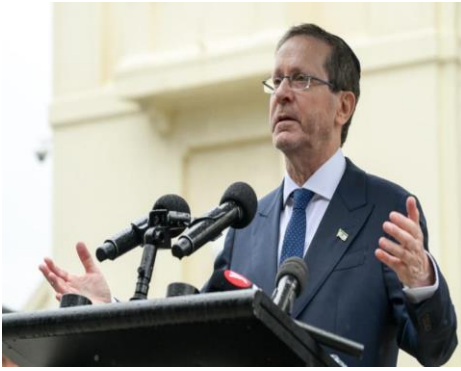
President Isaac Herzog speaks at Bondi Beach during a state visit to Australia, in Sydney, February 9, 2026