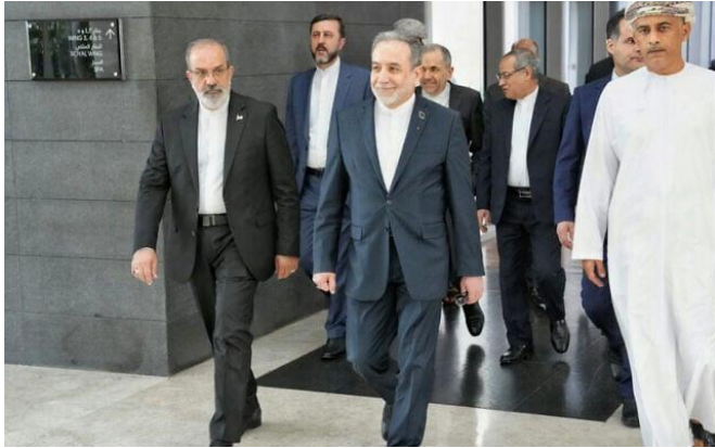
Iranian Foreign Minister Abbas Araghchi, center, heads to the venue for talks between Iran and the US, in Muscat, Oman, February 6, 2026.

“In response to a question about the possibility of diluting 60 percent enriched uranium,” IRNA reported, Eslami “said this depends on whether all sanctions would be lifted in return.”