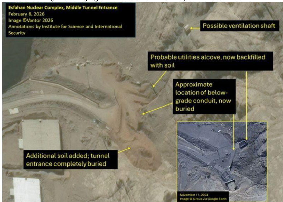
The central tunnel entrance

Researchers said the measures suggest Iran is concerned about a possible American or Israeli airstrike, as well as a potential raid on the nuclear facility. Filling the tunnel entrances would reduce the damage from an aerial attack and complicate ground access in the event of a special forces operation aimed at seizing or destroying enriched uranium that may be stored at the site.