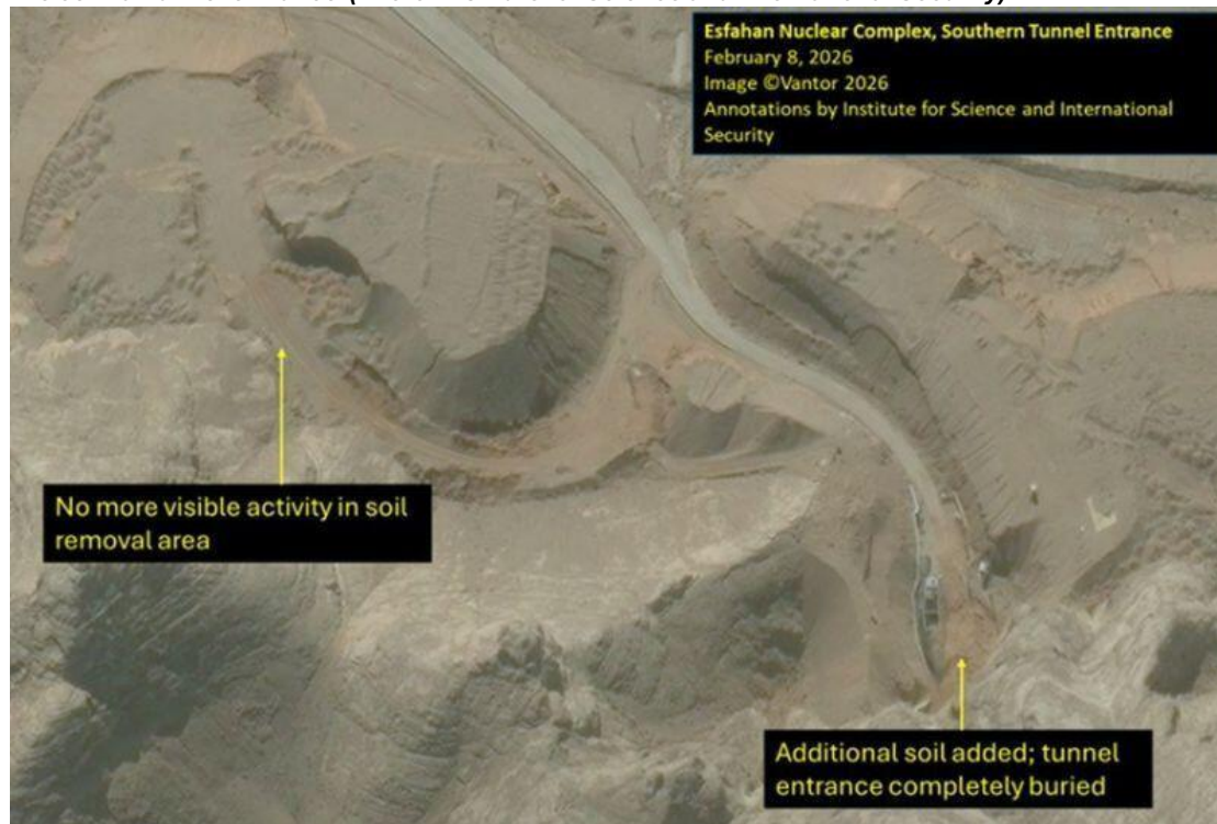
The southern tunnel entrance