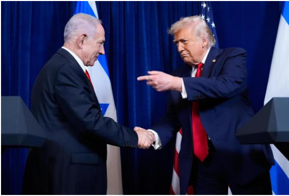
Prime Minister Benjamin Netanyahu and President Donald Trump

and will be held without media presence, a departure from the leaders' past encounters, which typically included joint press events and photo ops.