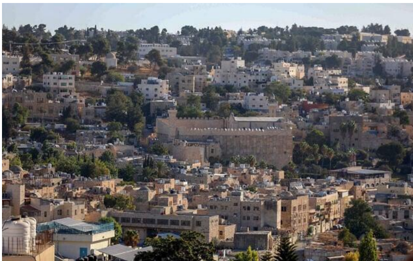
The Tomb of the Patriarchs is seen in Hebron, in the West Bank, on September 30, 2025.

"These unilateral measures aim to undermine any political horizon, dismantle the two-state solution, and drag the region into further tension and instability," PA Vice President Hussein al-Sheikh posted on X . "We call on the US administration and the international community to intervene immediately to halt this occupation-driven aggression."