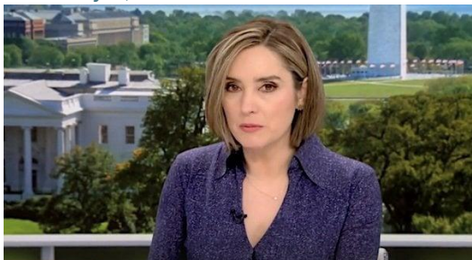
Margaret Brennan of CBS News

CBS host Margaret Brennan exhibited shock during Sunday's "Face the Nation" after Republican Texas Rep. Tony Gonzales said the U.S. should enforce its laws, before questioning the lawmaker how he could support the deportation of a family.