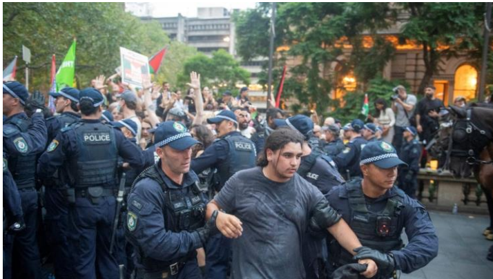
Police officers remove demonstrators gathered at Town Hall Square to protest against President Isaac Herzog's state visit to Australia, in Sydney, Australia, February 9, 2026

By REUTERS FEBRUARY 9, 2026 12:58 Updated: FEBRUARY 9, 2026 14:05