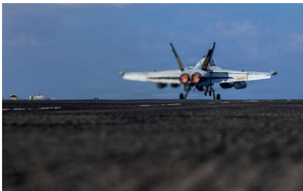
In a handout image, an EA-18G Growler launches from the flight deck of the Nimitz-class aircraft carrier USS Abraham Lincoln in the Indian Ocean on January 23, 2026.

"The Islamic Republic's missile capabilities are non-negotiable," Ali Shamkhani, an adviser to Iran's supreme leader, said on Wednesday.