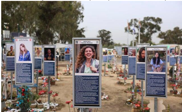
The memorial site for the Nova music festival massacre in southern Israel, February 9, 2026.

11 February 2026, 6:31 pm Updated at 6:48 pm