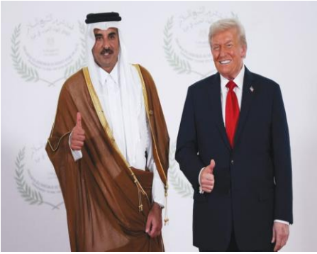
US President Donald Trump and Emir of Qatar Sheikh Tamim bin Hamad Al Thani attend a world leaders' summit on ending the Gaza war, in Sharm el-Sheikh, Egypt, late last year.