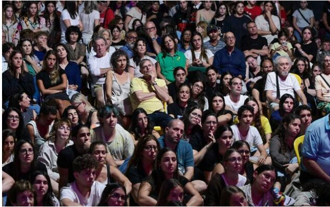
People watch on a screen the civilian October 7 memorial ceremony held at Hayarkon Park in Tel Aviv, during a gathering at Hostage Square in Tel Aviv, on October 7, 2025.

But Abir linked the name change to Netanyahu’s efforts to set up a politically appointed investigation of the attack rather than a state commission of inquiry. She said the Knesset committee was “changing the narrative” before a commission of inquiry had been set up to establish what went wrong surrounding the attack.