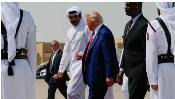
US President Donald Trump is escorted by Qatar’s Emir Tamim bin Hamad Al Thani towards Air Force One, as he departs Al Udeid Air Base, en-route to Abu Dhabi, United Arab Emirates, in Doha, Qatar, May 15, 2025.