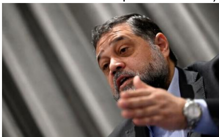
Hamas official Osama Hamdan speaks during an interview with AFP in Istanbul, Turkey, on September 15, 2024.

(That is not what the plan states. The ISF is meant to “train and provide support to vetted Palestinian police forces in Gaza,” provide a “long-term internal security solution,” and “help secure border areas, along with newly trained Palestinian police forces.”)