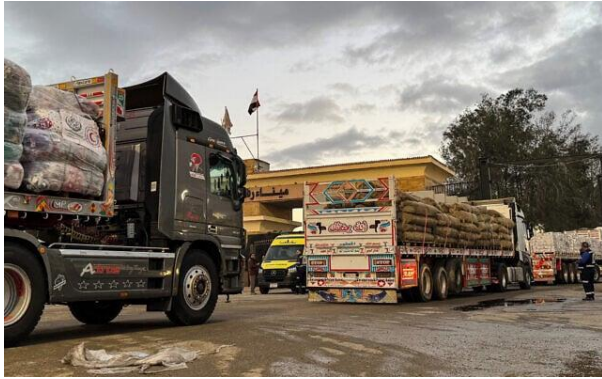
Humanitarian aid trucks enter through the Egyptian side of the Rafah border crossing with the Gaza Strip on February 4, 2026, days after Israel permitted a limited reopening of the border post.

He also accused Israel of obstructing operations at the Rafah Border Crossing and of letting only very few people through since it reopened earlier this month, as part of the Gaza ceasefire.