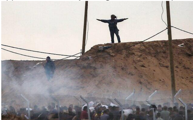
Illustrative: Members of a private US security company contracted by the Gaza Humanitarian Foundation direct displaced Palestinians as they gather to receive relief supplies at a distribution center in the central Gaza Strip, as smoke bombs are fired by Israeli troops, June 8, 2025.

The GHF did not respond to a request for comment sent to its press email. It consistently defended its approach to security during the months it operated in Gaza.