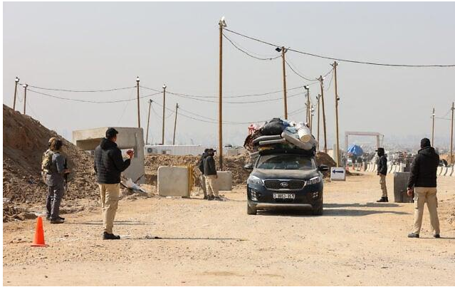
Displaced Palestinians cross a checkpoint manned by US and Egyptian security at the Netzarim corridor as people make their way from the south to the northern parts of the Gaza Strip, on Salah al-Din road in central Gaza, on January 29, 2025.

security, UG Solutions is planning internally for a range of possible ways to support efforts in Gaza,” the spokesperson said.