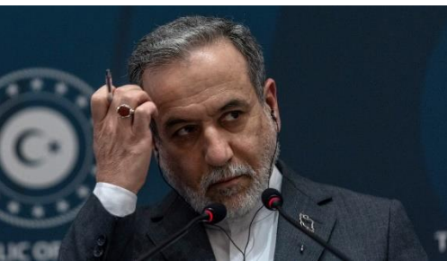
Iranian Foreign Minister Abbas Araghchi gives a statement at the Ritz Hotel as he meets Turkey's Foreign Minister Hakan Fidan, on January 30, 2026 in Istanbul, Turkey.

By SETH J. FRANTZMAN FEBRUARY 11, 2026 14:29 Updated: FEBRUARY 11, 2026 17:45