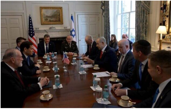
Prime Minister Benjamin Netanyahu meets at Blair House in Washington with US Secretary of State Marco Rubio and their delegations, February 11, 2026.

The day before the meeting, Trump stressed to the Axios news site that he opposes any Israeli move toward annexing the West Bank, declaring, "I am against annexation."