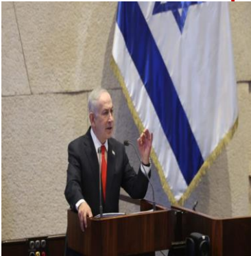
Prime Minister Benjamin Netanyahu speaks at a ceremonial Knesset plenum session to mark the establishment of Israel's parliament. February 2, 2026.

Meanwhile, US Vice President JD Vance is in Azerbaijan, north of Iran, and US Secretary of State Marco Rubio is expected to visit several European countries.