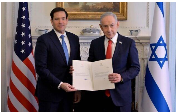
Prime Minister Benjamin Netanyahu (right) meets US Secretary of State Marco Rubio in Washington and joins the Board of Peace on February 11, 2025.

"The prime minister emphasized Israel's security needs in the context of the negotiations, and the two agreed to maintain close coordination and ongoing communication," said the Prime Minister's Office.