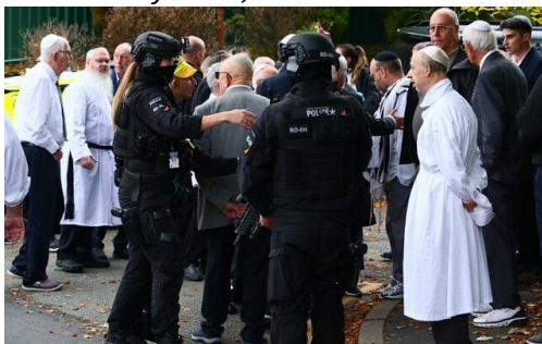
Armed police officers talk with members of the community near Heaton Park Hebrew Congregation synagogue in Crumpsall, north Manchester, on October 2, 2025

Antisemitic incidents in the United Kingdom reached their second-highest level on record in 2025, led by the deadly terror attack targeting a Manchester synagogue on Yom Kippur, according to a new report released Wednesday by the Community Security Trust.