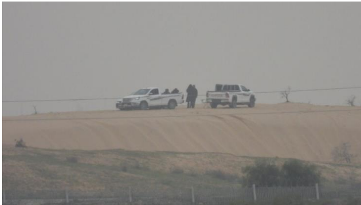
White pickup trucks spotted on the Egyptian side of the Israel-Egypt border, February 11, 2026.

In an afternoon statement, the Eshkol Regional Council noted that several gatherings of this type along the Egyptian side of the border have been reported in recent days. By MIRIAM SELA-EITAM FEBRUARY 11, 2026 17:48 Updated: FEBRUARY 11, 2026 21:14