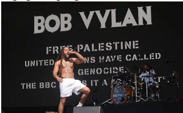
The Bob Vylan duo performs at the Glastonbury Festival, June 28, 2025.

More than half of all antisemitic incidents referenced Israel, Palestine, Hamas or the ongoing war in the Middle East, according to the report. Nearly half showed explicitly anti-Zionist motivation alongside anti-Jewish language or targeting. Nazi and Holocaust-related imagery or rhetoric appeared in 27% of all incidents.