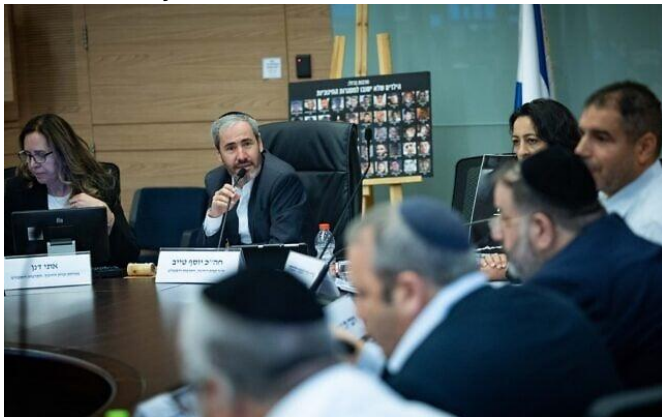
MK Yosef Taieb leads a Knesset Education, Culture, and Sports Committee meeting, July 7, 2025.

But Elbaz sparked controversy during the committee discussion when he said that in describing the Hamas onslaught in which 1,200 people were killed and 251 kidnapped, the office preferred to use a Hebrew word that literally means "events," but has also been used in the past to refer to riots. The reason, he said, is that October 7 "was not only a massacre — there was also heroism."