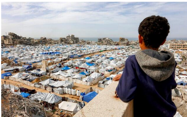
A boy looks at tents sheltering Palestinians displaced by conflict pitched near destroyed and heavily damaged buildings in the Muqusi area of Gaza City on February 7, 2026.

The political and security establishments in Israel do not expect a deal to emerge, the report added, saying that Netanyahu seeks to preserve Israel’s freedom of action surrounding Tehran, regardless of whether a deal is reached.