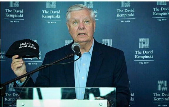
US Senator Lindsey Graham speaks during a press conference in Tel Aviv, February 16, 2026.