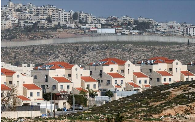
The East Jerusalem neighborhood of Neve Yaakov (foreground) and the Palestinian neighborhood of al-Ram (background) are seen separated by Israel's West Bank security barrier on February 16, 2026.

A recent development agreement signed by the state and the West Bank's Mateh Binyamin Regional Council will, once given final approval, see the establishment of a new settlement that would in practice constitute the first expansion of Jerusalem since 1967.