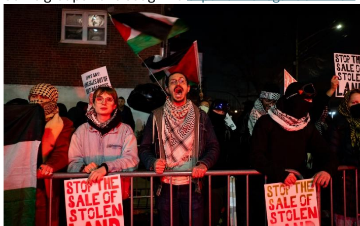
Anti-Zionist protesters outside a synagogue in New York City, January 8, 2026.

Some groups have sought to expand the legal definition of genocide to condemn the Jewish state.