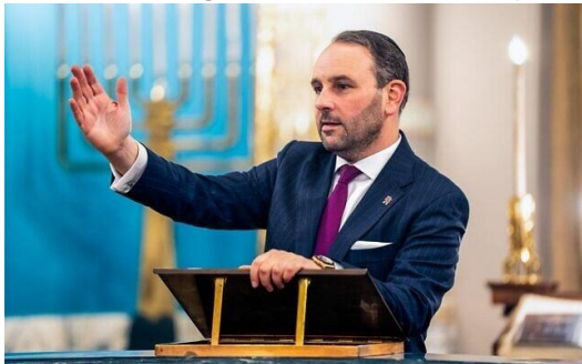
Belgian MP Michael Freilich speaking to an audience in a synagogue in Belgium.

“I repeat my call to the health minister to accept the outstretched hand of the Jewish community to try to find a solution and regulate the practice,” Freilich added. “We need to see how we can implement the highest levels of health and medicine within the requirements of religious freedom. Other countries such as Sweden, Germany, and the United Kingdom have shown it is possible, and we must do the same here.”