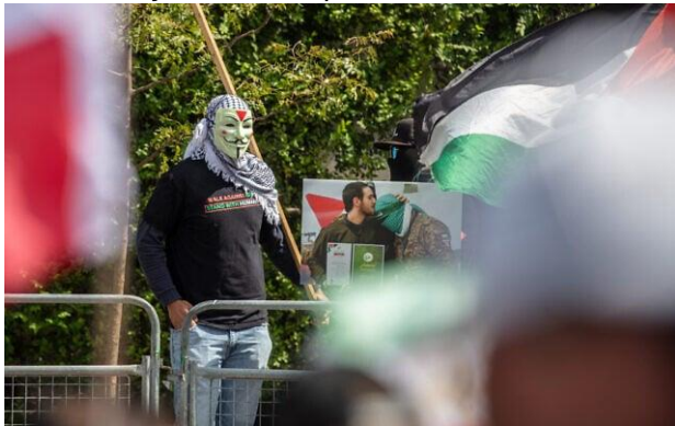
Anti-Zionist protesters in Toronto, Canada, August 31, 2025.

Anti-Zionist groups in Canada last week launched a campaign against Jewish children's summer camps, marking a new front in activists' global effort to dismantle the Jewish state and demonize its supporters.