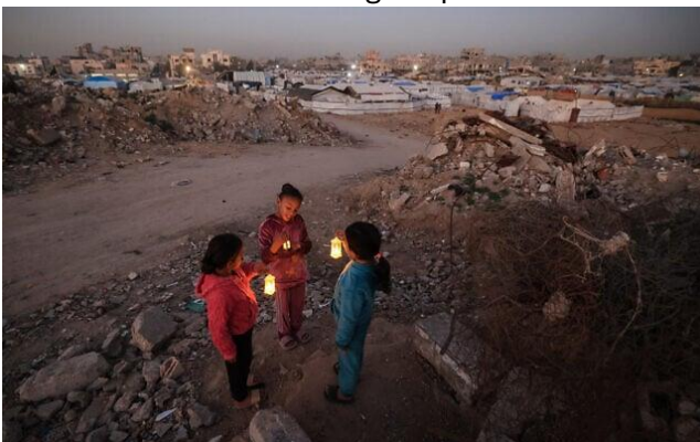
Young displaced Palestinians play on the ruins of destroyed buildings, carrying Ramadan lanterns used as decorations, in the Bureij refugee camp in the central Gaza Strip on February 15, 2026.

The IDF said it is continuing to operate in the area “to eliminate the terrorists in the tunnel routes.”