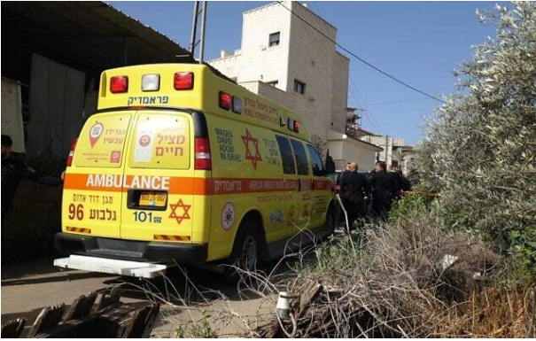
Paramedics and police gather at the scene of a shooting that killed two men in Umm al-Fahm on February 16, 2026.

A father and son were shot to death Monday morning while driving in Umm al-Fahm as violent crime continued at an unprecedented rate in Arab society.