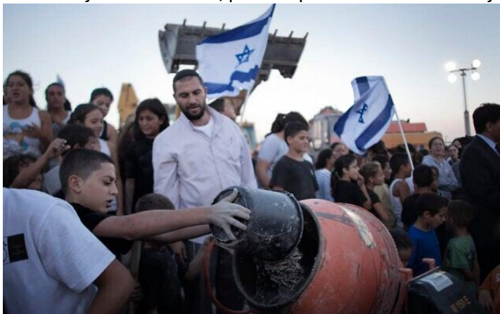
An Israeli boy throws water mixed with cement powder into a mixer in the Jewish settlement of Adam, several kilometers from the Palestinian city of Ramallah on September 1, 2010, in a defiant move to protest the killing of four settlers the previous night.

The settlement would be built on 500 dunams of land between the Palestinian towns of Hizma and Al-Ram, and would involve an investment by the government of some NIS 120 million ($39 million) in order to construct the necessary infrastructure, public spaces and community institutions for the new development.