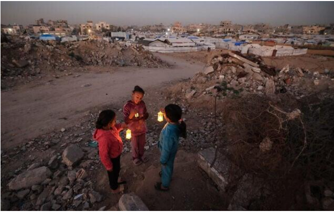
Young displaced Palestinians play on the ruins of destroyed buildings, carrying Ramadan lanterns used as decorations, in the Bureij refugee camp in the central Gaza Strip on February 15, 2026.

Elsewhere in the Strip, the IDF said late Sunday night that it struck terror operatives who engaged in “suspicious activity on the ground” and approached troops in the northern Gaza Strip earlier in the day.