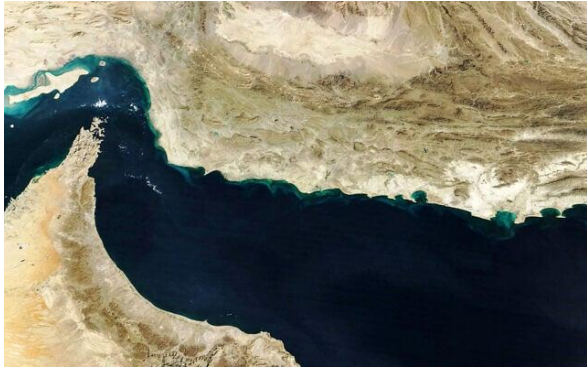
This handout natural-color image acquired with MODIS on NASA's Terra satellite taken on February 5, 2025, shows the Gulf of Oman and the Strait of Hormuz (upper left).

Adding to the tension, Iran began a military drill on Monday in the Strait of Hormuz, a vital international waterway and oil export route from Gulf Arab states, who have been appealing for diplomacy to end the dispute.