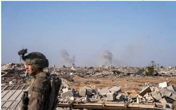
IDF troops are seen as airstrikes are carried out in southern Gaza’s Rafah, November 23, 2025.

The IDF has reported killing or capturing some 50 of them in recent months.