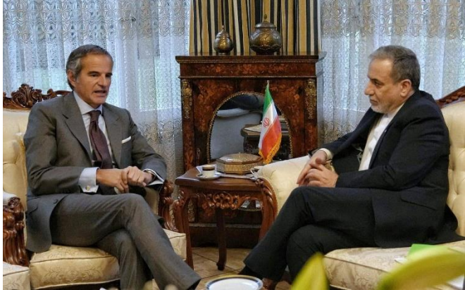
Iranian Foreign Minister Abbas Araghchi, right, meets with International Atomic Energy Agency Director-General Rafael Grossi in Geneva, Switzerland, February 16, 2026.

Araghchi’s direct meeting with Grossi is a significant step after Iran suspended all cooperation with the IAEA following the June war. The two also met briefly on the sidelines of the United Nations General Assembly in September.