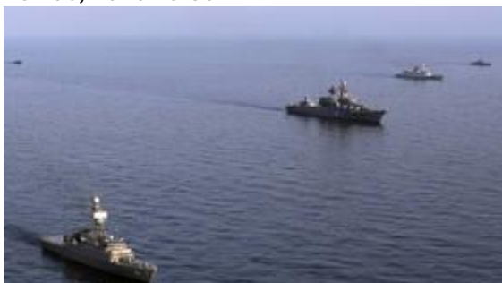
FILE PHOTO. © Getty Images / Keystone Press Agency

Russia, China and Iran will conduct joint naval exercises as part of growing military cooperation aimed at reshaping the global balance of power at sea, Russian presidential aide Nikolay Patrushev has said.