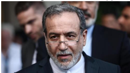
Iranian Foreign Minister Abbas Araghchi

For decades, Iran has invested in building up the terrorist organization along Israel's northern border with one clear objective: to serve as a deterrent in routine times and, in wartime, to act as Iran's second-strike capability if its nuclear facilities are attacked, responding with tens of thousands of rockets. Iranian officials were deeply disappointed that Hezbollah remained largely on the sidelines during the 12-day war, and they now appear intent on ensuring that does not happen again.