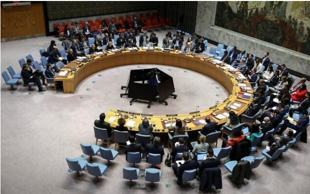
General view of a UN Security Council meeting on the situation in Iran at the United Nations headquarters in New York on January 15, 2026.

UNITED NATIONS — The UN Security Council is set to hold a high-level meeting on Wednesday on the Gaza ceasefire deal and Israel's efforts to expand control in the West Bank before world leaders head to Washington to discuss the future of the Palestinian territories at the first gathering of US President Donald Trump's Board of Peace.