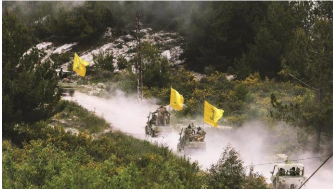
Hezbollah Terrorists

At the same time, Iran is taking additional steps to increase pressure on Hezbollah, some of them under the radar. Among other moves, and within what can be reported publicly, Iranian Foreign Minister Abbas Araghchi visited Lebanon last month. The visit was intended to ensure that in the next war, Hezbollah terrorists will not sit on the sidelines.