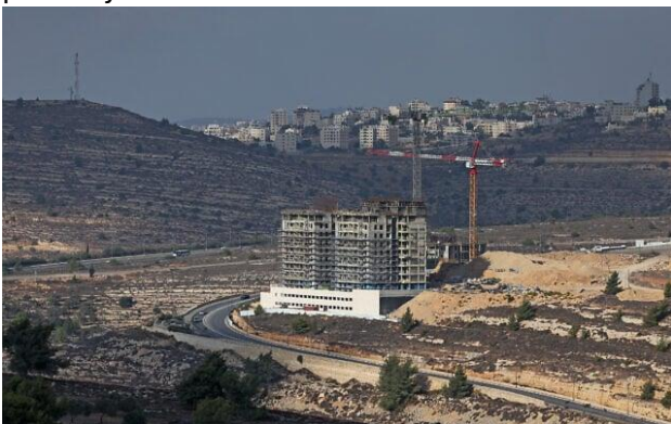
A building under construction is pictured in the West Bank settlement of Givat Ze'ev on October 24, 2025.

Prime Minister Benjamin Netanyahu has long objected to Palestinian statehood and once pledged to annex parts of the West Bank, though he has not followed through. Trump said he wouldn't allow Israel to annex the West Bank, and his 20-point plan acknowledged Palestinian aspirations for statehood, though it did not lay out a pathway to that end.