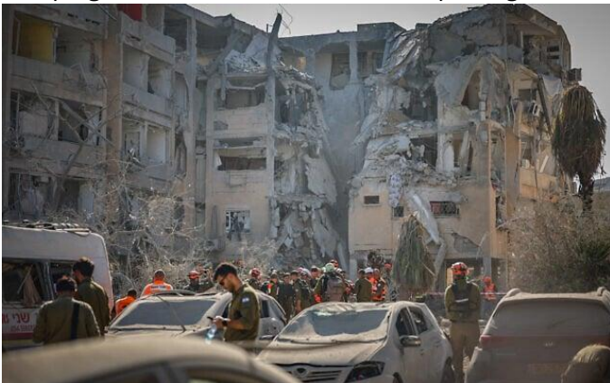
Security and rescue forces at the scene of an Iranian ballistic missile strike in Holon, June 19, 2025.

Sources told the Axios news site on Wednesday that a potential US-Iran war would be a long, multi-week campaign, with a White House official putting the chances of a strike in the coming weeks at 90 percent.