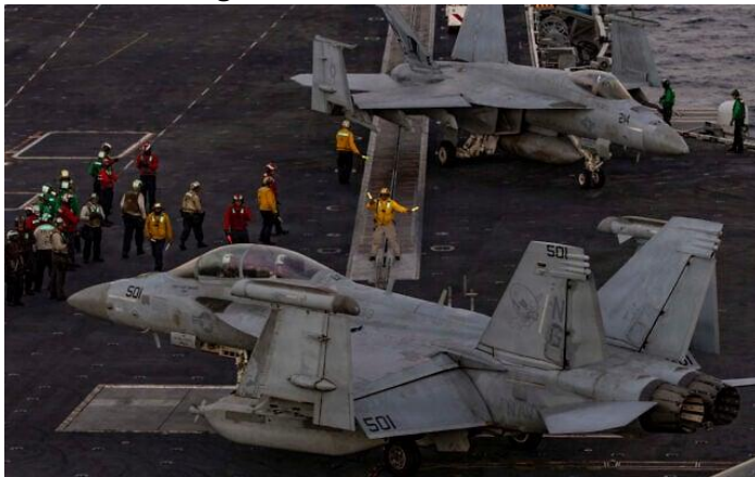
In this handout photograph released by the US Navy on February 5, 2026, US sailors direct an EA-18G Growler, attached to Electronic Attack Squadron (VAQ) 133, on the flight deck of Nimitz-class aircraft carrier USS Abraham Lincoln in the Arabian Sea on February 3, 2026.

“So one way or the other, we are going to end, deter Iran’s march towards a nuclear weapon,” Wright said. On Tuesday, open-source flight tracking data showed that the US military had moved dozens of fighter jets toward the Middle East in a day. The aircraft included F-22, F-35, and F-16 jets. Several refuelers were also spotted on the move, according to social media accounts dedicated to tracking military flights.