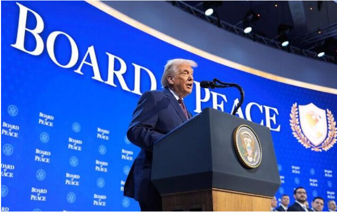
US President Donald Trump speaks at a Board of Peace charter announcement during the Annual Meeting of the World Economic Forum in Davos, Switzerland, January 22, 2026.

While more than 20 countries have so far accepted an invitation to join the board, close US partners, including France, Germany and others, have opted not to join yet and renewed support for the UN, which is also in the throes of major reforms and funding cuts.