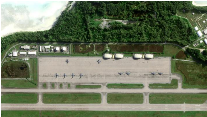
The US base on Diego Garcia

“They know they cannot defeat the United States, but they can hurt it and its allies, like us,” Steinitz said. “I wouldn’t be surprised if they try to strike beyond the Middle East — they may try to hit European countries, Berlin, Budapest, Vienna.”