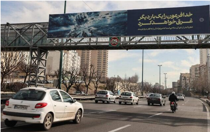
Vehicles drive along a highway under a banner with Supreme Leader Ali Khamenei's threat against US warships, in Tehran on February 18, 2026.