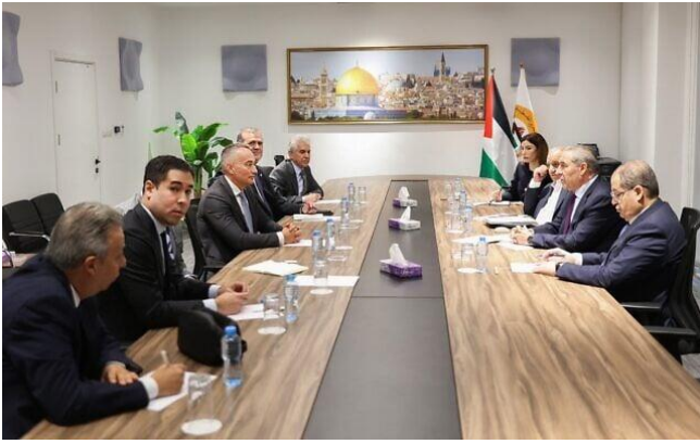
Palestinian Authority Vice President Hussein al-Sheikh (second from right) meets with Board of Peace High Representative Nickolay Mladenov (third from left) in Ramallah on January 9, 2026.

WASHINGTON — The US has approved the establishment of a coordination committee between the Palestinian Authority and the US President Donald Trump's Board of Peace, a US official and a Palestinian official told The Times of Israel on Wednesday.