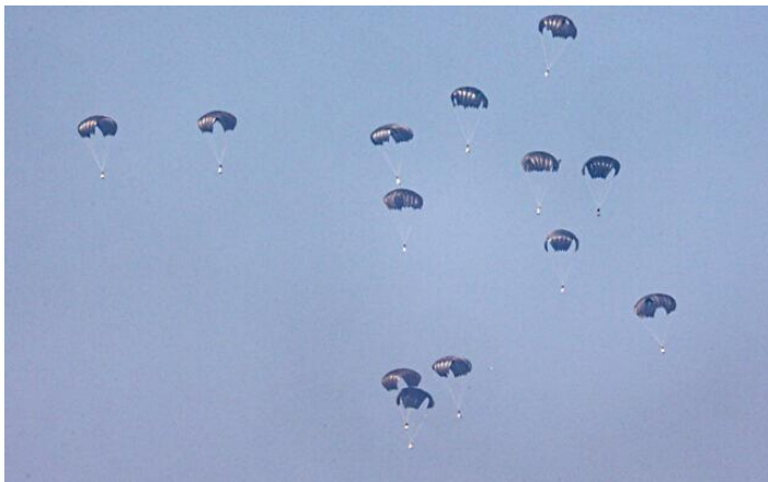
A Jordanian military aircraft (not pictured) drops humanitarian aid over Rafah and Khan Yunis in the skies of the southern Gaza Strip on February 27, 2024.

Some 160 packages of humanitarian aid were airdropped to 17 locations along the southern coastline of the Strip using American, Egyptian, Emirati, French and Jordanian planes, the IDF said.