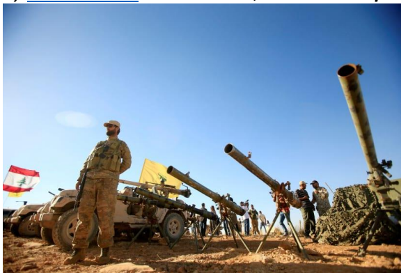
A Hezbollah fighter stands in front of anti-tank artillery at Juroud Aarsal

By TAL SPUNGIN FEBRUARY 28, 2024 18:10 Updated: FEBRUARY 28, 2024 18:26