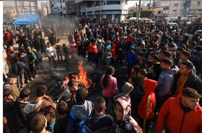
Angry mob burning tires in Gaza's Rafah in protest of soaring food prices

Gaza Liberators, an organization that opposes Hamas and organizes protests against it, characterized the Rafah protest as a demonstration against the terrorist group.