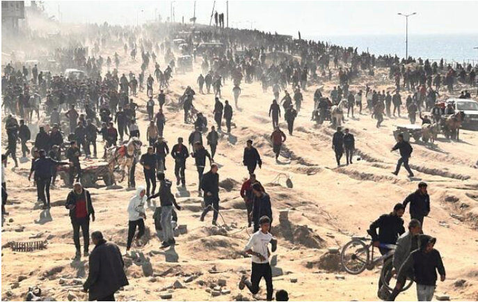
Palestinians wait for humanitarian aid on a beachfront in Gaza City, Gaza Strip, February 25, 2024.

Israel wants to retain overall security control in the Gaza Strip and has rejected having world powers impose a state on it.