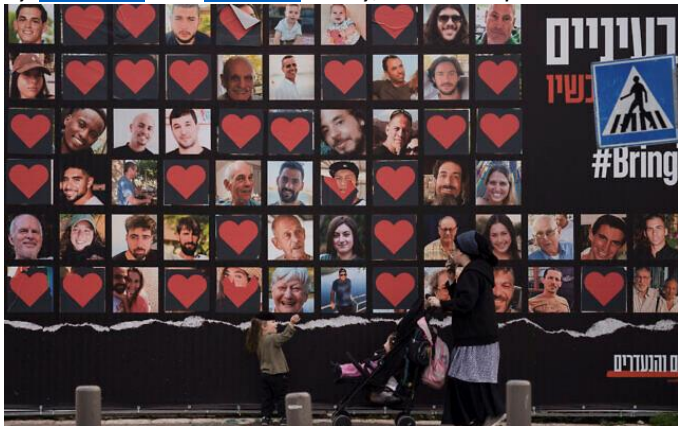
A woman and her children walk past a wall with photographs of hostages who were kidnapped during the October 7 Hamas-led cross-border terror onslaught in Israel, seen in Jerusalem, February 26, 2024.

By Agencies and Tel Staff Today, 1:26 am Updated at 10:33 am