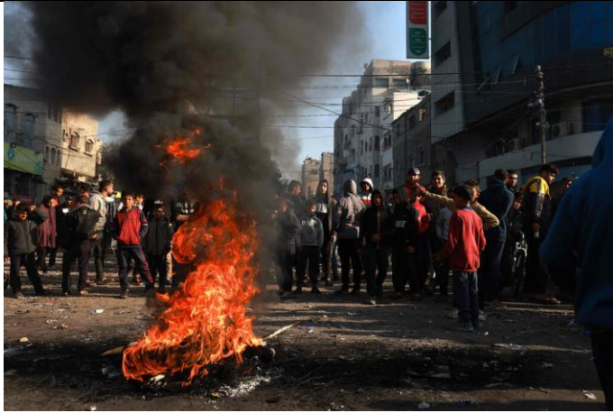
Angry mob burning tires in Gaza's Rafah in protest of soaring food prices

Although there were no explicit chants against Hamas, the demonstrations unfolded amid allegations that the terror organization has been diverting part of the humanitarian aid meant for the Gaza Strip and selling it to traders instead of distributing it for free.