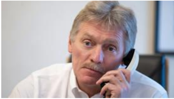
Kremlin spokesman Dmitry Peskov.