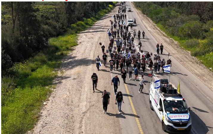
An aerial view shows relatives and supporters of Israeli hostages held in Gaza since the October 7 attacks by Hamas terrorist, marching as they start a four-day march to Jerusalem calling for their release, in Reim in southern Israel, on February 28, 2024. Hebrew banner on leading vehicle reads 'Release them from Hell.'

The security cabinet was set to meet Thursday evening amid efforts to secure a deal that would see a temporary ceasefire and the return of the 130 hostages still held in Gaza — not all of them alive.