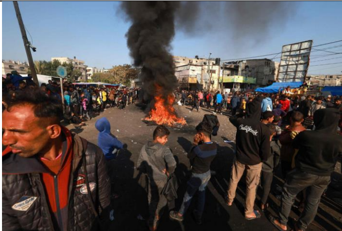
Angry mob burning tires in Gaza's Rafah in protest of soaring food prices