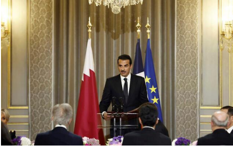
Qatar’s Emir Sheikh Tamim bin Hamad Al Thani delivers a speech during a state dinner with French President Emmanuel Macron at the Elysee Palace in Paris, February 27, 2024.

“We are in a race against time to bring the hostages back to their families and at the same time we must work to put an end to the suffering of the Palestinian people,” he said. “The world sees a genocide of the Palestinian people,” he asserted. “Hunger, forced displacement, savage bombardments are used as weapons. And the international community still hasn’t managed to adopt a unified position to end the war in Gaza and provide the strict minimum of protection for children, women, and civilians.”