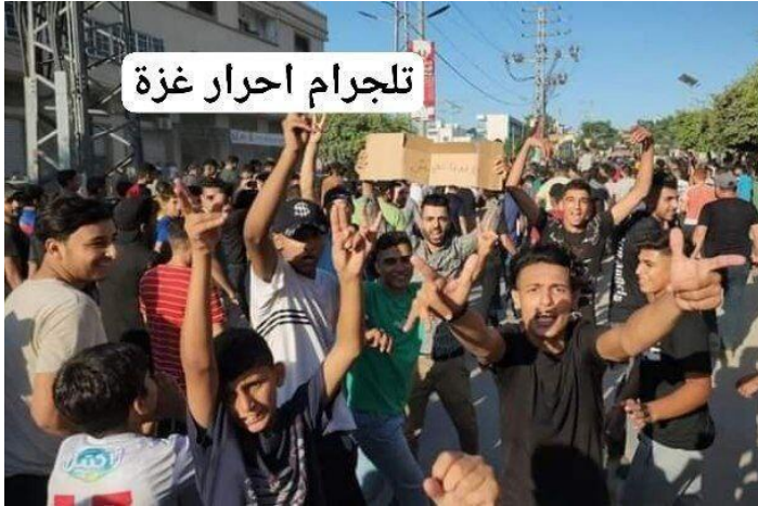
A Gaza Liberators' social media post calling on Gazans to protest against Hamas

In a statement issued last week, the group called to stop the war while jibing at Hamas' leaders who reside outside of the Gaza Strip and are unaffected by the war.