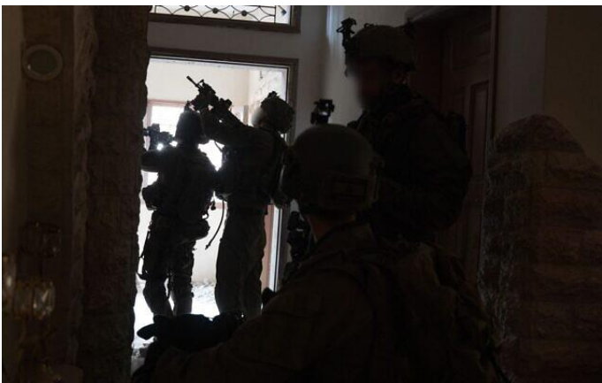
IDF troops seen operating in Gaza in this handout photo cleared for publication on February 27, 2024

The start of Ramadan, which is expected to be around March 10, is seen as an unofficial deadline for a ceasefire. The month is a time of heightened religious observance and dawn-to-dusk fasting for hundreds of millions of Muslims around the world.