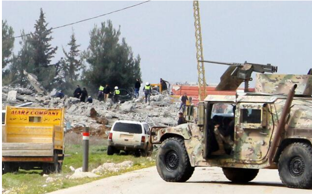
A Lebanese army vehicle block a road leading to a destroyed warehouse, background, which was attacked by Israeli airstrikes, on the outskirts of the Hezbollah stronghold village of Buday, near Baalbek town, east Lebanon, Monday, Feb. 26, 2024.

A day later, Israel struck a site deep inside Lebanon, in the Baalbek region near the border with Syria, which is thought to be used as a major route for weapons transfers.