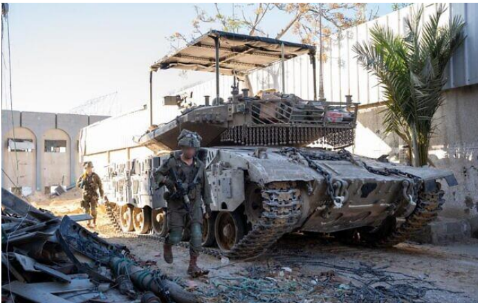
IDF troops seen operating in Gaza in this handout photo cleared for publication on February 27, 2024

In all, the report said, the US proposed at talks in Paris last week that some 400 Palestinian terror inmates would be released in exchange for 40 Israeli hostages during the planned six-week truce.