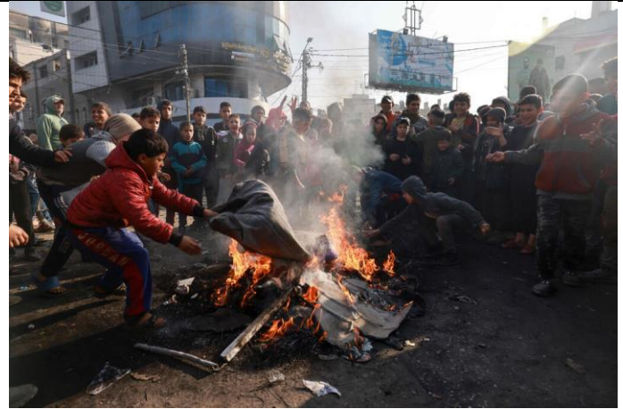
Angry mob burning tires in Gaza's Rafah in protest of soaring food prices