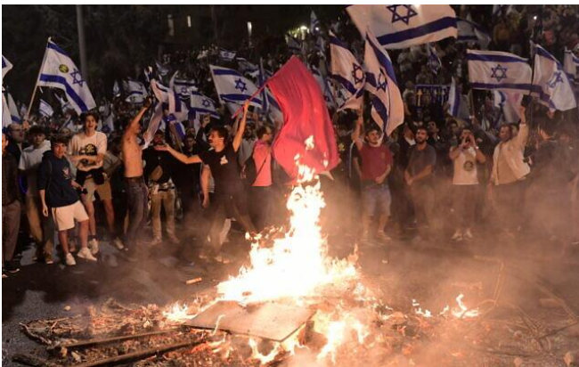
Israelis block the Ayalon highway in Tel Aviv during a protest against the Israeli government’s planned judicial overhaul on March 26, 2023.