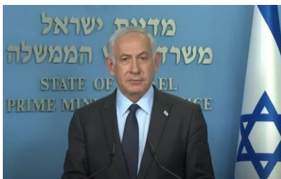
Prime Minister Benjamin Netanyahu speaks to the nation, March 27, 2023.

In a prickly speech Monday night, Prime Minister Benjamin Netanyahu announced he was temporarily delaying his government’s highly contentious judicial overhaul legislation to allow time for dialogue over the far-reaching reforms.