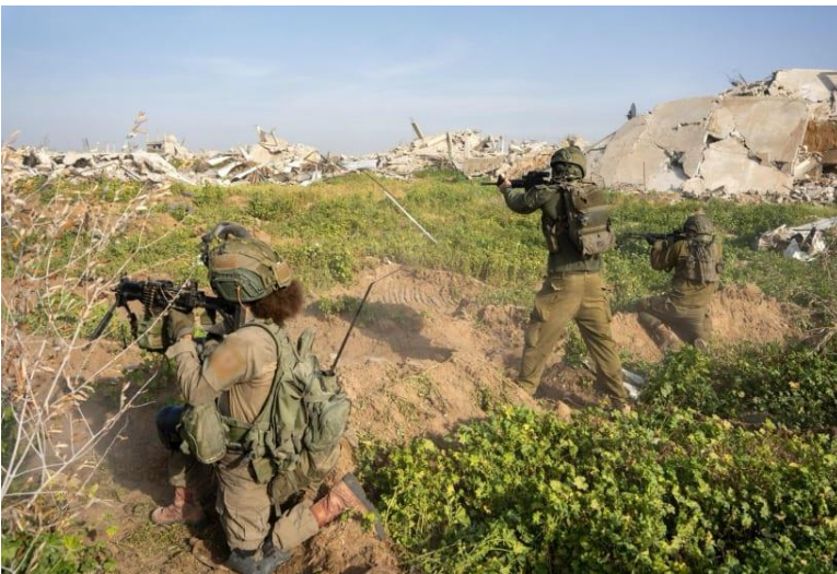
IDF operating in the Rafah area of the Gaza Strip, March 27, 2025.

By YONAH JEREMY BOB APRIL 2, 2025 07:18 Updated: APRIL 2, 2025 22:05