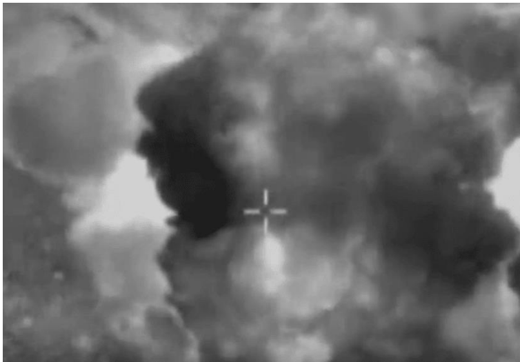
Israel Air Force strikes Hamas weapons facility in Syria, February 9, 2025

In 2014, the battles between Israel and Hamas over Shejaia were the harshest of the conflict, leading to relatively heavy casualties on both sides and the need for heavier Israeli bombing and artillery.