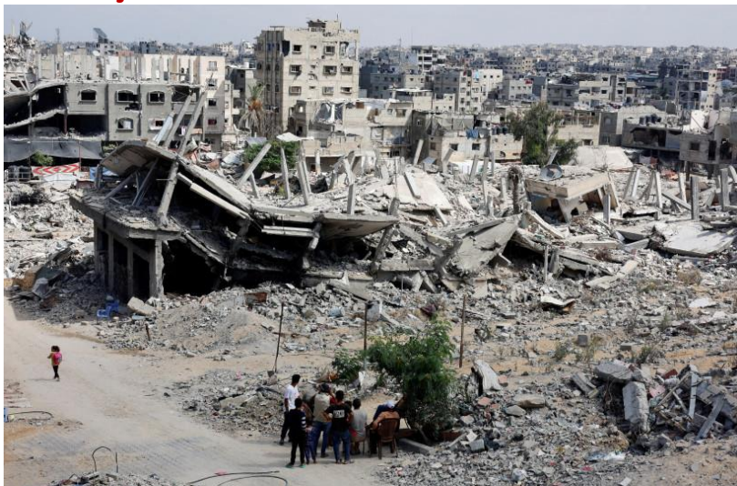
Scenes of destruction in Khan Yunis in the southern Gaza Strip.