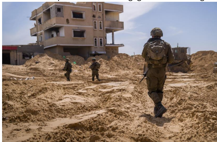
IDF operates in Rafah, in Gaza, April 2, 2025.

Furthermore, defense sources said even as the growing invasion with three divisions has required some new rounds of reservist call-ups , the government still will not need to order a very large reservist call-up wave unless it engages in a much larger invasion of Gaza.