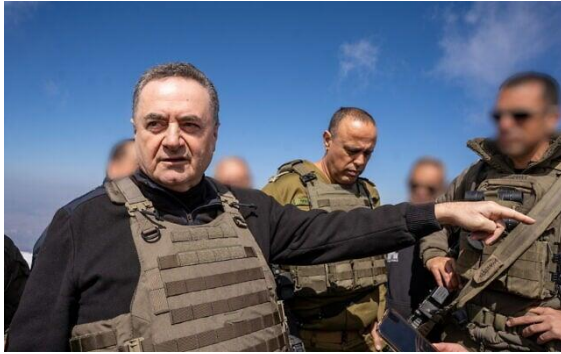
Defense Minister Israel Katz (left) and IDF Deputy Chief of Staff Maj. Gen. Tamir Yadai (right) in the Mount Hermon area in southern Syria, March 11, 2025.

The provincial government in southern Syria’s Daraa said nine civilians were killed and several were injured in an Israeli bombardment following an “Israeli incursion.”