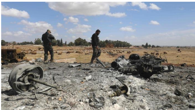
The damage caused by the Israeli attacks in Syria last week. Message to the Turks

Despite the diplomatic dialogue, tensions between Turkey and Israel remain high. Erdogan’s speech underscored the lack of progress in easing hostilities. “Israel is a terror state—there is no other definition,” he said. “It is attempting to incite sectarian conflict in Syria to undermine the achievements of the revolution. Anyone trying to hurt the Syrian people again must be prepared to pay the price.”