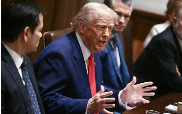
US President Donald Trump, alongside Secretary of State Marco Rubio (L) and Secretary of Defense Pete Hegseth (R), during a cabinet meeting in the Cabinet Room of the White House on April 10, 2025, in Washington.

US President Donald Trump on Thursday said progress was being made regarding the return of the hostages being held in Gaza and that he was dealing with both Israel and Hamas, but he gave no other details about the talks.