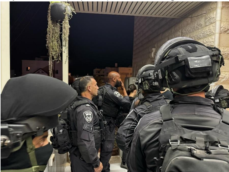
Police during raid on the southern Bedouin village of Ararat an-Naqab, leading to four arrests, on April 8, 2025.

On Tuesday night, preceding the chaos, police conducted a similar operation in Ararat an-Naqab, where they arrested four people suspected of shooting at officers earlier that day.