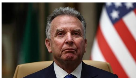
Steve Witkoff, President Donald Trump's envoy to the Middle East

Sources believe that Trump has given Prime Minister Benjamin Netanyahu just a few more weeks to continue the war before he pushes for a comprehensive ceasefire deal.