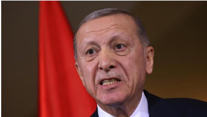
Turkish President Recep Tayyip Erdogan

In a speech Friday afternoon at a diplomatic conference in Antalya, Erdogan again labeled Israel a “terror state,” accusing it of trying to “sabotage the revolution” that overthrew the Assad regime in Syria and of sowing sectarian division there. He warned: “Anyone who seeks to bring pain again to the Syrian people must be ready to pay the price.”