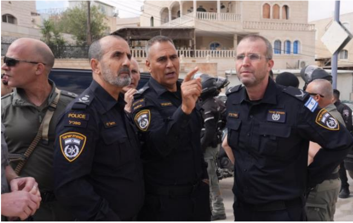
Israel Police chief Daniel Levy (left) in the southern Bedouin town of Ararat an-Naqab the morning after a violent clash between rival local clans, April 10, 2025.

Five Arab Israelis were killed within 48 hours amid an unrelenting violent crime wave that continues to beset Arab communities across the country.