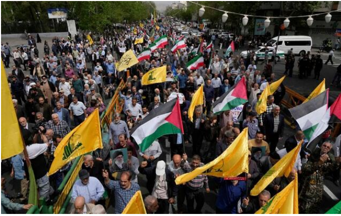
Iranian demonstrators carry Iranian, Palestinian and Hezbollah terror group flags at an anti-Israeli rally after Friday prayer in Tehran, Iran on April 11, 2025.

While Khamenei relented and agreed to talks, he also imposed his own conditions, the report said.