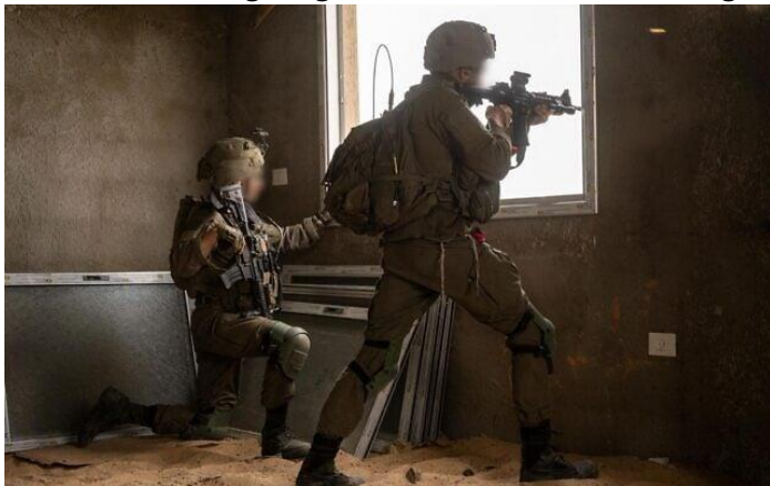
IDF troops operate in the Gaza Strip, in a handout photo issued on April 11, 2025.

Israel has said it seeks to minimize civilian fatalities and stresses that Hamas uses Gaza’s civilians as human shields, fighting from civilian areas, including homes, hospitals, schools, and mosques.