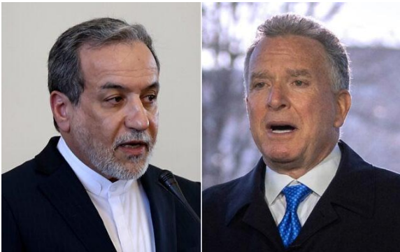
Iranian Foreign Minister Abbas Araghchi, left, pictured in Tehran, Iran, Tuesday, Feb. 25, 2025; Steve Witkoff, right, White House special envoy, pictured in Washington, Wednesday, March 19, 2025.

The talks on Saturday will be led by Foreign Minister Abbas Araghchi and US special envoy Steve Witkoff, with Omani Foreign Minister Badr al-Busaidi as intermediary, according to Iranian state media.