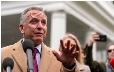
Steve Witkoff, White House special envoy for the Middle East, accompanied by White House press secretary Karoline Leavitt, speaks with reporters at the White House, March 6, 2025, in Washington.

“A real serious deal is on the table and it’s a matter of a few days,” he was quoted as saying.