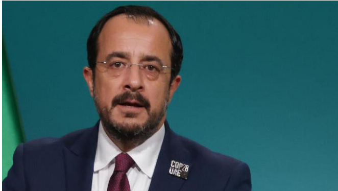
President Nikos Christodoulides

President Nikos Christodoulides told reporters that the EU's ire was made clear in his conversations with top officials, including European Commission President Ursula von der Leyen and Commissioner of the Mediterranean Dubravka Suica.