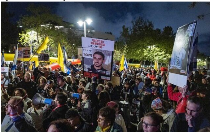
Hostage families and their supporters protest for the release of captives held in Gaza, outside the home of Strategic Affairs Minister Ron Dermer, in Jerusalem, on April 13, 2025.

A wave of public petitions calling for the return of hostages from Gaza even if it means an immediate end to the war continued on Monday, representing several more sectors of Israeli society, with thousands signing on to back the call originally made by Israeli Air Force reservists last week.