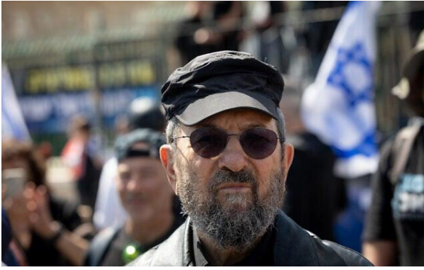
Former prime minister Ehud Barak attends a protest march against the decision of Prime Minister Benjamin Netanyahu to fire Shin Bet chief Ronen Bar, outside the PM's office in Jerusalem, March 19, 2025.

Additionally, dozens of former Foreign Ministry employees, including former director generals and ambassadors, signed onto a letter backing previous petitions, calling for the immediate return of hostages.