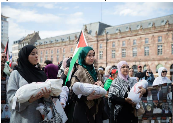
Crowd gathers at Place Kleber with the call of Strasbourg Palestine Collective and marches to the Place du Chateau with slogans in support of Gaza, in Strasbourg, France on March 22, 2025.

A clash by anti-Israel residents and pedestrians outside a Jewish-owned Strasbourg bakery on Saturday drew outrage from French politicians, with some suggesting that the incident was indicative of a broader issue in French society.