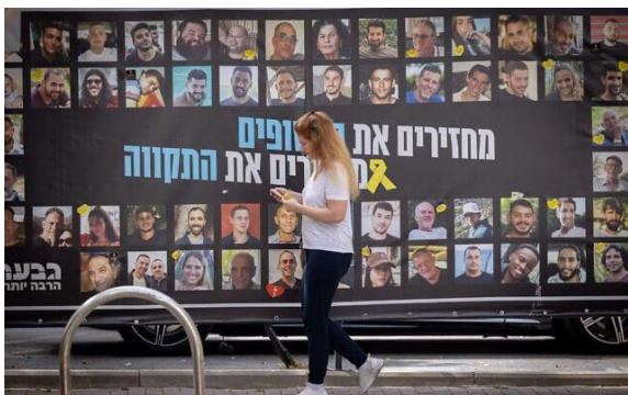
A woman walks past a poster depicting hostages held in Gaza, in Tel Aviv on April 6, 2025.

It asserted that "this is not a call for refusal" to show up for military duties, but "a call to save lives."