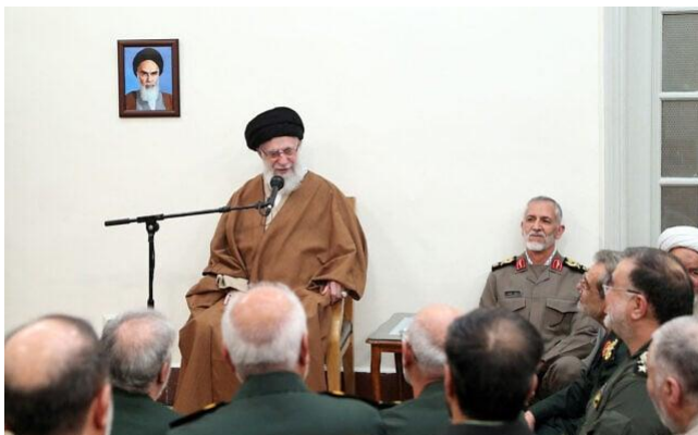
This handout picture provided by the office of Iran's Supreme Leader Ayatollah Ali Khamenei shows him addressing a meeting with a group of armed forces commanders and clerics in Tehran on April 13, 2025.

Pressed on whether US inspectors — rather than UN inspectors — would be the ones to verify that Iran is adhering to any deal that is reached, Witkoff declined to answer directly.