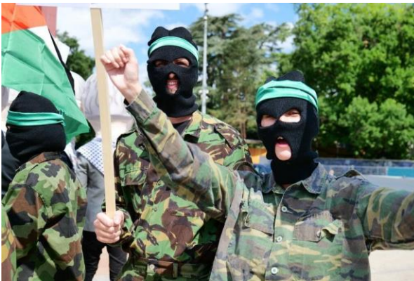
Hamas in Gaza

A security source said the suspects were connected to the Palestinian terror organization Hamas. The group, which has been at war with Israel since October 2023, has been accused of instigating anti-government street protests in Jordan, which has a large Palestinian population.