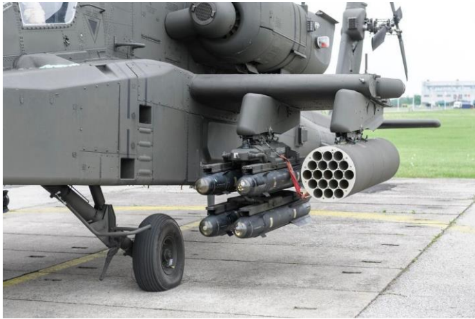
AGM-114 Hellfire missiles

The authorization followed a January notification from the Biden administration regarding an $8 billion arms package just before Trump reentered office. Under the agreement, Israel will use American military aid funds to purchase 3,000 Hellfire missiles valued at approximately $660 million and 2,166 AGM-114 Hellfire bombs, also valued at $660 million.