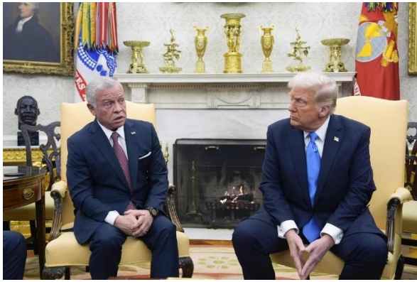
King Abdullah of Jordan with US President Donald Trump

authorities arrested 16 people , reportedly linked to Hamas, suspected of manufacturing missiles using locally sourced equipment and materials smuggled from abroad, as well as possessing explosives.