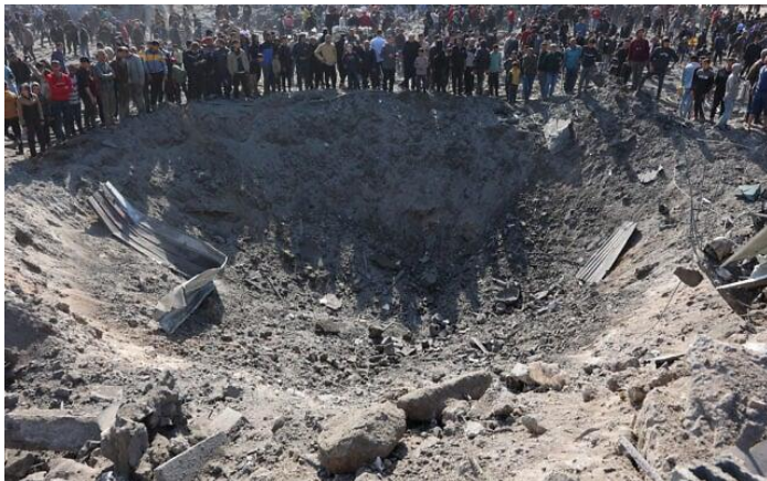
Palestinians gather around a large crater following an Israeli strike in the Zaytoun neighborhood in Gaza City on April 13, 2025.

Both France and the United States under Joe Biden have pressed for the PA, which has limited autonomy in parts of the West Bank, to root out corruption and bring in new faces in the hope it could take charge of Gaza.