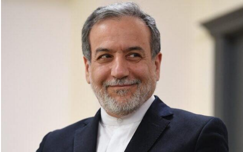
Iran's Foreign Minister Abbas Araghchi attends a meeting with his Armenian counterpart in Yerevan on March 25, 2025.

Though a second round of talks was confirmed, there was confusion over which country would host the negotiations.