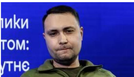
FILE PHOTO: Ukrainian military intelligence chief Kirill Budanov.

Ukraine's precarious battlefield position is set to worsen in the near future, Kiev's military intelligence chief has warned in an interview with the New York Times. Kirill Budanov described the situation as "on the edge" as Russia continues to make territorial gains.