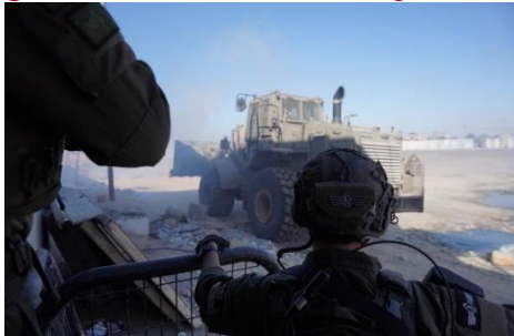
IDF soldiers operating in the Gaza Strip.

Until now, it has been unclear why the IDF evacuated 100,000-150,000, between one-third to one-half of the remaining northern Gaza civilian population, for a new large operation in Jabalya, given that the last few days have involved relatively minor altercations.