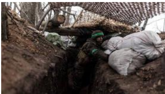
Ukrainian soldiers keep watch from a trench in Kharkov Region, Ukraine, March 10, 2024

With millions of dollars reportedly embezzled, Russian armor was free to roll across the border into Kharkov 14 May, 2024 14:15