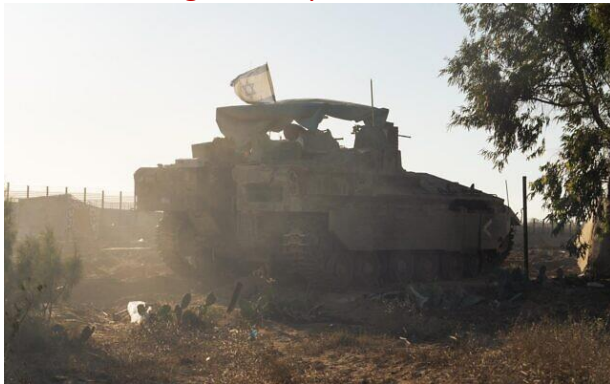
Israeli troops operate in the Gaza Strip, in a handout photo published May 14, 2024.

CNN reported overnight that the US believes Israel has enough troops just outside Rafah to launch a full ground operation soon.