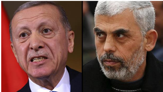
Recep Tayyip Erdogan, Yahya Sinwar

UK-based news outlet The Times reported Tuesday that documents found in the home of a senior Hamas official in Gaza indicate the terrorist organization planned to establish a secret base in Turkey – and to use it to carry out attacks against Israeli targets in the region, prior to the outset of the war after October 7.