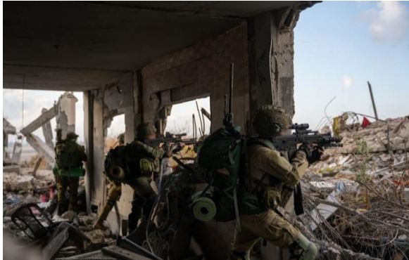
IDF soldiers operating in the Gaza Strip.

By YONAH JEREMY BOB MAY 14, 2024 12:53 Updated: MAY 14, 2024 12:54