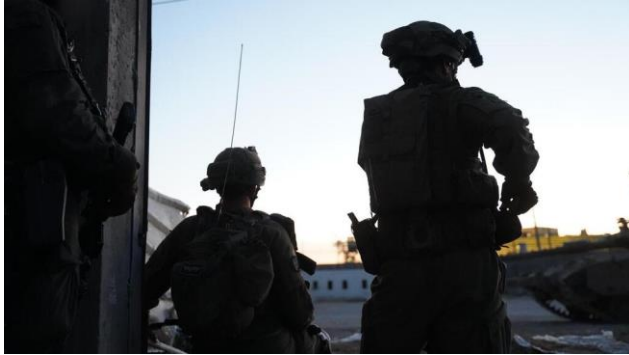
IDF forces in Gaza

The IDF Spokesperson's Unit reported on Tuesday that 13 soldiers have been injured in two separate incidents in northern and southern Gaza, with four of them being evacuated to the hospital in serious condition.