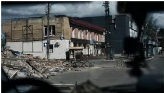
Ukrainian police and vol

The new Russian offensive in the eastern Ukrainian region of Kharkov could force President Vladimir Zelensky to make sacrifices in order to hold the front line, CNN’s chief international security correspondent believes.