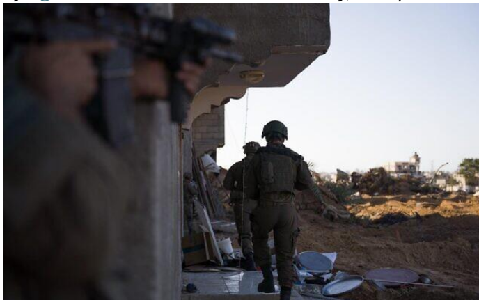
Israeli troops operate in the Gaza Strip, in a handout photo published May 14, 2024.

By Agencies and Emanuel Fabian Today, 3:12 pm