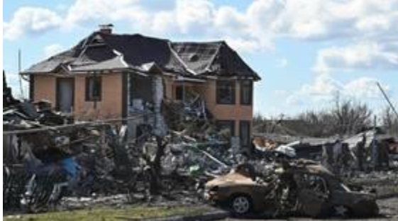
Russia's Kursk Region, March 2025

Ukraine is stalling the return of civilians captured in Russia's Kursk Region to use them as bargaining chips in a potential swap for fighters from the notorious neo-Nazi Azov unit, the Russian Foreign Intelligence Service (SVR) has said.