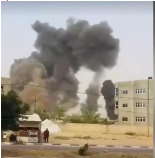
Scene of the Khan Younis attack

Israel did not notify the United States ahead of the assassination attempt on Mohammed Sinwar in Khan Younis, a source familiar with the matter revealed to Ynet on Tuesday evening. According to the source, the operation was the result of a "sudden opportunity," leaving no time to inform the Americans or consider the fact that the strike coincided with President Donald Trump's speech in Saudi Arabia.