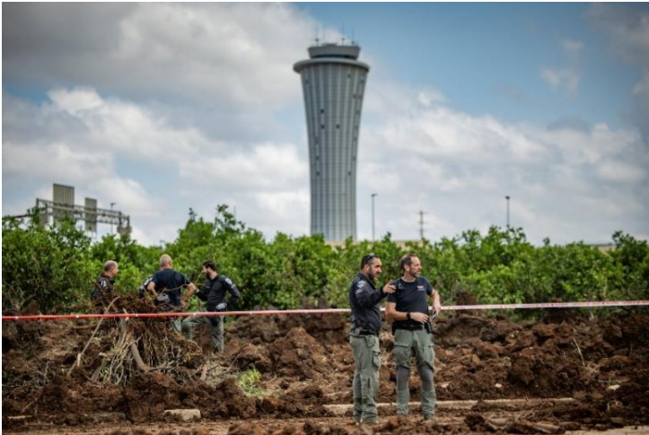
Security forces at the site where a missile fired from Yemen hit an area of Ben Gurion Airport near Tel Aviv, on May 4, 2025.

Since March 18, when the IDF resumed its offensive against Hamas in the Gaza Strip, the Houthis in Yemen have launched 33 ballistic missiles and at least 10 drones at Israel. Several of the missiles have fallen short.