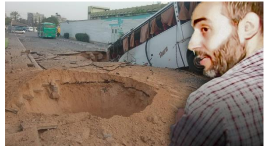
Mohammed Sinwar

Mohammed Sinwar, brother of slain Hamas mastermind Yahya Sinwar, had been leading Hamas' military wing, the Izz al-Din al-Qassam Brigades, in Gaza since the assassination of Mohammed Deif. Following the elimination of his brother Yahya Sinwar in Rafah , he also became involved in