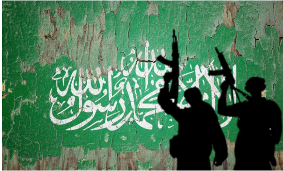
Hamas flag painted on a cracked wall.

By YONAH JEREMY BOB MAY 14, 2025 19:00 Updated: MAY 14, 2025 19:25