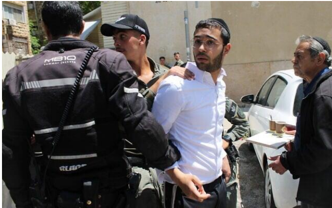
Ultra-Orthodox Jews protest the IDF draft outside the Jerusalem enlistment center, April 28, 2025.

Prime Minister Benjamin Netanyahu has reportedly assured his ultra-Orthodox allies, who have threatened to topple the government if even one yeshiva student is arrested, that no such arrests are expected .