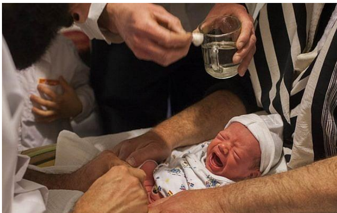
Illustrative photo of a ritual circumcision.

Belgium police conducted a series of raids on Wednesday in Jewish homes in Antwerp looking for people illegally conducting ritual Jewish circumcisions, local officials said.