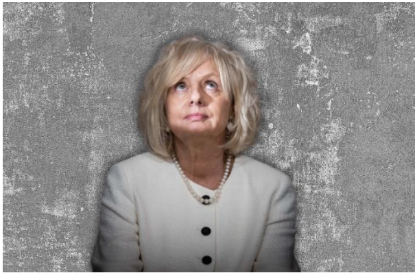
Gali Baharav-Miara.

"We, the undersigned members of the Knesset, demand the immediate and full enforcement of the laws for closing UNRWA, both the law for severing ties with UNRWA and the law to cease its activities in Israel, according to your responsibility to ensure that state systems operate within the law," the MKs wrote.