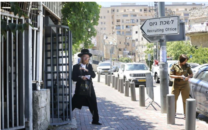
An ultra-Orthodox Jewish man is seen exiting an IDF recruiting office in Jerusalem, June 25, 2024

By SARAH BEN-NUN MAY 13, 2025 20:30 Updated: MAY 13, 2025 23:47