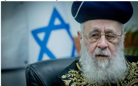
Then-Sephardi Chief Rabbi Yitzhak Yosef sells the hametz (leavened food) of the State of Israel ahead of the upcoming Passover holiday, in Jerusalem, April 21, 2024.

If the government arrests yeshiva students for dodging the draft, then the ultra-Orthodox community will be forced to leave Israel, former chief Sephardic rabbi Yitzhak Yosef threatened on Wednesday, following the launch of an IDF enforcement operation to detain people who ignored enlistment orders.