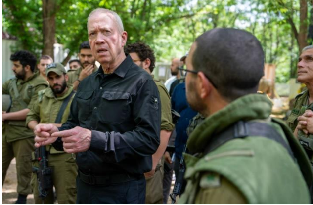
Defense Minister Yoav Gallant meeting members of the artillery units in the North, May 17, 2024.

Gallant and the IDF had predicted needing to fight a three-to-nine-month low-grade Hamas insurgency from January-February until later in 2024.