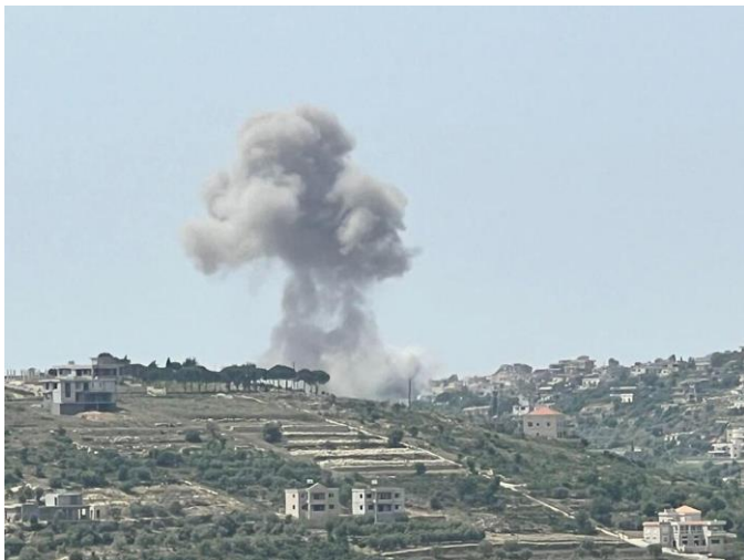
IDF strikes Ayta ash Shab in southern Lebanon

Saturday marks the most activated sirens from Hezbollah drone and rocket attacks. Since Saturday morning, the terror organization has launched dozens of drones and rockets at Israel, thankfully not injuring anyone in the process. Israel has retaliated against Hezbollah , targeting terrorist targets in southern Lebanon as well as deep in Lebanese territory.