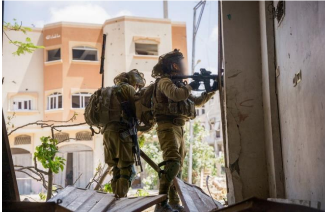
IDF troops operate in the Gaza Strip. May 18, 2024.

Among these targets were weapons storage facilities, military infrastructure and compounds, and terrorists.