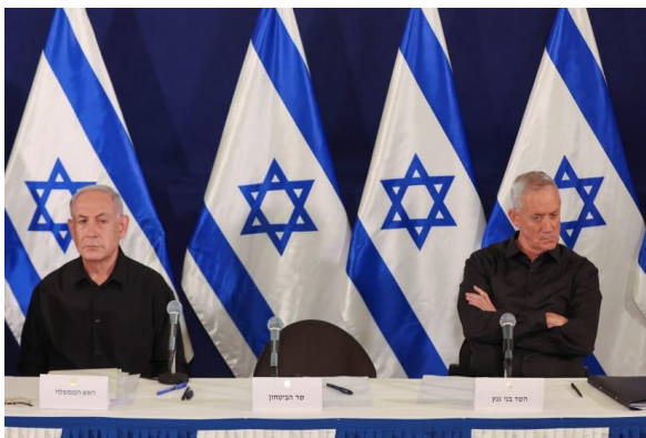
Israeli prime minister Benjamin Netanyahu and Cabinet minister Benny Gantz during a press conference in the Kirya military base in Tel Aviv, Israel, 28 October 2023.

What National Unity party leader and war minister Benny Gantz did on Saturday night was to force Prime Minister Benjamin Netanyahu to reveal his true war and post-Hamas strategy.