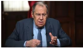
Russian Foreign Minister Sergey Lavrov.

Russia won't be viewing Europe as a partner for “at least one generation,” Foreign Minister Sergey Lavrov has predicted. The diplomat remarked that Moscow and the West are already locked in a confrontation that has no end in sight.