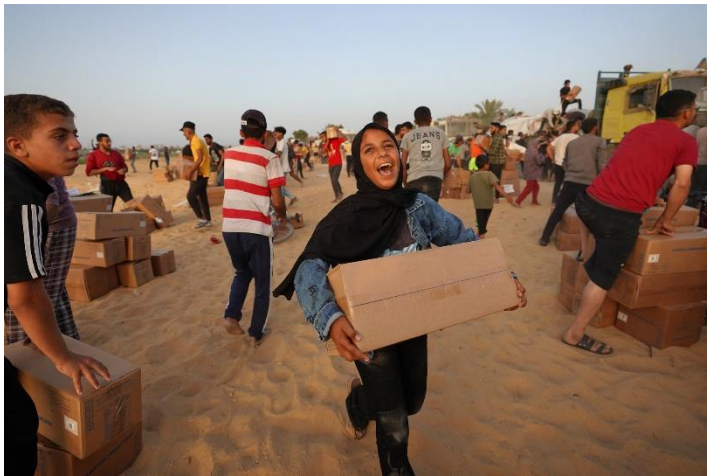
Palestinians carry boxes of humanitarian aid after rushing the trucks transporting the international aid from the US-built Trident Pier near Nuseirat in the central Gaza Strip on May 18, 2024, amid the ongoing war between Israel and Hamas.

The Rafah Crossing with Egypt, which has been a major conduit of humanitarian aid into the enclave, has remained shuttered since the IDF seized control of the Gazan side on May 7, as Egypt has insisted that it will not allow deliveries to resume until the crossing is back under Palestinian control.