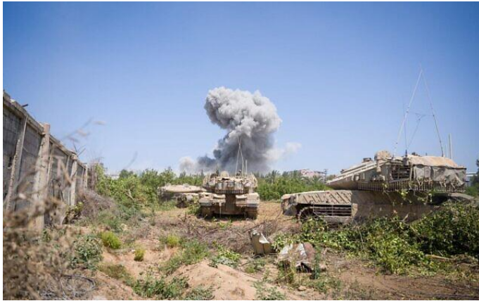
Troops of the 460th Armored Brigade operate on the outskirts of northern Gaza's Jabaliya, in a handout image published May 18, 2024.

In a separate incident, a reservist of the 5832nd Combat Engineering Battalion was seriously wounded in Rafah after his D9 armored bulldozer was hit by an RPG.