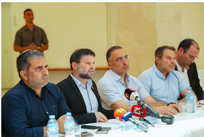
Religious Zionism party leader Finance Minister Bezalel Smotrich (second left) leads a faction meeting in northern Israel, May 19, 2024.

International efforts including by France and the US to resolve the matter through a diplomatic solution has thus far failed, as Hezbollah has maintained it will not enter into any concrete discussions with Israel until there is a ceasefire in Gaza, where Israel is battling Hamas in the wake of the October 7 massacre carried out by the terror group in southern Israel.