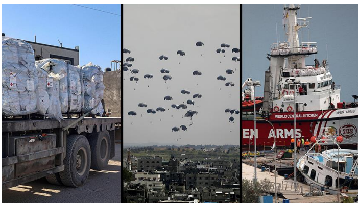
Aid is brought into Gaza by land, air and sea

"The same item can be sold for different prices in the same market," said Sabah Abu-Ghanem, 25. "When the police are there, traders will sell things for the prices the police decide. When the police leave, prices go up immediately."