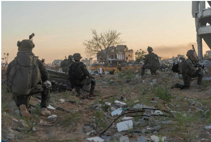
IDF troops are seen operating in the Gaza Strip in an undated handout photo published May 19, 2024.

In a later statement, the IDF said the 162nd Division's 401st Armored Brigade raided sites in Rafah, where Hamas gunmen opened fire. The tank forces have killed more than 50 terror operatives in the area, and demolished some 100 sites, including rocket launchers, according to the IDF. The troops also located more than 10 tunnel shafts, it added.