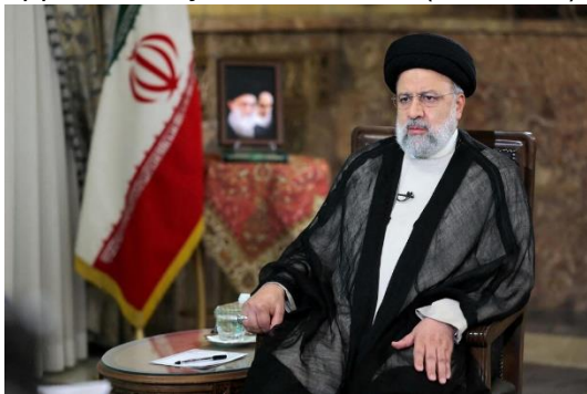
Iranian President Ebrahim Raisi

Israeli officials are refraining from commenting on the incident. However, unofficial sources have clarified that the country had no connection or involvement in the helicopter crash, which reportedly occurred due to severe weather conditions near Jolfa, a city close to the Azerbaijani border, approximately 600 kilometers (375 miles) northwest of Iran's capital, Tehran.