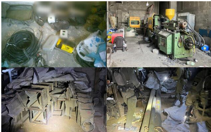
These images released by the IDF on May 18, 2024, show equipment and long-range rockets found at a weapons manufacturing plant on the outskirts of northern Gaza’s Jabaliya.

located and destroyed a weapons and long-range rocket manufacturing site, along with other military equipment.