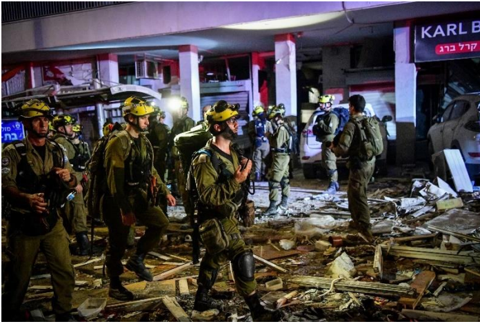
Israeli security and rescue forces at the scene of a ballistic missile strike from Iran in Bat Yam, June 15, 2025.