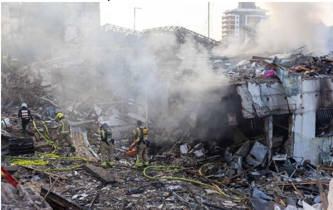
Israeli security and rescue forces at the scene where a ballistic missile fired from Iran hit and caused damage in Rehovot, June 15, 2025.