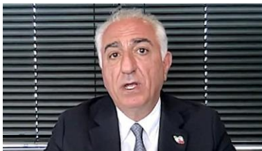
Reza Pahlavi, the exiled crown prince of Iran

Appearing on the BBC on Sunday, the left-leaning Amanpour said: "There is no doubt, and Pahlavi is right, and everybody who has reported, I grew up under the Pahlavis in Iran, and the people, you know, first of all chose the Islamic Republic instead of them, but now have seen that the Islamic Republic is so much harsher, is so much more punitive, gives so much fewer rights and is isolated from the world and the economy is appalling and it affects the people.