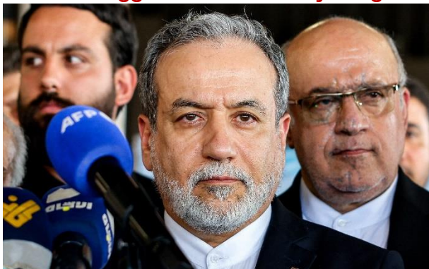
Iran's Foreign Minister Abbas Araghchi (C) gives a statement during his visit to the mausoleum of slain Lebanese Hezbollah's Leader Hassan Nasrallah, in Beirut's southern suburbs, Lebanon, on June 3, 2025.

He said that the Israeli strikes on the offshore South Pars gas field Iran shares with Qatar were "a blatant aggression and a very dangerous act."