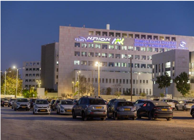
Samson Assuta hospital, October 20, 2024.

During the fighting, 11,070 civilians were evacuated from their homes and housed in 97 reception sites across the country. 17 local authorities were forced to evacuate their populations due to Direct impact on homes. The Health Ministry deployed approximately 80 medical staff to make daily visits to the absorption sites to identify health needs. Emotional support was provided by approximately 100 therapists from the National Resilience Center.