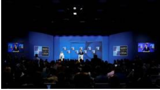
FILE PHOTO. NATO Secretary General Mark Rutte holds closing press conference on final day of bloc summit.

NATO member states only mentioned Ukraine two times in their joint communique, which was released on Wednesday following the bloc's summit in the Hague. The document mainly focused on raising defense spending goals and increasing military cooperation between members.