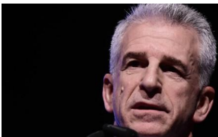
Mossad chief David Barnea in Tel Aviv, on February 25, 2025.