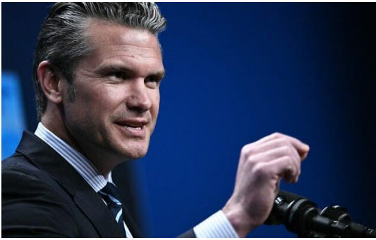
US Defense Secretary Pete Hegseth speaks at a press conference during a North Atlantic Treaty Organization (NATO) Heads of State and Government summit in The Hague on June 25, 2025.

US Secretary of Defense Pete Hegseth also pushed back on reports that Fordo may not have been as damaged as US officials have claimed, angrily saying Wednesday that the evidence regarding what is left of Iran's nuclear facility at Fordo "is buried under a mountain, devastated and obliterated."