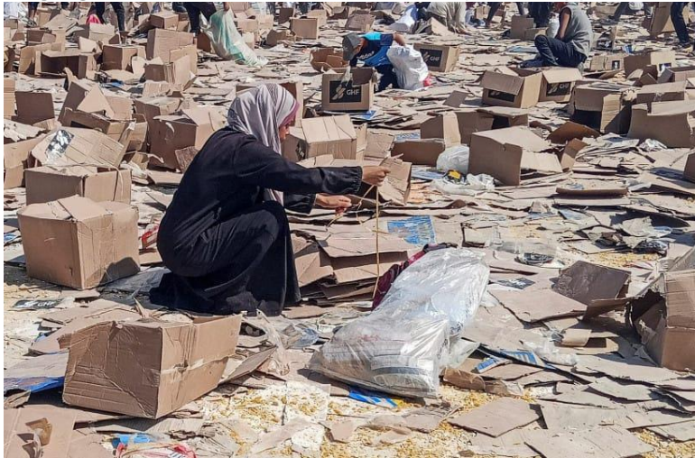
A woman crouches next to boxes of the U.S.-backed Gaza Humanitarian Foundation, as Palestinians gather to collect what remains of relief supplies from the distribution center of the Gaza Humanitarian Foundation, in Rafah, in the southern Gaza Strip, June 5, 2025.

He concluded by criticizing the government's promise, stating: "Government ministers pledged that 'not a single grain will enter,' but as usual, reality is the opposite. Shameful."