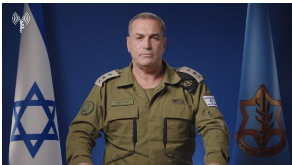
IDF Chief of Staff Lt. Gen. Eyal Zamir speaks in a video statement issued on June 25, 2025.

“We will not allow Iran to produce weapons of mass destruction,” the IDF chief averred, adding that Israel caused significant damage to the Tehran’s missile-launching capabilities, managed to remove hundreds of launchers and significantly delayed Tehran’s force build-up plans.