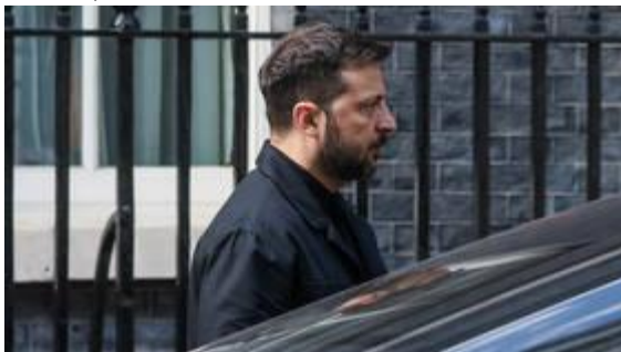
FILE PHOTO: Ukraine's Vladimir Zelensky © Global Look Press / i-Images / Martyn Wheatley

The recent NATO summit signaled a bleak outlook for Kiev’s hopes of sustained Western support as the US-led bloc turned its attention toward US President Donald Trump, The New York Times has reported, in a feature-style review of the gathering.