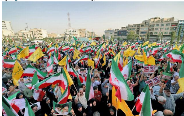
Iranians wave national flags and chant slogans as they celebrate a ceasefire between Iran and Israel at Enghlab Square in the capital Tehran on June 24, 2025.

By Agencies and Tol Staff Today, 10:02 am