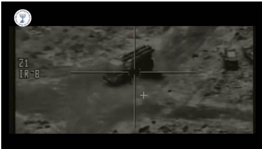
Screenshot from footage released by the Mossad showing strikes carried out by commandos of the Israeli spy agency on Iranian air defenses in Iran, June 13, 2025.

In addition, vehicles carrying weapons systems were smuggled into Iran, giving Israeli planes air supremacy and freedom of action within the country’s airspace.