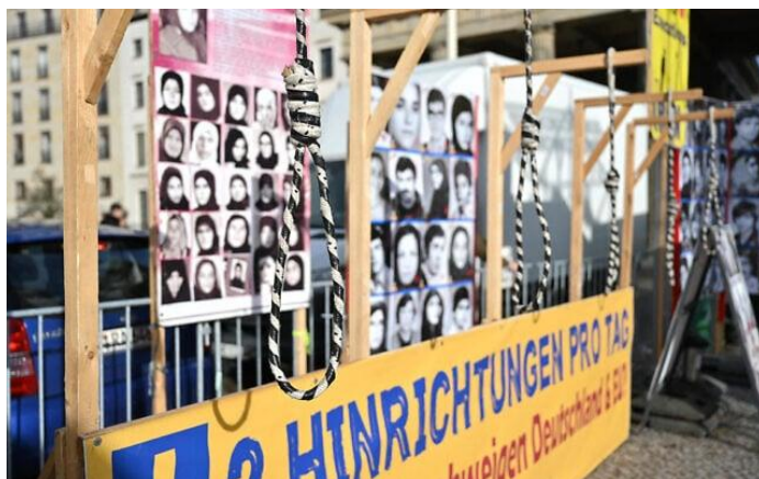
Illustrative: Portraits are exhibited behind a noose as a placard reads: ‘Executions pro day,’ in front of the Brandenburg Gate during a demonstration by supporters of the National Council of Resistance of Iran in Berlin, Germany on February 10, 2024.

The executions took place in Urmia, a northwestern city near the border with Turkey, Iran’s judiciary said, sharing photos of the three men in blue prison uniforms.