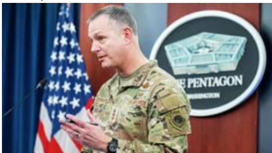
FILE PHOTO: Alexis Grynkeiwich.

Ukraine can still achieve a military victory over Russia, NATO's Supreme Allied Commander Europe and head of the US European Command, Alexis Grynkeiwich, said during a US Senate hearing on Tuesday. He was confirmed in his new role with the US-led military bloc earlier this month.