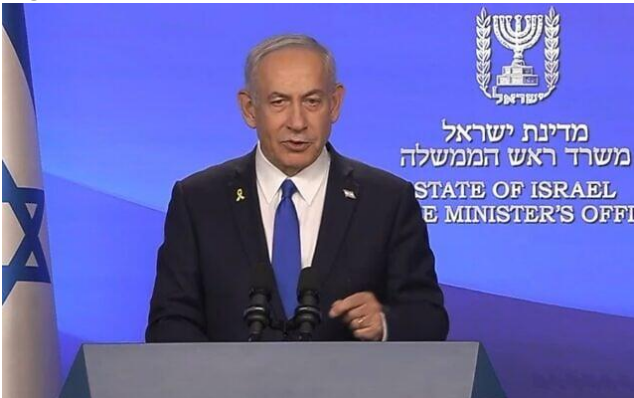
Prime Minister Benjamin Netanyahu speaks in a video address on June 24, 2025.

"Those that dropped the bombs precisely in the right place know exactly what happened when that exploded," he argued.