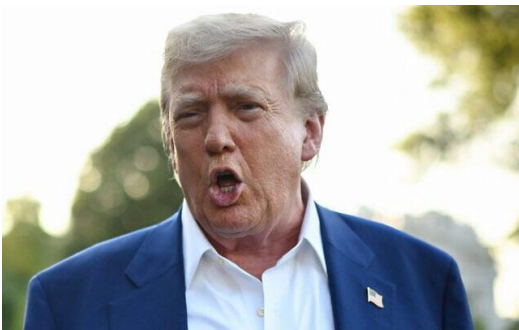
US President Donald Trump speaks to the press before boarding Marine One from the South Lawn of the White House in Washington, DC on June 24, 2025, to attend the NATO’s Heads of State and Government summit in The Hague.

in “exceptionally firm” terms not to retaliate against Iran’s violation of the US-brokered ceasefire, a White House source told Axios.