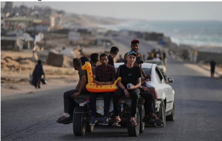
Palestinians ride on a cart hitched to a car along the shore of Al-Zawaideh, Gaza Strip, June 24, 2025.