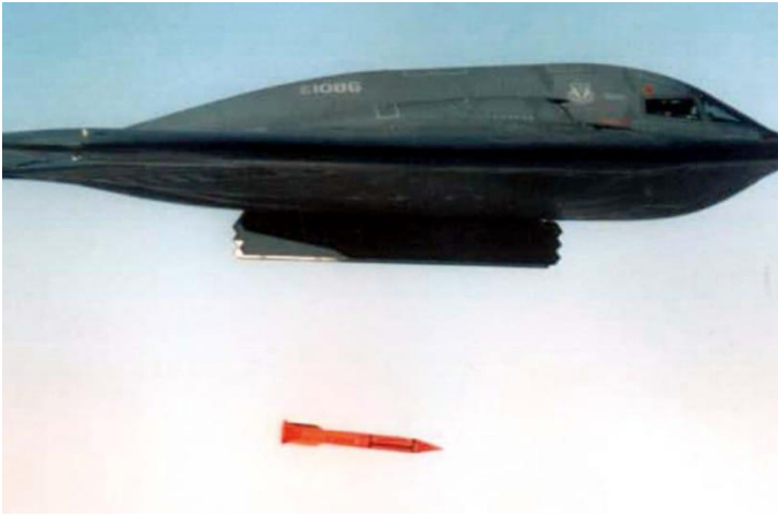
b-2 bunker buster bomb stealth 300 R Radar signature as small as a bird

Thanks to biomimicry—the imitation of nature—the B-2 can almost vanish from radar screens. Its shape, combined with whisper-quiet gliding, stealthy altitude adjustments, and precise spatial control borrowed from the falcon's own aerial agility, grants it perfect camouflage and an exceptional unrefueled range of up to 11,000 km. Aerial refueling can more than double that range, allowing the bomber to strike Iran and return without landing.