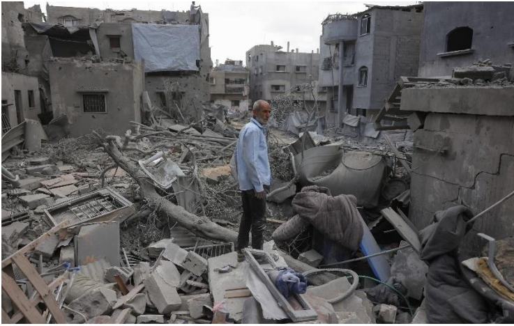
A Palestinian looks on while searching the rubble of the Abu Nadi home which was hit in an Israeli strike west of Jabalia, in the northern Gaza Strip on June 23, 2025.

Hamas took responsibility for the attack.