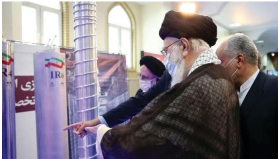
Iran's Supreme Leader Ayatollah Ali Khamenei visits the Iranian centrifuges in Tehran.

By JERUSALEM POST STAFF JUNE 24, 2025 23:25 Updated: JUNE 25, 2025 00:35