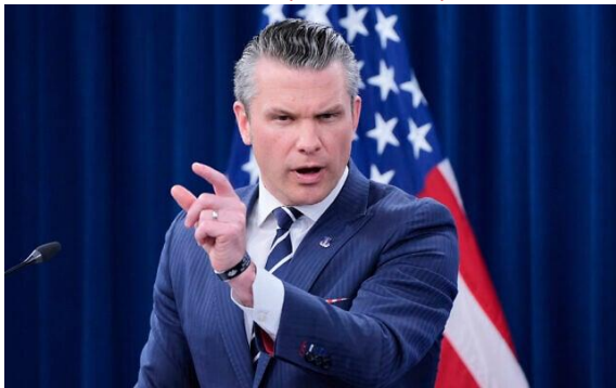
US Defense Secretary Pete Hegseth speaks during a news conference at the Pentagon in Washington, Sunday, June 22, 2025, after the US military struck three sites in Iran, directly joining Israel’s effort to destroy the country’s nuclear program.

One source, however, said Iran’s enriched uranium stocks had not been eliminated.