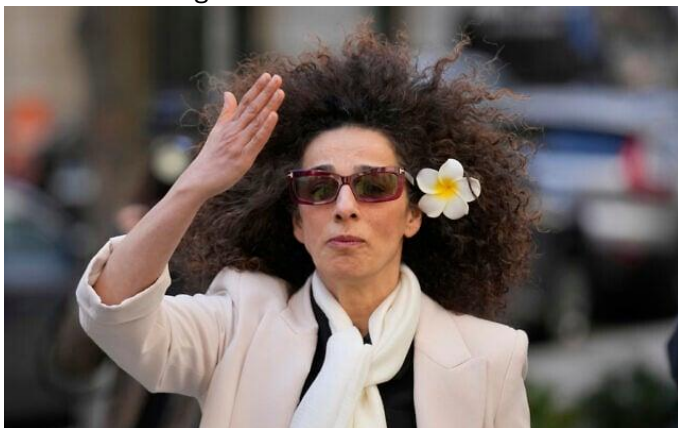
Masih Alinejad blows a kiss to supporters outside the federal courthouse after testifying at the trial of her would-be assassins in New York, Tuesday, March 18, 2025.