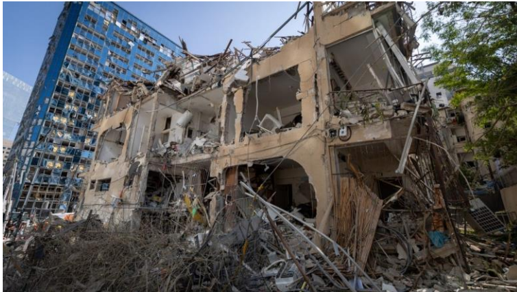
Israeli security and rescue forces at the scene where a ballistic missile fired from Iran hit and caused damage in Ramat Gan, June 19, 2025.

By JERUSALEM POST STAFF JUNE 25, 2025 02:08 Updated: JUNE 25, 2025 04:43