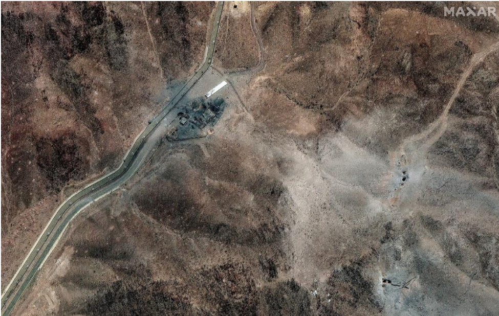
This handout satellite picture provided by Maxar Technologies and taken on June 24, 2025, shows new airstrike craters at a perimeter installation on Iran's Fordo nuclear facility, northeast of the city of Qom.

“The devastating US strike on Fordo destroyed the site’s critical infrastructure and rendered the enrichment facility inoperable,” the statement read. “We assess that the American strikes on Iran’s nuclear facilities, combined with Israeli strikes on other elements of Iran’s military nuclear program, have set back Iran’s ability to