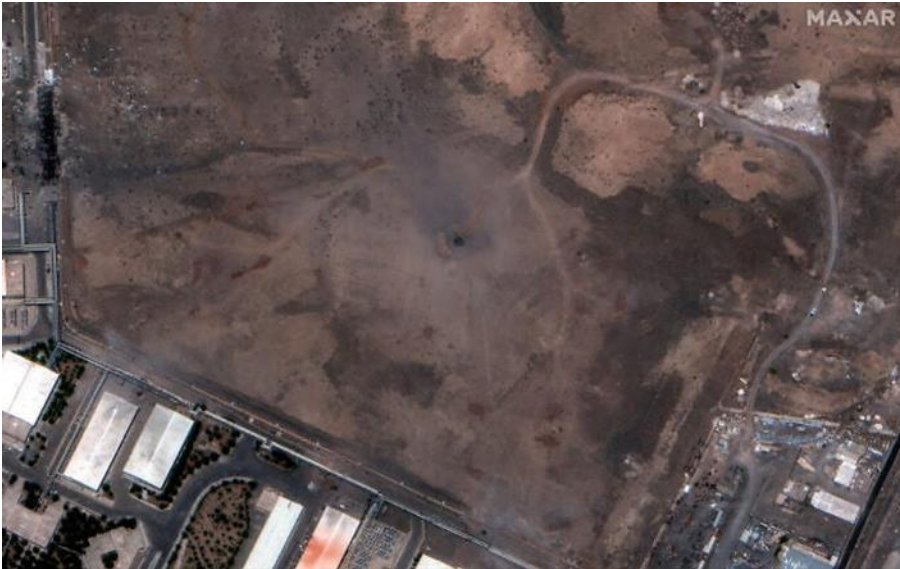
This handout satellite picture provided by Maxar Technologies and taken on June 22, 2025, shows a crater after US strikes on Iran's Natanz nuclear enrichment facility in central Iran.

“I’m not happy that Israel’s going out now,” the president told reporters Tuesday, as Israeli jets were responding to Iranian missile strikes earlier in the day.