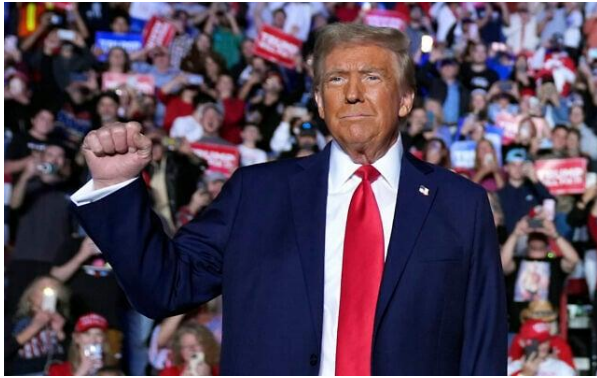
Republican presidential nominee Donald Trump arrives at a campaign rally at Santander Arena, November 4, 2024, in Reading, Pennsylvania.

“The amount of material that we’re tracking online is at such a fever pitch at the moment,” Masters said.