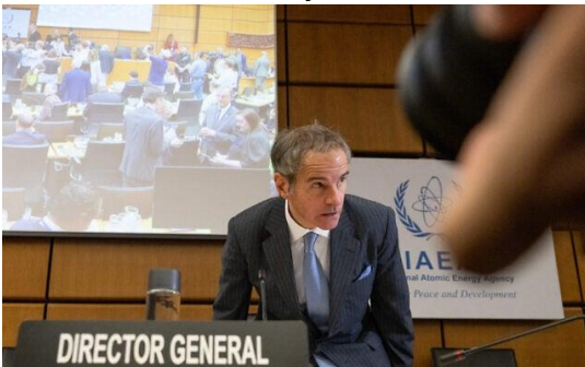
Director General of the International Atomic Energy Agency (IAEA) Rafael Grossi at an extraordinary IAEA Board of Governors meeting at the agency’s headquarters in Vienna, Austria on June 23, 2025.

UN nuclear watchdog chief Rafael Grossi said Wednesday that there is a chance much of Iran’s highly enriched uranium was moved by Tehran soon after the first strikes, and thus survived the attacks.