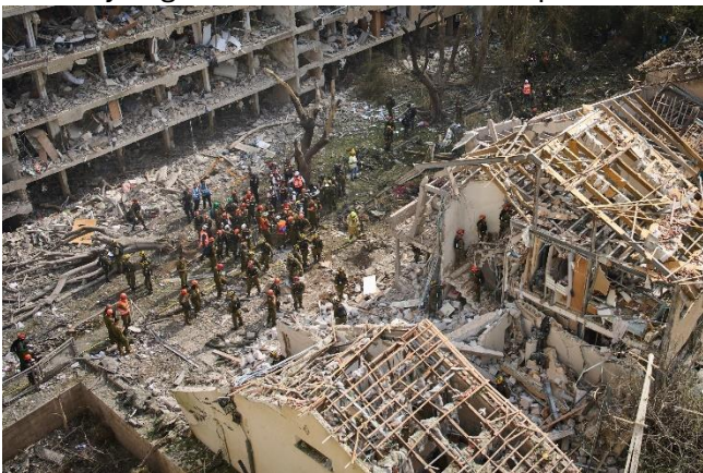
Firefighters, rescue workers and military work at the site of a direct missile strike launched from Iran in Tel Aviv, on June 22, 2025.

The US and Israel said the strikes were intended to prevent Iran from attaining nuclear weapons and to radically degrade its ballistic missile capabilities.