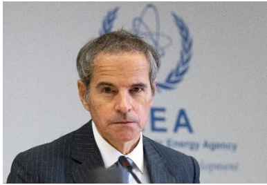
Director General of the International Atomic Energy Agency (IAEA) Rafael Grossi attends an extraordinary Board of Governors meeting at the agency's headquarters in Vienna, Austria on June 23, 2025.