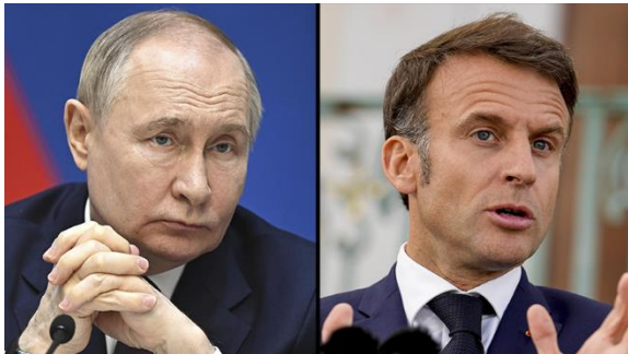
Russian President Vladimir Putin spoke Tuesday night with French President Emmanuel Macron