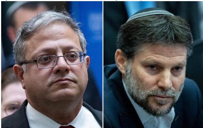
Left: National Security Minister Itamar Ben Gvir, January 16, 2025; Right: Finance Minister Bezael Smotrich, January 13, 2025.