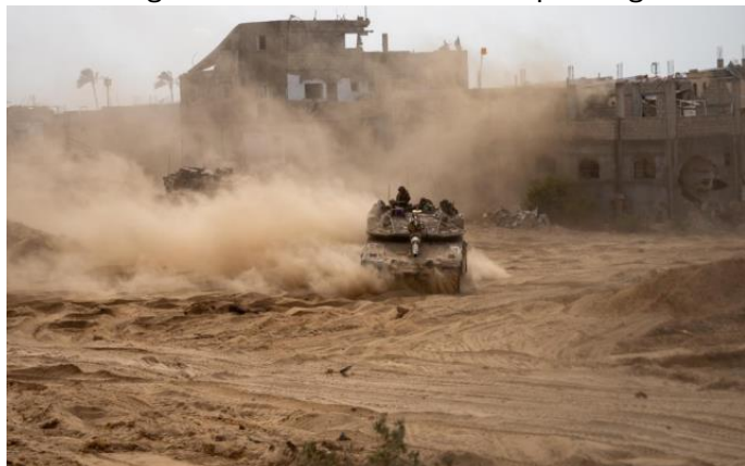
The IDF’s Commando Brigade operates in the Gaza Strip in a photo cleared for publication on July 1, 2025.

In declaring that he will “work to end the war,” Trump apparently was trying to appease both sides, mentioning an end to the war without speaking definitively.