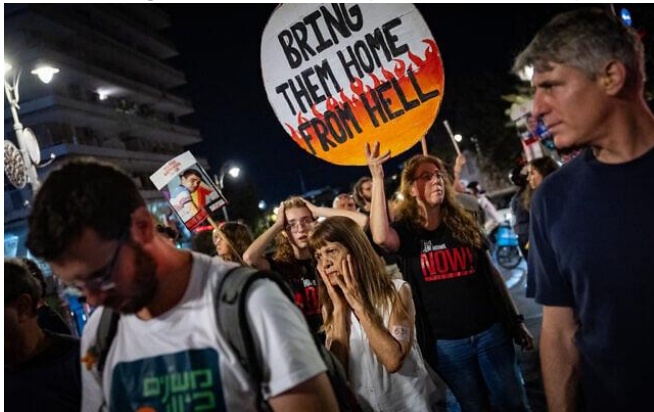
People calling for the release of hostages held in the Gaza Strip protest outside the Prime Minister's Residence in Jerusalem, June 28, 2025.

The two parties together have 13 seats in the 120-seat Knesset, where the ruling coalition fields a slim majority with just 61 lawmakers. Though the cabinet would not need Knesset approval for a hostage deal and can authorize one even against the wishes of Ben Gvir and Smotrich, the two parties could threaten to hamper coalition legislative action in parliament if they don't get their way.