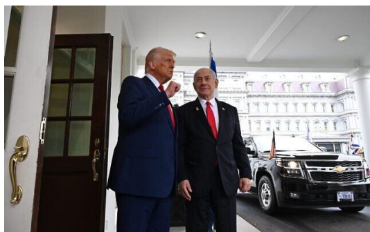
Prime Minister Benjamin Netanyahu arrives at the White House where he is met by US President Donald Trump (L) in Washington DC, April 7, 2025

“There is a positive dynamic and lively activity on the issue of negotiations,” a senior official told The Times of Israel.