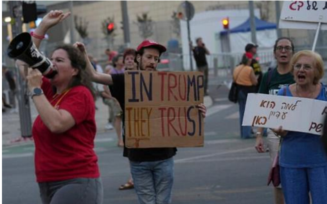
People take part in a protest demanding the end of the war and immediate release of hostages held by Hamas in the Gaza Strip, and against Prime Minister Benjamin Netanyahu's government in Tel Aviv, Israel, Saturday, June 28, 2025.

Netanyahu told hostages' families in May that he approved of Witkoff's proposal in principle.