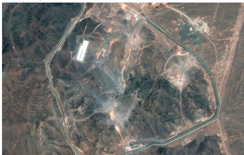
This handout satellite image provided by Maxar Technologies and dated July 1, 2025, shows an overview of the Fordo Fuel Enrichment Plant complex in central Iran.

On June 22, the United States launched unprecedented strikes of its own on Iranian nuclear facilities at Fordo, Isfahan and Natanz.