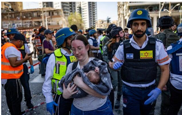
Security and rescue forces at the scene where a ballistic missile fired from Iran hit and caused damage in Ramat Gan, June 19, 2025.

Some 50,000 claims for property damage totaling NIS 5 billion ($1.47 billion) are expected to be filed for the 12-day operation, around twice the total value of all damage claims since the war with the Hamas terror group started on October 7, 2023, the head of the Tax Authority’s compensation department said last week .