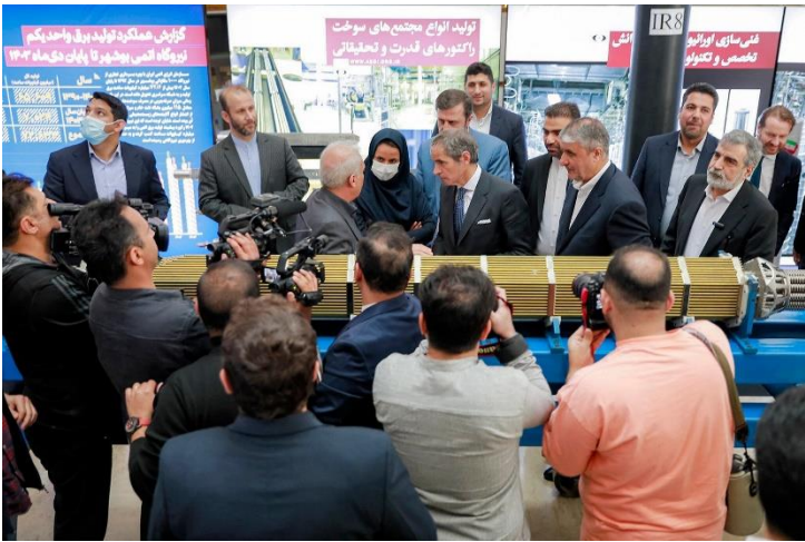
This handout picture made available by the Atomic Energy Organization of Iran shows Director-General of the International Atomic Energy Agency Rafaeel Grossi, center, during a tour of the organization's headquarters in Tehran on April 17, 2025.

The text, published by Iranian media, stated that the legislation aims to “ensure full support for the inherent rights of the Islamic Republic of Iran” under the nuclear non-proliferation treaty, and “especially uranium enrichment.”