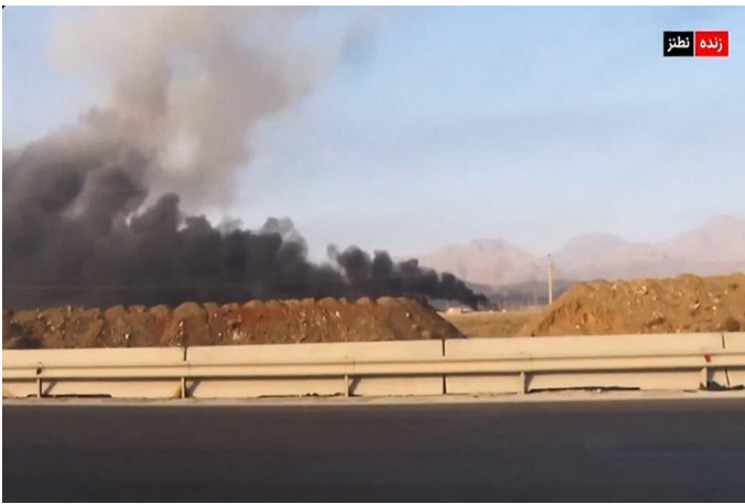
This image grab taken from footage broadcast by Iran's IRINN news on June 13, 2025 shows what the television described as smoke billowing from explosions in Natanz after Israel announced it had carried out strikes on Iranian nuclear and military sites.

Israel and Western countries accuse Iran of seeking to acquire nuclear weapons — an ambition Tehran denies.