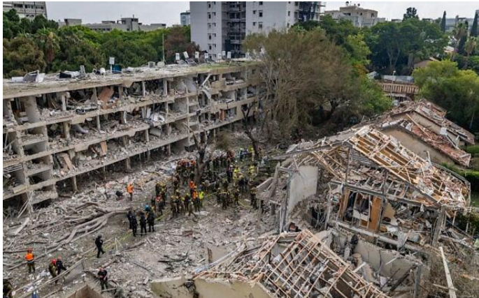
Israeli security and rescue forces at the scene where a ballistic missile fired from Iran hit and caused damage in Tel Aviv, June 22, 2025.

Some 10,000 Israelis still remain displaced from their homes due to rocket damage sustained during Israel's 12-day war with Iran, including about 2,000 new immigrants, Labor MK Gilad Kariv told a meeting of the Knesset's Immigration, Absorption and Diaspora Committee Wednesday.