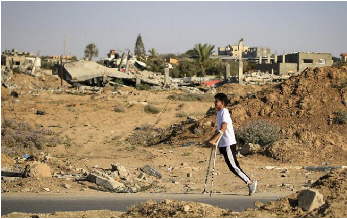
An amputee makes his way along a road, past buildings destroyed during Israeli bombardment, at al-Bureij refugee camp in the central Gaza Strip on June 24, 2024.

The war in Gaza broke out on October 7 with Hamas's unprecedented attack on southern Israel, in which thousands of terrorists killed some 1,200 people and took 251 hostages.