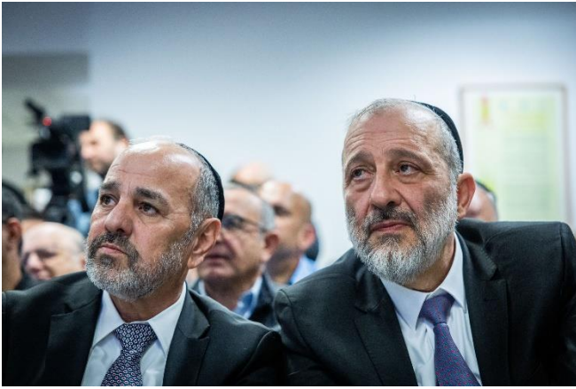
Shas' Ya'akov Margi (L) with party leader Aryeh Deri in Jerusalem on January 1, 2023

Tuesday's decision to withdraw all bills from the Knesset agenda was the latest manifestation of tension between members of Netanyahu's increasingly fractious coalition, which some lawmakers have indicated may not have long to live.