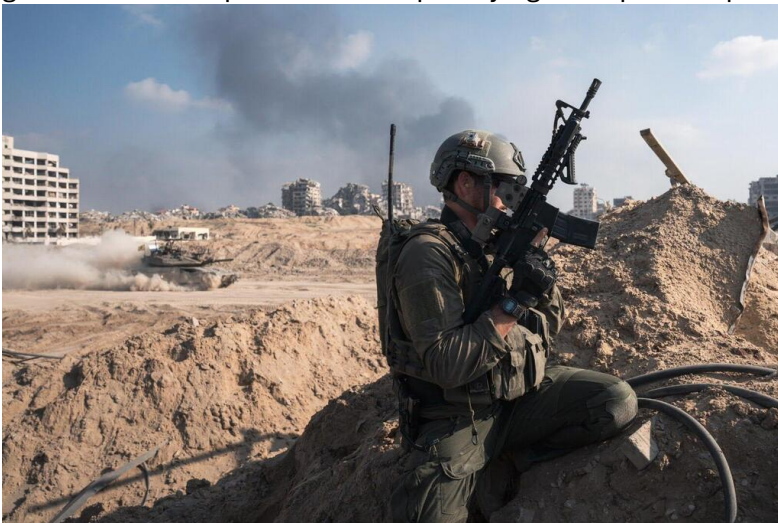
IDF fighter in Khan Younis

Since the outbreak of the war, there have been increasing reports of countries and companies wanting to reduce or restrict defense trade with Israel. There also have been reports of problems with the supply of F-35 spare parts from Dutch suppliers; the governments of Italy, Canada and Belgium announced a halt to defense exports to Israel (despite reports of shipments continuing and deals still being signed); and the Spanish government even prevented a ship carrying a weapons shipment from India to Israel from docking at its ports.