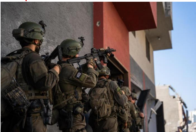
IDF soldiers operate in Rafah

"It is unacceptable that the U.S. is delaying arms shipments to Israel," he proclaimed in English in a video posted on social media.