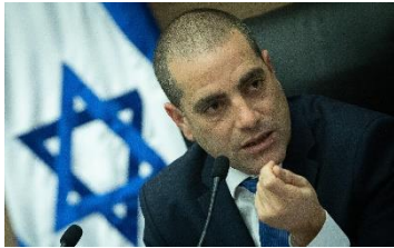
Likud MK Ofir Katz leading a special Knesset committee to discuss a bill to revoke terrorist citizenship, February 14, 2023.

Ben Gvir, who has been angling for months for a greater say in the ongoing war against Hamas in Gaza, threatened to pull his support from a Shas-fronted bill on funding religious councils if he was not given a spot on the now-disbanded war cabinet or was otherwise involved in high-level discussions on war matters.