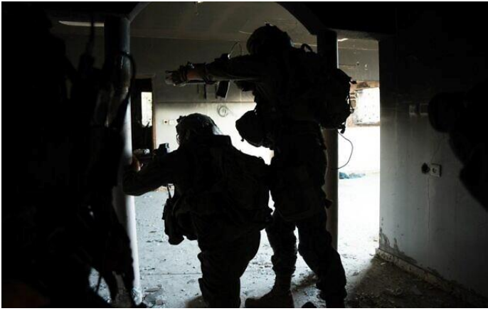
IDF troops operate in Gaza City's Shejaiya neighborhood, in a handout image published July 9, 2024

Israeli troops operating in Gaza City's eastern Shejaiya neighborhood have demolished six Hamas and Palestinian Islamic Jihad tunnels amid the latest raid there, launched less than two weeks ago, the Israel Defense Forces said Tuesday.