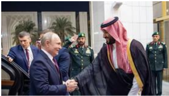
File photo: Saudi Arabian Crown Prince Mohammed bin Salman welcomes Russian President Vladimir Putin in Riyadh, December 06, 2023.

The Group of Seven "likely" abandoned the US plan to expropriate Russia's frozen central bank assets due to a "veiled threat" from Saudi Arabia, Bloomberg has reported.