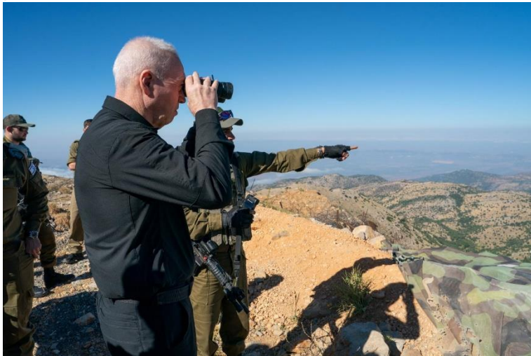
Defense Minister Yoav Gallant tours the Mount Hermon region on the northern border, July 7, 2024.

The ministry said that an “information campaign for the ultra-Orthodox population” would also be launched next month, showing the various “service paths adapted to the ultra-Orthodox in the IDF, per the recommendations of the Shkedi Committee.”