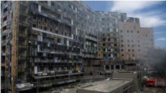
Emergency services work at the scene of a blast at the Ohmatdyt Children's Hospital in Kiev, Ukraine, July 8, 2024

Russia's permanent representative to the UN, Vasily Nebenzia, has accused Ukrainian forces of hitting a children's hospital with an air defense missile, declaring that if a Russian missile had struck the building, "there would be nothing left."