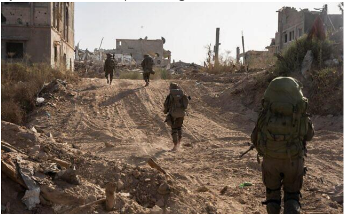
IDF troops operate in Gaza City's Shejaiya neighborhood, in a handout image published July 9, 2024

Military sources said the latest operation in Shejaiya has so far been highly effective, highlighted by the fact that troops managed to locate around nine significant tunnels in just 12 days.