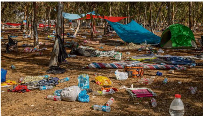
Nova music festival after October 7 attack

Reflecting on her career handling grave cases, she described the report's compilation as uniquely challenging. "It's profoundly different because the phenomenon itself is distinct," she said. "Sexual violence in war zones fundamentally differs from 'ordinary' sexual violence. It's aimed not just at the victim but at their entire community."