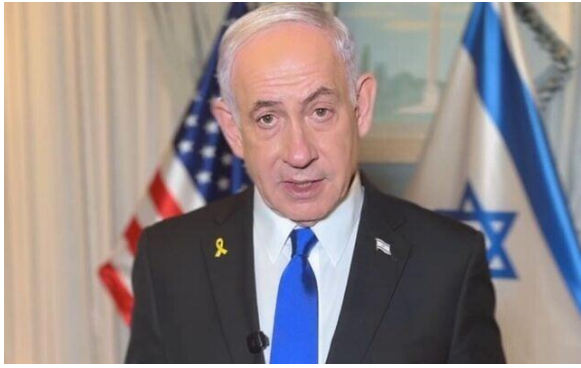
Prime Minister Benjamin Netanyahu speaks in a video message in Washington on July 8, 2025

heroic soldiers,” he said in a video shot in the Blair House. “Unfortunately, this effort is exacting a painful price from us, in the loss of our best sons.”