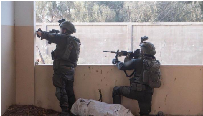
IDF soldiers operating throughout the Gaza Strip, July 9, 2025.

By JERUSALEM POST STAFF JULY 9, 2025 11:10 Updated: JULY 9, 2025 13:10