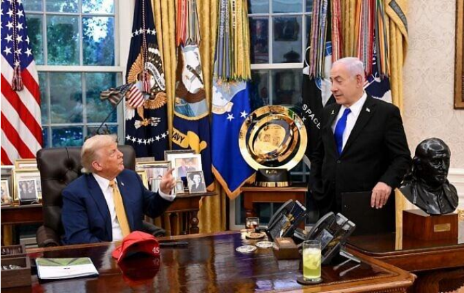
US President Donald Trump, left, meets Prime Minister Benjamin Netanyahu in the White House, July 8, 2025.