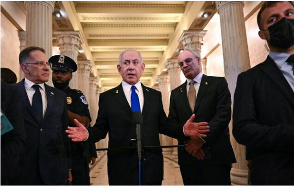
Prime Minister Benjamin Netanyahu (C) speaks to the press after meeting with US Speaker of the House Mike Johnson at the US Capitol in Washington, DC, on July 8, 2025.

Katz's briefing marred the hostage talks in Doha, Palestinian sources told the Kan public broadcaster, saying that his remarks led Hamas to be less flexible regarding the withdrawal of Israeli forces.