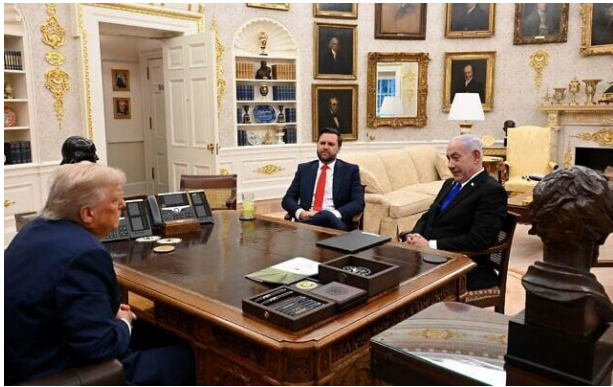
US President Donald Trump, left, meets US Vice President JD Vance, center, and Prime Minister Benjamin Netanyahu in the White House, July 8, 2025.

Netanyahu made a point of touting what he described as an unprecedented level of coordination between Israel and the US.