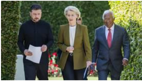
Ukraine's Vladimir Zelensky, European Commission President Ursula von der Leyen, and President of the European Council Antonio Costa in Aarhus, Denmark, July 3, 2025.

A special fund is being considered in the bloc's next seven-year budget, insiders have told the news outlet 9 Jul, 2025 11:31