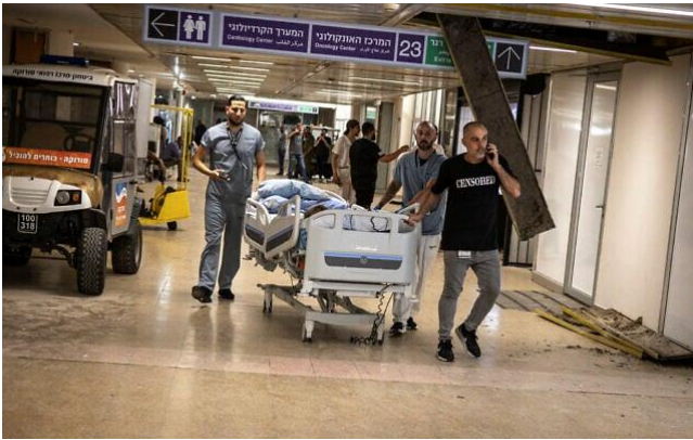
Medical workers wheel a patient to safety after a building at Soroka hospital was hit by an Iranian missile, in Beersheba, on June 19, 2025.

Public spending on higher education in Israel is also low compared to the average in OECD countries.