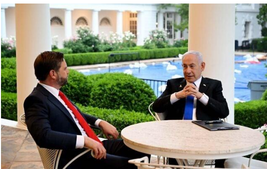
Prime Minister Benjamin Netanyahu, right, meets US Vice President JD Vance in the White House, July 8, 2025.

He said Israel is seeking a hostage-ceasefire on its own terms, and had accepted the latest proposal put forward by the mediators. "We are also prepared to end the war — on the conditions that Hamas can no longer act, that it no longer has governance or military capacities and that Gaza cannot be a threat to Israel."