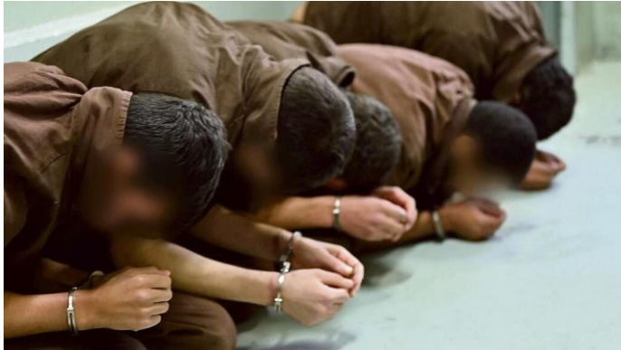
Hamas's Nukhba terrorists arrested in Israel

"We speak not from a political perspective but from the most basic human one: this cannot be a weapon of war—not in Darfur, not in Congo, not against Yazidis, not in Ukraine and not in Israel."