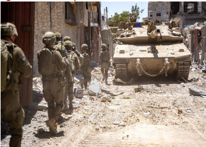
IDF soldiers operating throughout the Gaza Strip, July 9, 2025.