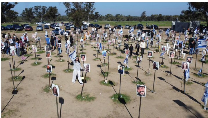
Memorial for Nova festival victims

aids in shaping frameworks for prosecuting perpetrators when identifying specific culprits among detained terrorists is challenging and evidence evaluation is complex.