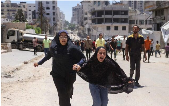
Two women react after an Israeli strike in Gaza City, on July 8, 2025.

A source familiar with the matter said the three issues Witkoff suggested have been solved were Hamas’s demand for guarantees from the mediators that the ceasefire will remain in place even if talks on the terms of a permanent ceasefire have not wrapped up by the end of the 60-day truce under discussion; Hamas’s demand for aid to be surged into Gaza through UN-backed mechanisms; and terms of the hostage-prisoner swap.