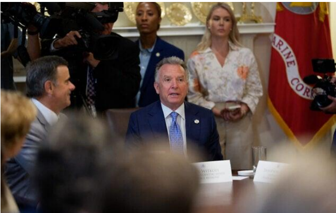
US Special Envoy to the Middle East Steve Witkoff speaks during a cabinet meeting with US President Donald Trump at the White House on July 8, 2025, in Washington, DC.

Hamas wants the text of the ceasefire to state that the truce will remain in place so long as negotiations on a permanent ceasefire continue, dropping the condition included in an earlier version that the talks be held "in good faith," the Arab diplomat and the source familiar said. Hamas feels Israel would use that clause to abandon the ceasefire, as it did in March.