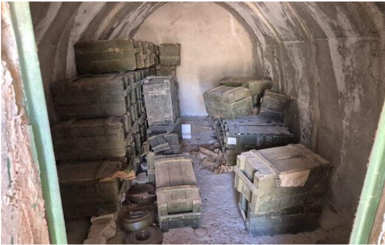
Weapons found by IDF troops in southern Syria, in an IDF handout photo released on July 13, 2025.

The raids were announced as deadly sectarian violence flared in Druze areas of the Syrian side of the Golan, which Israel has previously acted to protect from Islamists.