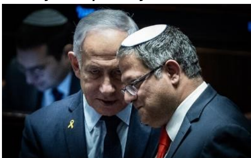
Prime Minister Benjamin Netanyahu (left) and newly reinstated National Security Minister Itamar Ben Gvir (right) in the Knesset plenum in Jerusalem, March 19, 2025.