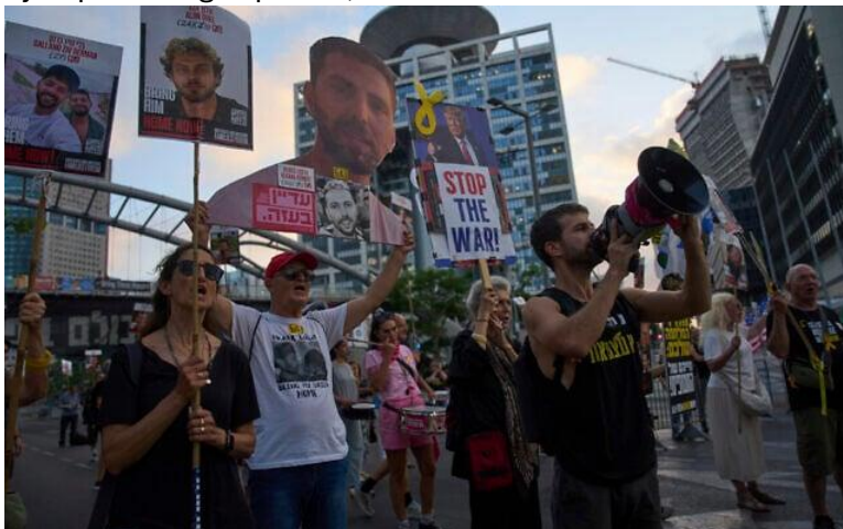
Relatives of hostages held by Hamas in the Gaza Strip and their supporters call for an immediate hostage release deal during a protest in Tel Aviv, Israel, July 10, 2025.