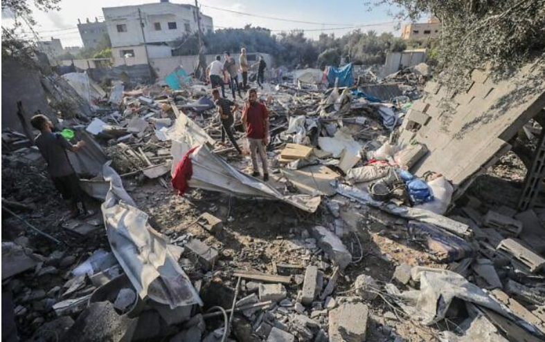
Palestinians at the site of an Israeli airstrike at the Al-Shati refugee camp, in the central Gaza Strip, on July 13, 2025.

Israel's military said Sunday that a strike near a Gaza water distribution point that reportedly killed several children was an accident, as Israeli aircraft pounded targets across the Strip.