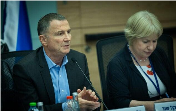
Likud MK Yuli Edelstein chairs a meeting of the Knesset Foreign Affairs and Defense Committee, July 1, 2025.

According to Kan, before it can come to a vote in the committee, the updated legislation is likely to be presented to the military in the coming days, during which time the Haredi United Torah Judaism and Shas parties' legislative boycott, intended to pressure Edelstein to advance the bill, will continue.