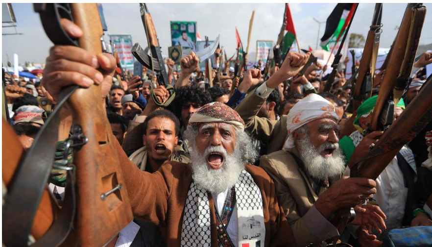
Houthi protest in Yemen

Yet the Houthis have managed to overcome the vast distance between Yemen and Israel, launching advanced ballistic missiles and waging an unprecedented naval blockade in the Red Sea. Their attacks have paralyzed Israel's southern port in Eilat and severely disrupted global shipping through the Suez Canal.