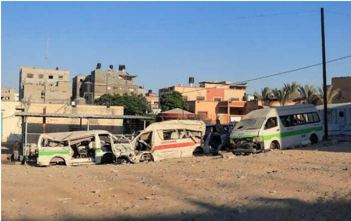
Heavily damaged ambulances lie outside the Nasser Hospital in Khan Younis, in the southern Gaza Strip, on July 11, 2025.

At least 143 Palestinians were killed in Gaza since Wednesday, according to statistics published by the Hamas-run health ministry on Friday night.