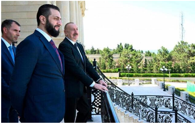
Azerbaijani President Ilham Aliyev, right, and Syria's interim president, Ahmad al-Sharaa, second left, stand on the balcony during their meeting in Baku, Azerbaijan, July 12, 2025.

A meeting this past weekend in Azerbaijan between Syrian and Israeli officials was reportedly to focus on the IDF presence in Syria. Sharaa, who was in Baku, the capital, to discuss energy cooperation with Azerbaijani leaders, did not attend the meeting with the Israelis.