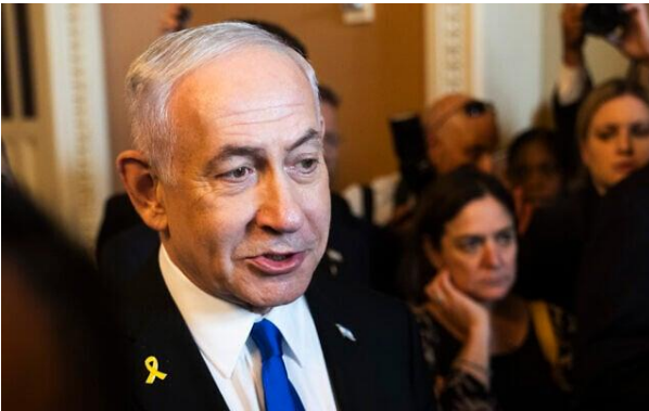
Prime Minister Benjamin Netanyahu speaks to reporters before a meeting with lawmakers at the US Capitol in Washington, July 9, 2025.

"We accepted it, Hamas refused it," Netanyahu said, adding that he "won't accept" a deal that allows Hamas to stay in Gaza and rearm."