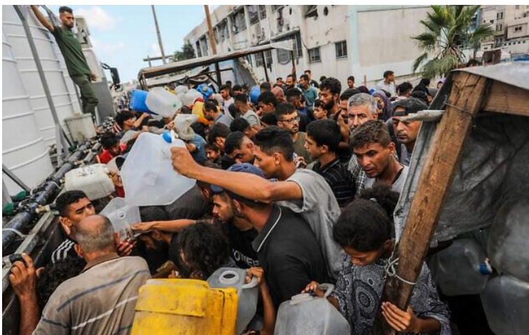
Palestinians collect drinking water in Khan Younis, in the southern Gaza Strip, on July 13, 2025.

Negotiations toward a ceasefire in Gaza have stalled primarily over when the war will end and to what