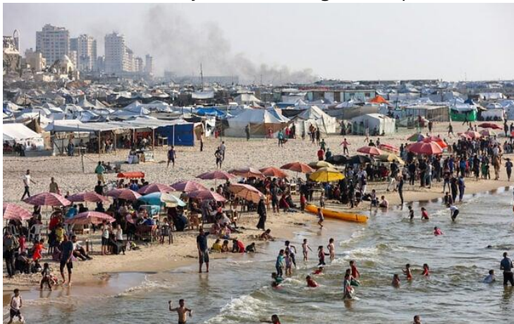
Palestinians gather at the beach near a makeshift displacement camp in Gaza City to escape the heat and tents, as smoke billows in the distance amid the ongoing war between Israel and Hamas on June 8, 2025.

Nevertheless, the IDF has not enforced the restriction against Palestinians seeking to cool off in the waters on the beach, but only those heading out deeper into the sea.