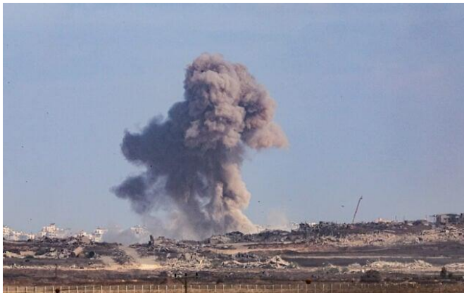
Smoke rises from an Israeli military operation in the northern Gaza Strip, as it seen from the Israeli side of the border, July 13, 2025.

The tolls, which cannot be verified, do not differentiate between civilians and combatants.