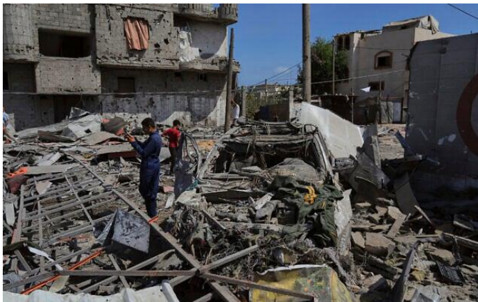
Palestinians inspect the wreckage of a gas station destroyed in an Israeli airstrike in Deir al-Balah, central Gaza Strip, July 12, 2025.

The military announced that two soldiers were moderately hurt on Saturday in separate incidents during fighting in Gaza, as fresh deaths were reported among Palestinians at an aid distribution site.