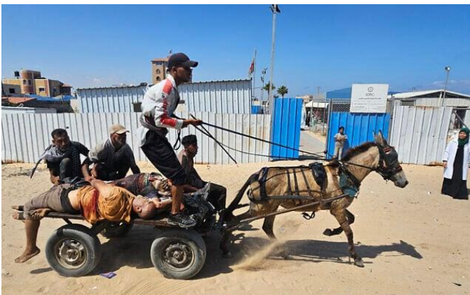
Palestinians transport victims to a Red Cross clinic in Rafah in the southern Gaza Strip after they were reportedly shot as they waited to receive food parcels at a distribution point run by the US and Israel-backed Gaza Humanitarian Foundation, on July 12, 2025.

The statement added that the IDF is continuing to investigate the claims of injuries on Saturday near the aid site.