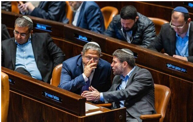
Finance Minister Bezalel Smotrich (right) of the Religious Zionism party talks to National Security Minister Itamar Ben Gvir of Otzma Yehudit at the Knesset plenum in Jerusalem, December 28, 2022.

But now, with furious negotiations for a 60-day truce underway in Doha, Kan reported on Saturday night that Netanyahu expects him to quit again, and is trying to ensure that this won't threaten the stability of his coalition government.