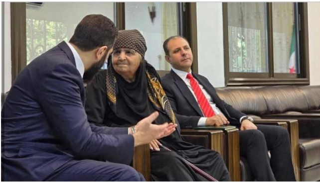
Al-Sharaa's reunion with relative reported to be his great-aunt