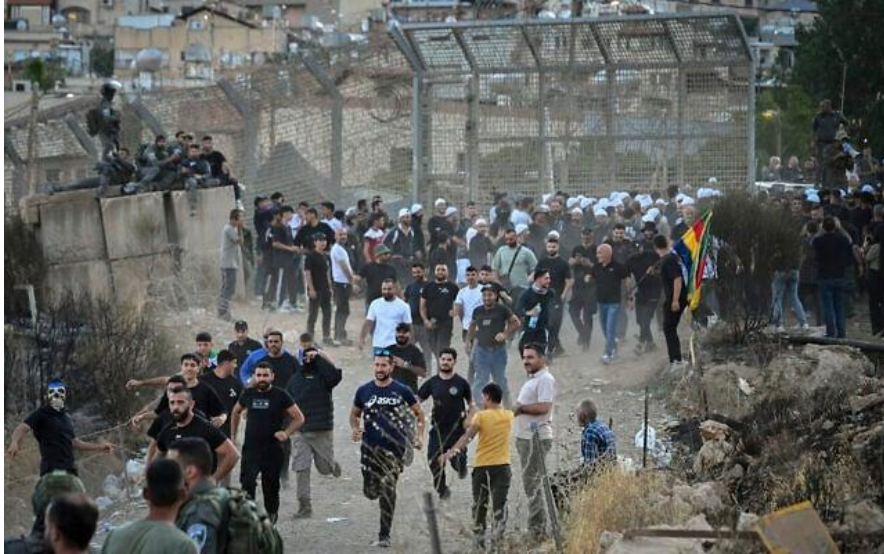
Druze in Israel protest near the Israeli-Syrian border fence in solidarity with Druze in Syria, July 16, 2025.