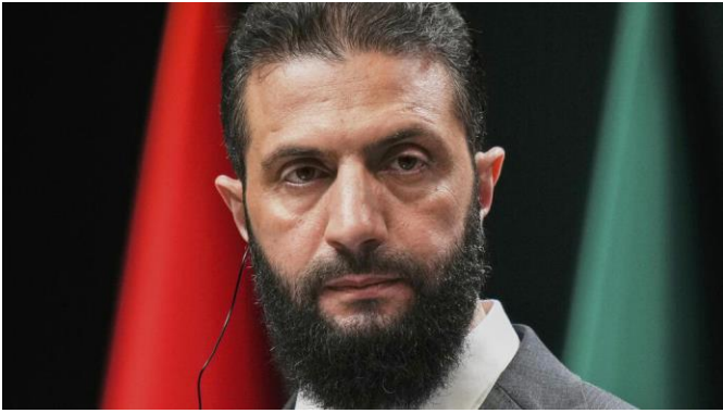
Syrian President Ahmad al-Sharaa