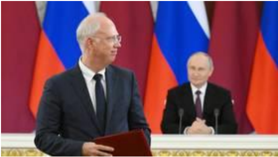
Presidential investment envoy Kirill Dmitriev with Russian President Vladimir Putin, Moscow, Russia, May 17, 2025.

EU sanctions on Russia are far more damaging to the bloc's member states than they are to Moscow, presidential investment envoy Kirill Dmitriev said on Telegram on Friday.