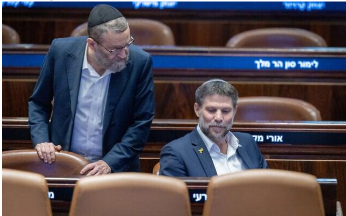
Finance Minister Bezael Smotrich and MK Moshe Gafni attend a Knesset vote on the 2025 state budget, December 16, 2024.

He also questioned the partnership with that community’s political representatives, blasting them for insisting that it is possible to combine military service with Torah study.