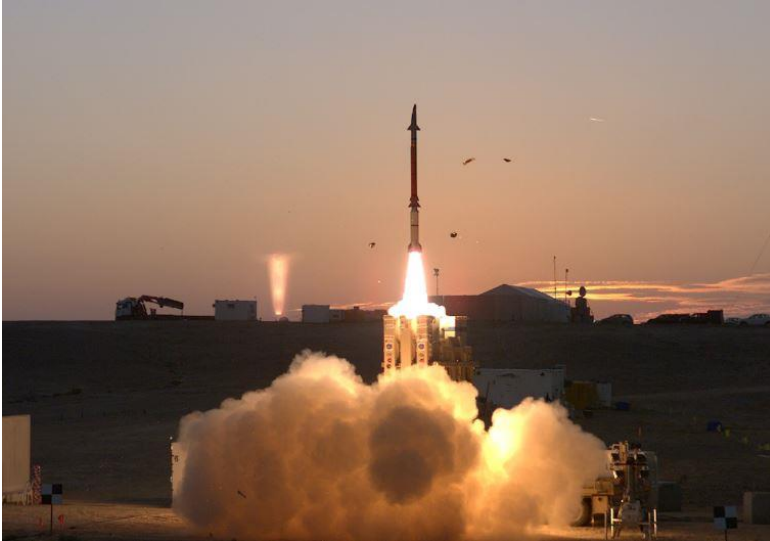
David's Sling

The fruitful cooperation between Israel and the US also entails a notable challenge. It is prohibited to sell a jointly produced system – for example, Arrow 3 and David's Sling – without US approval. In contrast, US approval was not required for the sale of Rafael's Spyder system to Romania last week (for about €2.2b.), as it is completely made in Israel.