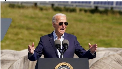
(Illustrative) Former US President Joe Biden speaks during a visit to Vernon Electric Cooperative in Westby, Wisconsin, US, September 5, 2024.

By JERUSALEM POST STAFF JULY 18, 2025 13:02 Updated: JULY 18, 2025 13:25