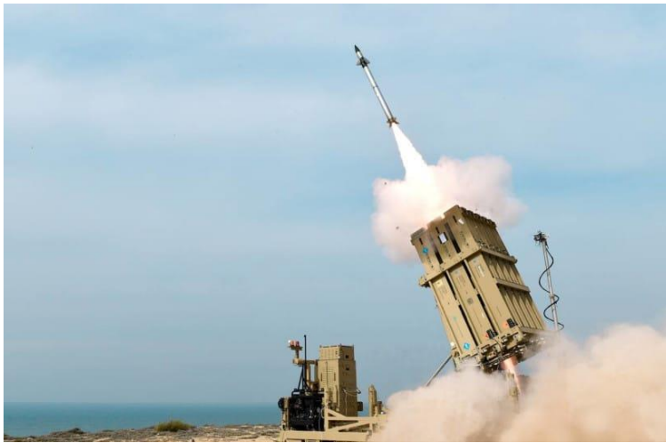
The Iron Dome air defense missile systems is seen during operational trials conducted following the conclusion Operation Shield and Arrow on May 14, 2023

The results of Israeli air defense against the Iranians as part of the Iran operation were unprecedented by any criteria. About 86% of Iranian ballistic missiles were intercepted by Israeli and US systems (THAAD and AEGIS), and about 99% of drones.