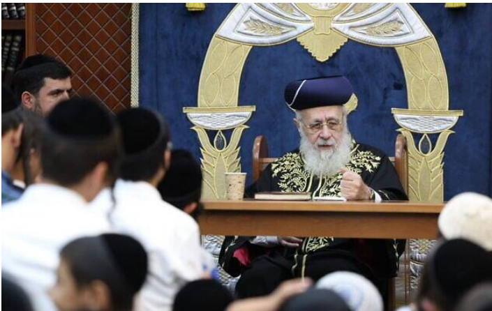
Rabbi Yitzhak Yosef delivers a lesson in Safed, on September 17, 2024.

Yosef referred to a famous quote by his late father, Shas founder and prominent ultra-Orthodox spiritual leader Rabbi Ovadia Yosef, who once called Netanyahu a “blind goat.”