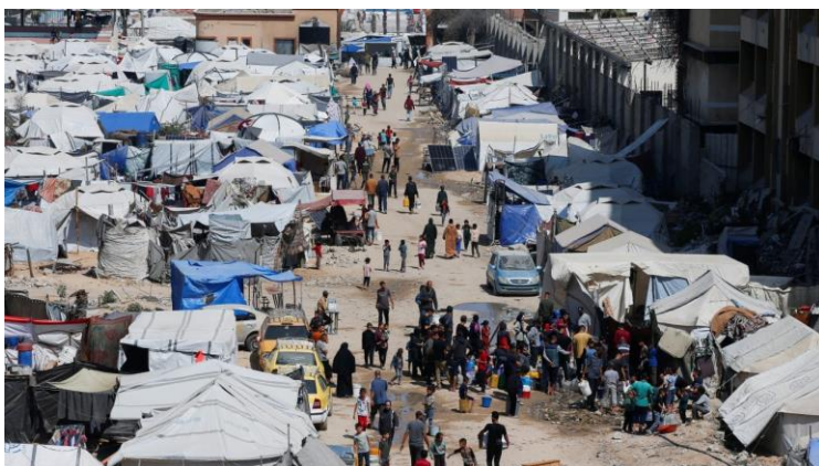
Displaced Palestinians fill water at a tent camp, in Gaza City, May 20, 2025.

By REUTERS, JERUSALEM POST STAFF JULY 18, 2025 22:12