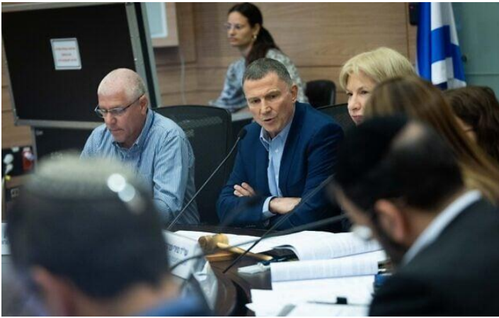
Likud MK Yuli Edelstein chairs a meeting of the Knesset Foreign Affairs and Defense Committee, May 8, 2025.

“He should have told us that he couldn’t pass this law. He misled us — that’s one issue. And the second is the prime minister. He bears responsibility because he is the head of the system. He did not lie to us about this matter, but he bears responsibility and he needs to fix it. He made an agreement with us in which the main issue was regulating the status of yeshiva students.”