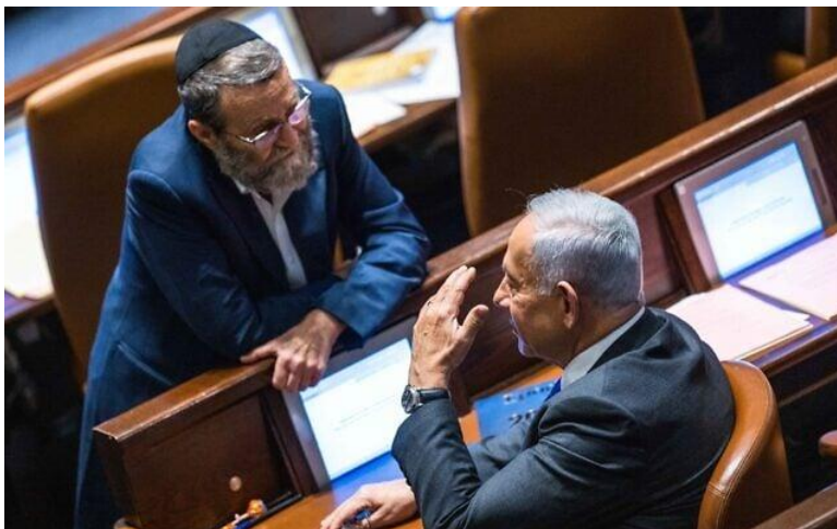
Likud's Benjamin Netanyahu, right, with UTJ MK Moshe Gafni in the Knesset on December 28, 2022.

Leading ultra-Orthodox political figures and rabbinical leaders launched a wave of harsh attacks on Prime Minister Benjamin Netanyahu and his national religious political allies on Thursday, following the Haredi Shas and United Torah Judaism parties' exit from the government.