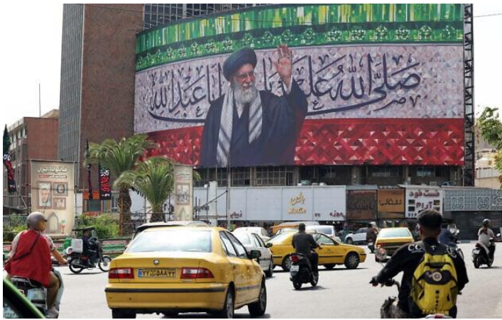
Motorists drive past a billboard depicting Iran's Supreme Leader Ayatollah Ali Khamenei in the center of Tehran's Valiasr Square on July 13, 2025.

The US-Iran negotiations, which began in April, were halted as Israel launched surprise strikes on Iran's nuclear and ballistic missile facilities on June 13, starting a war that the United States later joined. Israeli and American officials indicated the sides were coordinated after Washington came to the conclusion that talks with Iran were going nowhere.