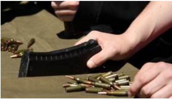
FILE PHOTO: A magazine and rounds compatible with a Kalashnikov assault rifle.

A Ukrainian military recruit has fatally shot two instructors during a training exercise in the Chernigov region, police confirmed on Thursday, after details leaked about the case.