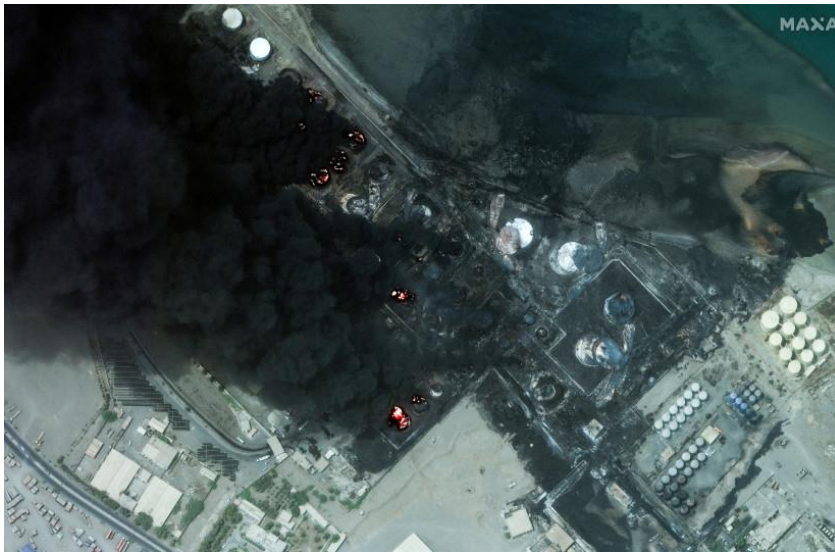
A satellite image shows a closer view of burning oil tanks after an Israeli air strike on Houthi military targets in Hodeidah, Yemen, July 21, 2024.

"The Houthis desperately wanted this direct confrontation to legitimize their claim of being in a fight with Israel," Omeisy said.