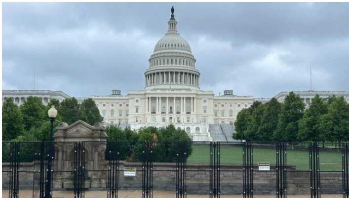
Fences set up around Capital ahead of Netanyahu speech

Police officers from nearby jurisdictions were brought into the city to bolster the deployment of DCPD in case protests of the prime minister, get out of hand.