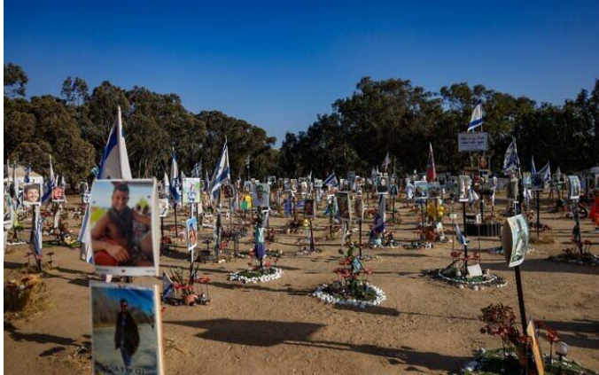
The site of the Re'im music festival massacre, in southern Israel, June 9, 2024.

"There is a circle, [people] laugh, and you don't know what to do in the moment, whether you should resist or let it pass, how to deal with the situation. There was a very difficult rape. At some point more people arrived and called for them and so they had to stop," added the man, who was identified by the Hebrew initial Dalet.