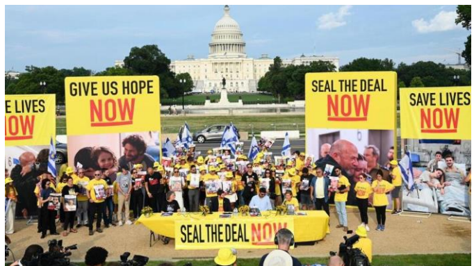
Families of hostages call for Netanyahu to agree to a deal

Protests are also planned for the families of hostages who arrived in the U.S. to call on Netanyahu to finalize a deal that would free their loved ones.