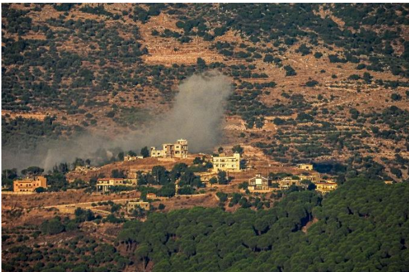
Smoke billows from a site targeted by Israeli shelling in the southern Lebanese border village of Kfarhamam on July 23, 2024

Additionally, a drone strike was carried out against a Hezbollah operative in southern Lebanon's Tallouseh, the IDF said. According to the military, the operative had been identified leaving a site from which rockets were launched at the Galilee Panhandle.