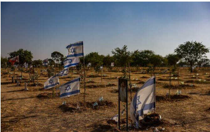
The site of the Re'im music festival massacre, in southern Israel, June 9, 2024.

A survivor of the Hamas massacre at the Supernova music festival on October 7 said he was raped by terrorists attacking the rave, the first time a male victim has come forward to publicly detail sexual offenses during the brutal assault.