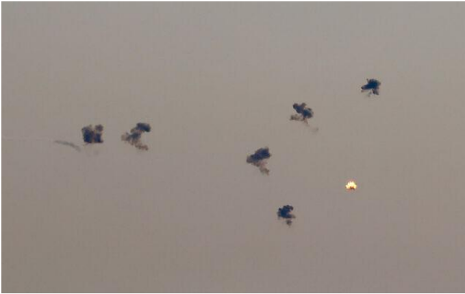
Rockets fired from southern Lebanon are intercepted by Israel's Iron Dome air defense system over the Upper Galilee region in northern Israel on July 23, 2024

The Israel Defense Forces said Wednesday that a soldier was seriously injured a day earlier by rocket fire from Lebanon on the Mount Dov area, as the Hezbollah terror group claimed a number of attacks on communities and outposts along the northern border.