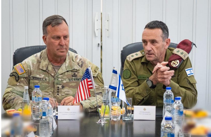
CENTCOM Commander General Michael Erik Kurilla met with IDF Chief of Staff Herzl Halevi in Israel, the IDF said on June 11, 2024.

Another aspect of being closely involved in talks with US Central Command is the way in which this links Israel to countries in the region. Israel has peace with Jordan, Egypt, Bahrain and the UAE. These countries are also under CENTCOM. When Israel was under European Command, the only regional power also under European Command was Turkey, because Turkey is in NATO.