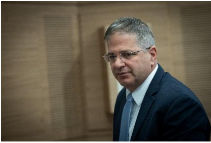
Education Minister Yoav Kisch attends an Education, Culture, and Sports Committee meeting at the Knesset in Jerusalem, on June 26, 2024

Of 60,000 civilians relocated from northern Israel at the outset of the war, 14,600 are children, scattered in kindergartens and schools or makeshift premises throughout the country. The evacuated residents do not yet know when they will be able to return to their homes.