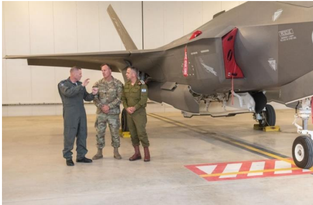
CENTCOM commander Michael Kurilla and IDF Chief of Staff Lt.-Gen. Aviv Kohavi visit Nevatim Airbase in southern Israel, November 15, 2022.

There have been other issues that came up during the war that don’t involve Central Command. Controversies, such as the US pausing shipment of 2,000-pound bombs and 500-pound bombs were a feature of the war. The heavy bombs could be used to take out Hamas targets deep underground.