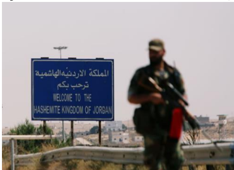
A Syrian soldier is seen standing in the Nasib border crossing with Jordan in Deraa, Syria July 7, 2018.

By JERUSALEM POST STAFF JULY 25, 2024 18:46 Updated: JULY 25, 2024 18:55