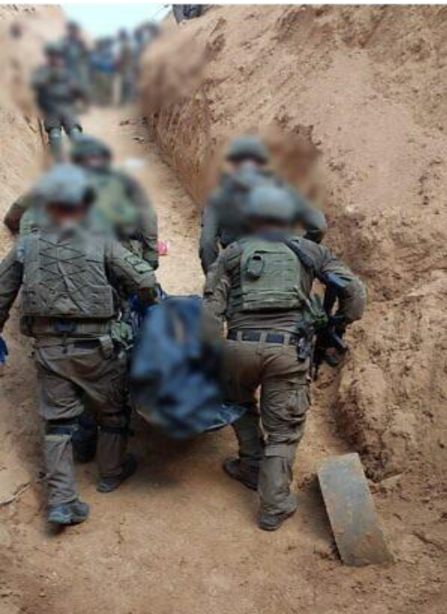
Members of the Shin Bet security agency recover the bodies of Israeli hostages in southern Gaza’s Khan Younis, July 24, 2024.

The bodies of the hostages were brought back to Israel on Wednesday afternoon and taken to be identified. Once they were identified, the families of the hostages were notified.