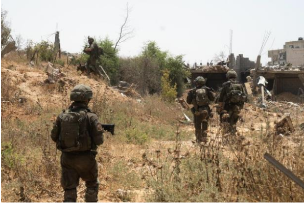
IDF forces operating in Gaza

He will also need to clarify if the administration plans to impose sanctions on ministers Itamar Ben-Gvir and Bezalel Smotrich following Ben-Gvir's statement on changing the status quo on the Temple Mount, which prompted Netanyahu's office to issue a statement from Washington asserting that the status quo will not change.