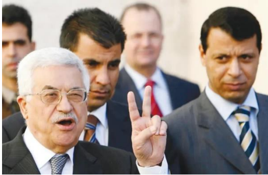
Dahlan and Abu Mazen in Ramallah

For more than six months, there has been talk in Israel about the need for a “day after” plan. Defense Minister Yoav Gallant has floated the idea several times, but it has come up against pushback from other parts of the government.