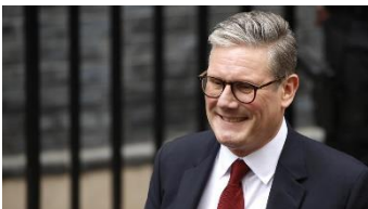
U.K. Prime Minister Keir Starmer

According to the Times, the new government in London will withdraw by the end of this week the objection that the previous government submitted to the International Criminal Court in The Hague (ICC) to the request to issue international arrest warrants for Prime Minister Benjamin Netanyahu and Defense Minister Yoav Gallant. Under the new government, according to the report, the United Kingdom is distancing itself from the US position on the issue of the tribunal, as well as on the issue of the war in Gaza.