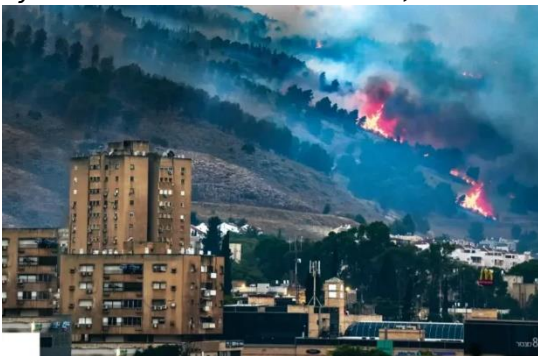
Fires in the north

By YONAH JEREMY BOB JULY 25, 2024 18:32 Updated: JULY 25, 2024 20:46