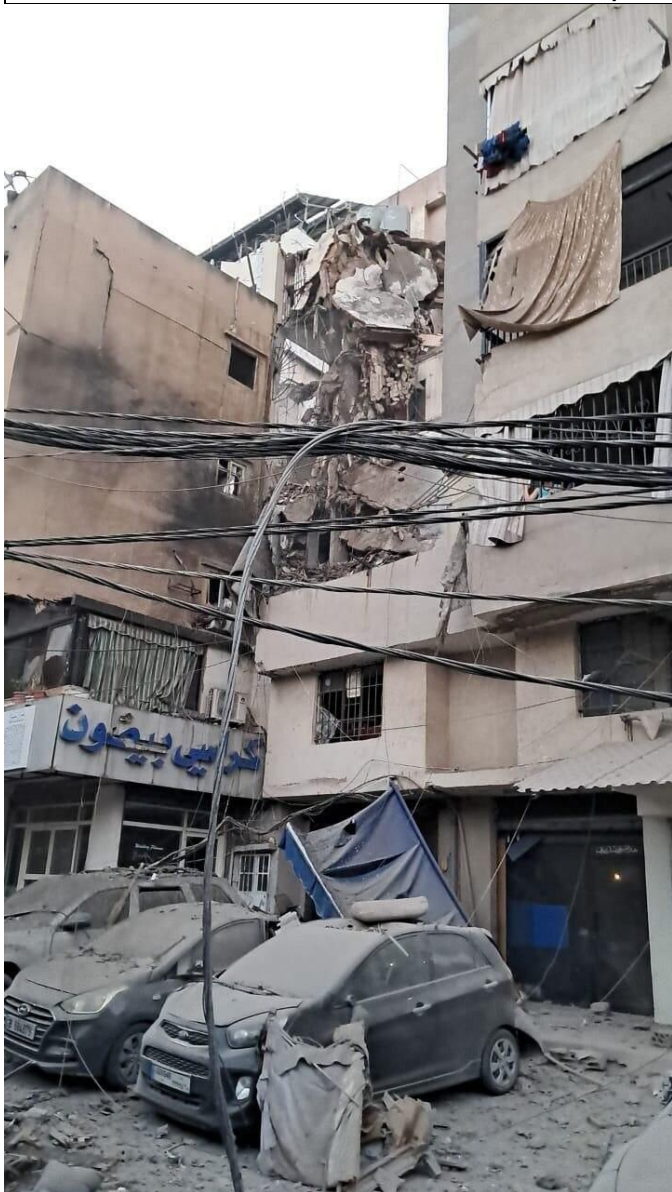
Damage from attack