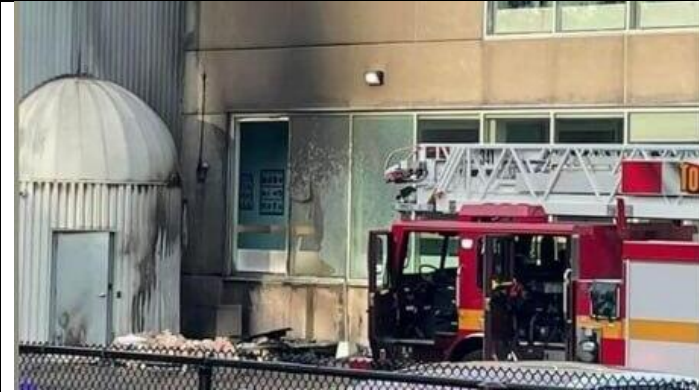
Firefighters on the scene at the Leo Baeck Jewish Day School in Toronto

The incident at the Baeck school comes a day after a bus used by a school for the Bobov Hassidic sect in Toronto was destroyed in an arson attack. Fire crews arrived Monday at the scene of the burning school bus and extinguished the flames, but the bus was completely destroyed and a truck parked next to it was damaged. No injuries were reported and the authorities have not yet determined who started the fire, but the alleged arson appears to be part of the continued harassment of Jews in Canada, including firebombing and graffiti attacks on Jewish businesses.