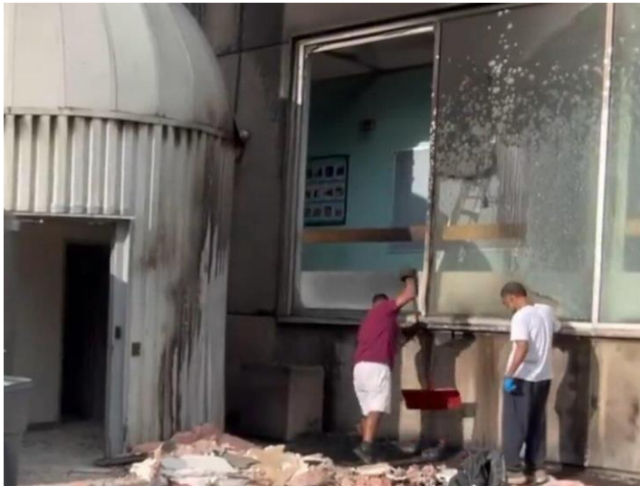
Fire damage, window smashed at Leo Baeck Jewish Day School in Toronto

The arson attack on the school bus is the latest in a series of antisemitic attacks that have included shooting at buildings of Canadian Jewish communities since October 7. Earlier this month, a synagogue and yeshiva in Toronto were vandalized, with police calling the attacks "hate-driven."