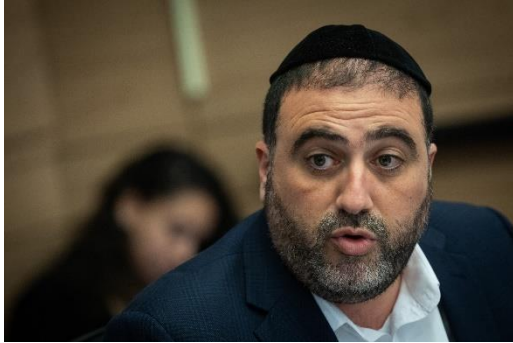
Interior Minister Moshe Arbel attends a Knesset committee meeting, Jerusalem, April 1, 2024.

“We will not remain silent in the face of the danger of internal breakdown at the hands of extremist elements,” Arbel wrote in a letter co-signed by MKs Eli Dallal (Likud), Hili Tropper (National Unity), Moshe Solomon (Religious Zionism), Meirav Ben-Ari (Yesh Atid), Efrat Reiten (Labor) and Oded Forer (Yisrael Beytenu).