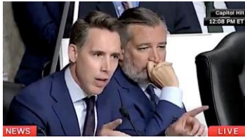
U.S. Sen. Josh Hawley, R-Mo.