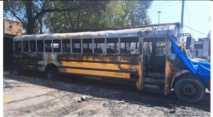
Burned out school bus used by a school for the Bobov Hassidic sect in Toronto

Toronto police told the CBC that it is investigating the fire in the school but that there is currently "no evidence" the fire was motivated by hate.