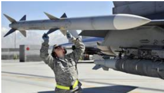
File photo: US Air Force personnel arms an F-16 fighter, March 2011, Bagram, Afghanistan

The US-made fighter jets that are expected in Ukraine soon will be equipped with modern American missiles, the Wall Street Journal has reported, citing high-ranking officials.