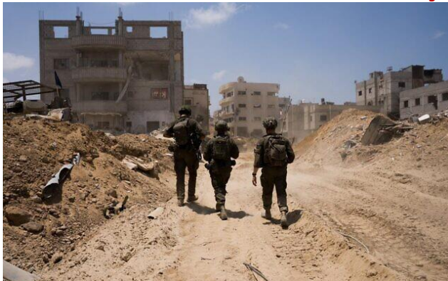
IDF troops of the 98th Division are seen operating in Gaza Strip, in a handout photo published July 30, 2024.

Amid the operation, the IDF said that troops with the division killed over 150 terror operatives, demolished tunnels and other sites used by Hamas , and recovered the bodies of the five hostages.