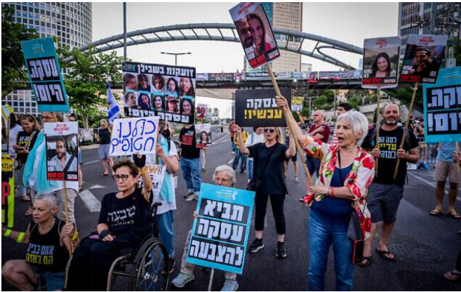
Protesters call for the release of hostages held by Hamas in the Gaza Strip since October 7, outside the IDF's Kirya base in Tel Aviv, July 28, 2024.

holding two Israeli civilians who entered the Strip in 2014 and 2015, as well as the bodies of two IDF soldiers who were killed in 2014.