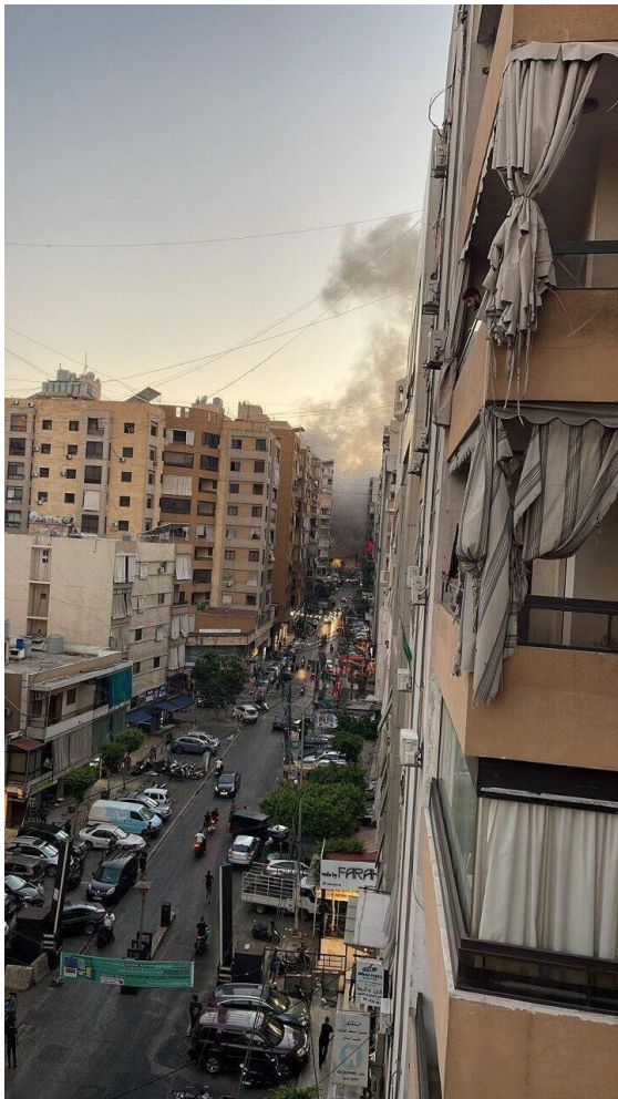
Explosion seen throughout Beirut

During the cabinet meeting on Monday to approve the operation, government ministers were not informed about the target, and they were not told details of the target immediately before the operation was carried out for fear of leaks.