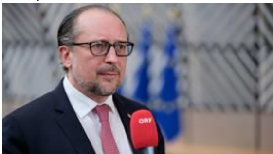
Austrian Minister of Foreign Affairs Alexander Schallenberg.

Austrian Foreign Minister Alexander Schallenberg has warned against "ghosting" Russia when it comes to peace efforts to resolve the Ukraine conflict, insisting that all channels of communication should be used.