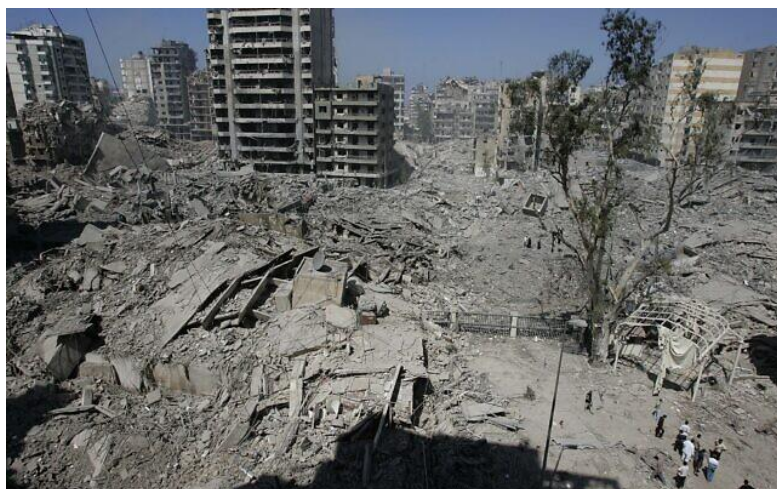
File: Lebanese people look to the site of the destroyed headquarters of Hezbollah at the southern suburbs of Beirut, Lebanon, Aug. 14, 2006.

Since October 8, Hezbollah-led forces have attacked Israeli communities and military posts along the border on a near-daily basis, with the group saying it is doing so to support Gaza amid the war there.