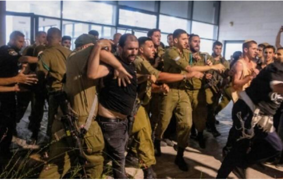
Israeli soldiers and police clash with right wing protesters, after they broke into the Beit Lid army base on July 29, 2024 in Kfar Yona.

Members of Prime Minister Benjamin Netanyahu's coalition turned on each other during a cabinet meeting Tuesday, hurling insults and recriminations over the previous day's break-ins at two IDF bases by far-right activists and MKs outraged over the arrest of soldiers suspected of severely abusing a Palestinian detainee.