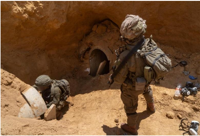
IDF troops are seen at the entrance to a tunnel in southern Gaza's Khan Younis where the bodies of five Israeli hostages were held, July 24, 2024

According to the military, the bodies were hidden behind a wall in the tunnel, and without exact information on the location — provided by a detained terrorist — it was unlikely they would have been found.