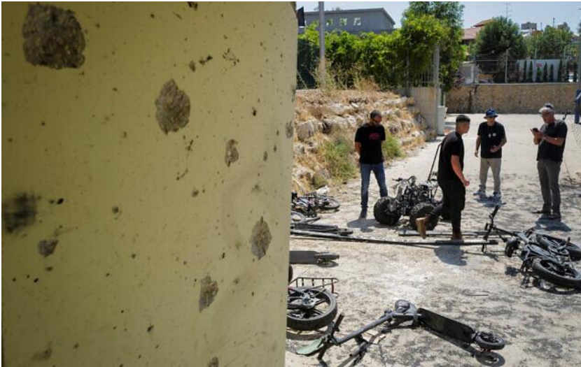
People at the scene of the deadly missile attack at a soccer field in the Druze town of Majdal Shams, in the Golan Heights, July 29, 2024.

"If they avoid civilians and they avoid Beirut and its suburbs, then their attack could be well calculated," he said.