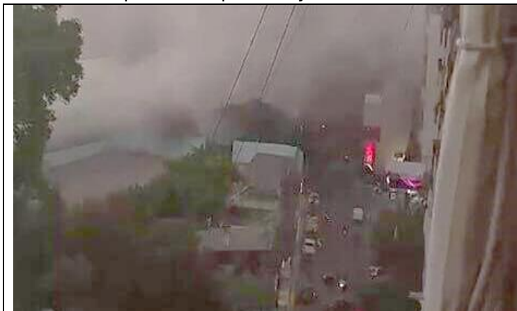
Beirut bombed in Israeli attack on Hezbollah's Dahieh quarter