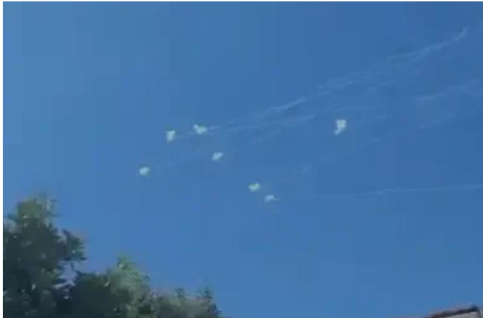
The interception of rockets in northern Israel. July 30, 2024.

"Immediately following the red alerts, we received a report of a casualty and headed to the scene. This was a difficult scene; we arrived on the scene and found a 30-year-old male with shrapnel wounds to his upper body. He was unconscious, and we immediately began medical treatment and resuscitation, following which we had to pronounce him dead."