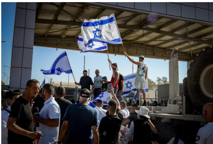
Far-right activists protest against the detention of nine Israeli reserve soldiers suspected of abusing a Hamas terror suspect, at the Sde Teiman military base near Beersheba, July 29, 2024.