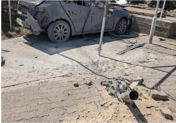
The scene of the direct rocket hit in northern Israel. July 30, 2024.

By Yael Halfon JULY 30, 2024 15:19 Updated: JULY 30, 2024 17:05