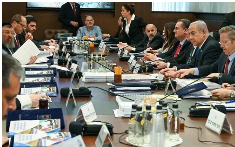
File: Prime Minister Benjamin Netanyahu leads a cabinet meeting

"Those who understand the army know that this is prohibited, unlike [people like] Ben Gvir who did not serve in the army who say it is fine," he charged.