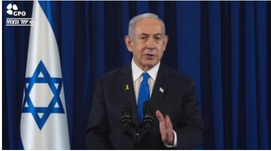
Prime Minister Benjamin Netanyahu

"Since the start of the war, I have made it clear that we are fighting against Iran's Axis of Evil. This is a war for survival against a stranglehold of terrorist armies and missiles that Iran seeks to tighten around our necks," he said in a statement shortly after a two-and-a-half-hour Security Cabinet meeting following the assassinations of top Hezbollah commander Fuad Shukr and Hamas politburo chief Ismail Haniyeh .