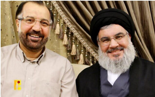
Fuad Shukr, Hezbollah's most senior military commander who was in an Israeli strike on Beirut on July 30, 2024, is seen with Hassan Nasrallah (right) in an undated photo.

Shukr was an adviser to Nasrallah, according to Hezbollah sources and the Israeli military's announcement of his killing. At least two women and two children were also killed, medical and security sources said. Defense Minister Yoav Gallant said Shukr "has the blood of many Israelis on his hands... We have shown that the blood of our people has a price, and that there is no place out of reach for our forces to this end."