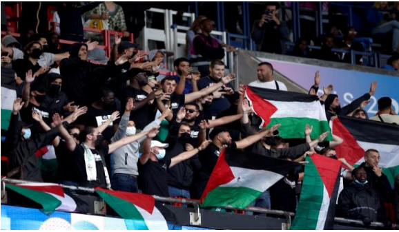
Paris 2024 Olympics - Football - Men's Group D - Israel vs Paraguay - Parc des Princes, Paris, France - July 27, 2024. Protesters hold up the flag of Palestine in the stands before the match.

The protesters chanted other hateful rhetoric while booing the Israeli team as they rose for their national hymn at the Parc des Princes on Saturday night. Multiple audience members were seen raising large signs that read “Genocide Olympics.”