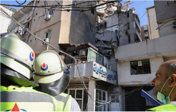
Lebanese civil defense check the area in the aftermath of an Israeli military strike on a building in a southern suburb of Beirut, July 31, 2024.

Lebanon's cabinet held an emergency meeting on Wednesday morning to discuss the strike on Beirut, and Information Minister Ziad Makary issued a statement read to reporters.