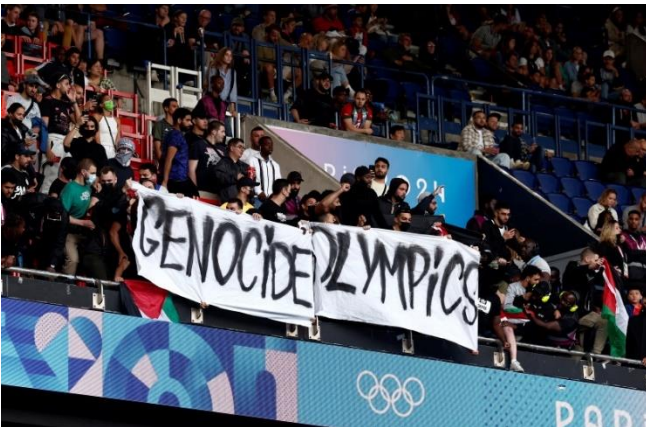
Paris 2024 Olympics - Football - Men's Group D - Israel vs Paraguay - Parc des Princes, Paris, France - July 27, 2024. Protestors display an anti Olympics banner and the flag of Palestine in the stands during the match.

As antisemitic protests grow increasingly tense and violent worldwide, Israeli athletes have been under strong protection from police and Olympic officials due to safety concerns. Additionally, Israeli athletes competing in Paris are being escorted by elite tactical units and are under 24-hour protective surveillance.