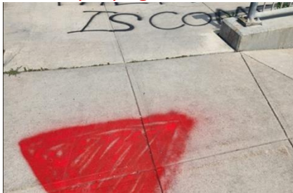
"The flood is coming" sprayed on the pavement in Jewish neighbourhood in Calgary.

Next to the phrase was an inverted red triangle, a symbol often used and popularized by Hamas propaganda videos to denote the targeting of enemies.