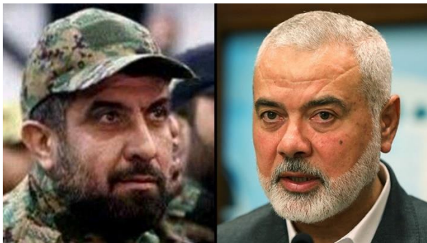
Top Hezbollah commander Fuad Shukr and Hamas politburo chief Ismail Haniyeh

"Every week, voices urge me to end the war, claiming it is unwinnable. We did not yield then, and I will not yield now. We have made significant achievements by making brave decisions despite heavy pressure."