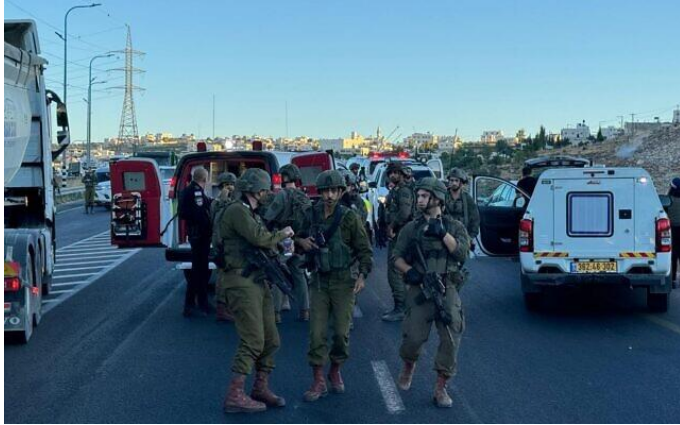
IDF troops at the scene of a terror attack in the southern West Bank on July 31, 2024

An Israeli man in his 50s was stabbed and seriously wounded by a Palestinian terrorist at a junction on Route 60 near the southern West Bank village of Beit Einun this morning, medics and the Israeli military said.