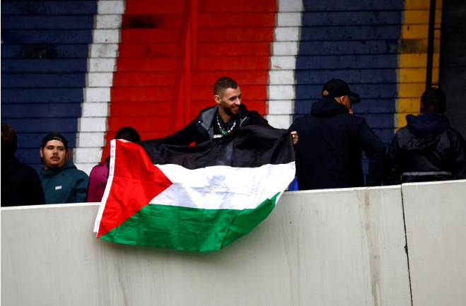
Paris 2024 Olympics - Football - Men's Group D - Israel vs Paraguay - Parc des Princes, Paris, France - July 27, 2024. A fan displays the flag of Palestine in the stands.

The anti-Israel demonstrators were promptly removed from the stadium, and no further antisemitic incidences were reported. A Paris Olympic organizer commented, “Paris 2024 strongly condemns these acts. A complaint has been lodged by Paris 2024, which is at the disposal of the authorities to assist with the investigation.”