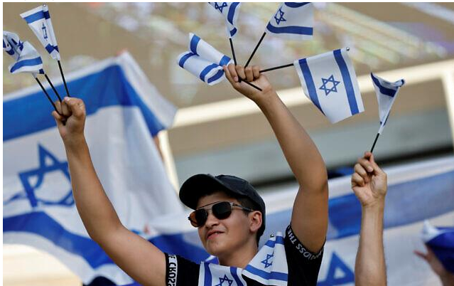
Israeli team fans wave flags as they wait for the Group D soccer match between Israel and Japan, at the La Beaujoire stadium, at the 2024 Summer Olympics, July 30, 2024, in Nantes, France.

Last week reports emerged that many members of the Israeli delegation had received threatening emails and phone calls inviting them to their own funerals and telling them not to attend the Olympics because if they did, there would be another "Munich 1972."