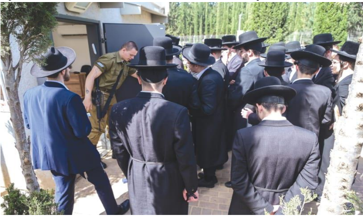
Haredim arrive at the IDF recruitment center in Tel Hashomer to process their draft exemptions.