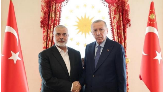
Ismail Haniyeh and Turkish President Recep Tayyip Erdogan

This also serves as a warning to Erdogan, who has hosted Hamas officials for high-profile summits and is considering allowing them to reside permanently in Turkey. However, given Turkey's NATO membership, such a bold Israeli operation on its soil is a non-starter.