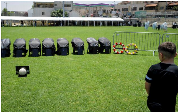
A memorial stands in the middle of a soccer field where 12 Druze children were killed the day before in a Hezbollah rocket strike, in the Golan Heights village of Majdal Shams, July 28, 2024.

Hezbollah has been attacking northern Israel on a daily basis since October 8 in support of Hamas in Gaza. Northern communities have been largely evacuated since then, while Israel has repeatedly warned it could be forced to launch a war against Hezbollah if it does not halt its attacks and withdraw from the border.