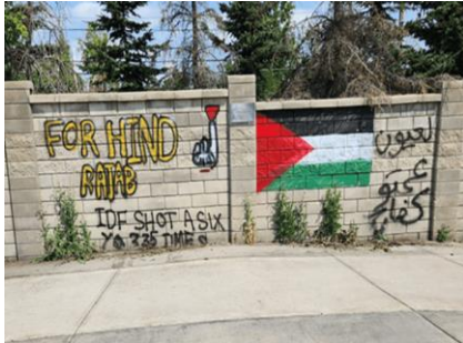
Pro-Hamas graffiti in Calgary. 29.7.2024

Threatening pro-Hamas messages were graffitied near a Calgary synagogue and Jewish day school on Saturday night, Canadian Jewish organizations announced on Monday, and the Calgary Beth Tzedec Congregation told The Jerusalem Post on Tuesday.