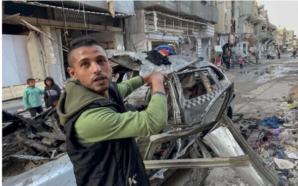
A man gestures in front of the car in which three sons of Hamas leader Ismail Haniyeh were reportedly killed in an Israeli airstrike in al-Shati camp, west of Gaza City on April 10, 2024.

Iran has made support for the Palestinian cause a centerpiece of its foreign policy since the 1979 Islamic Revolution. It has hailed Hamas's October 7 attack on Israel but denied any involvement.