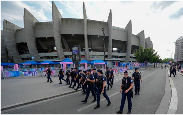
Illustrative: Police clear the streets outside the stadium ahead of the men's group D match between Israel and Mali at the Parc des Princes during the 2024 Summer Olympics in Paris, France, July 24, 2024.

Security around Israel's athletes at the 2024 Olympic Games in Paris was upped on Wednesday as authorities prepared for potential reprisals for the recent killings of top Hamas and Hezbollah officials, according to reports in Hebrew media outlets.