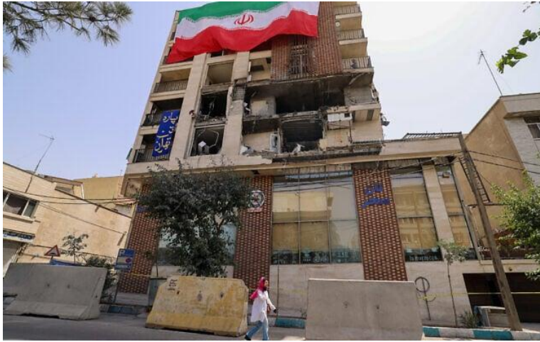
A woman walks past a residential building that was hit in an Israeli strike covered with a big Iranian flag, in Tehran on June 25, 2025.

Israel said its sweeping assault on the country's top military leaders, nuclear scientists, uranium enrichment sites, and ballistic missile program was necessary to prevent the Islamic Republic from obtaining a nuclear weapon and realizing its avowed plan to destroy the Jewish state.