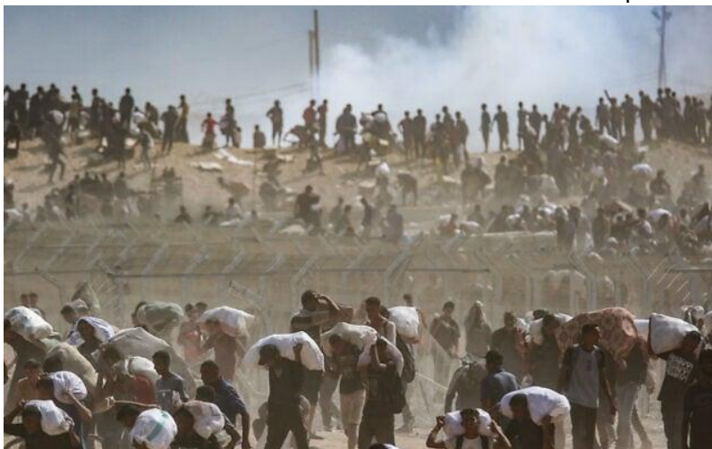
Displaced Palestinians carry food parcels and supplies from a Gaza Humanitarian Foundation aid distribution point along the Netzarim Corridor in the central Gaza Strip, August 4, 2025.

The efforts have the backing of major Arab Gulf monarchies , the officials said, as they are concerned about further regional destabilization if Israel’s government proceeds with a full reoccupation of Gaza, two decades after its unilateral withdrawal from the Strip.