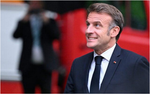
French President Emmanuel Macron arrives for talks with German Chancellor Friedrich Merz (not in picture) at Villa Borsig, the guesthouse of the German Foreign Ministry, in Berlin, Germany, July 23, 2025.

“Ultimately, what Israel needs to do for Israel’s security will be determined by Israel,” he said, when asked about Israel’s plan to take over Gaza City.