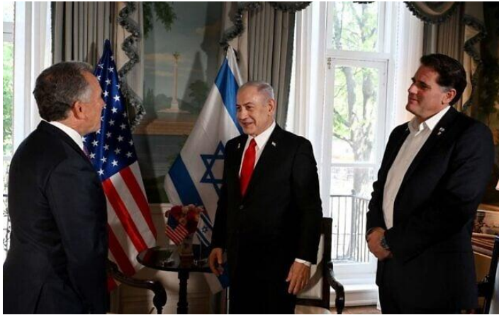
Prime Minister Benjamin Netanyahu (C) and Strategic Affairs Minister Ron Dermer (R) speak with US envoy to the Mideast Steve Witkoff (L), during the premier's visit to Washington, DC on July 7, 2025.

Meanwhile, on Saturday, some 20 Arab and Muslim countries, including Egypt, Saudi Arabia and Turkey, condemned the decision as "a flagrant violation of international law," and an attempt to entrench the illegal occupation and impose a fait accompli... in contravention of international legitimacy."