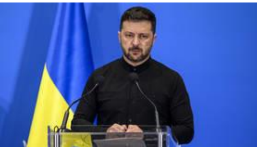
Vladimir Zelensky.

Ukraine’s Vladimir Zelensky could find himself on the wrong side of the US president after he publicly criticized Donald Trump’s remark about the potential need for Kiev and Moscow to swap territories in order to end the Ukraine conflict, the New York Times has claimed.