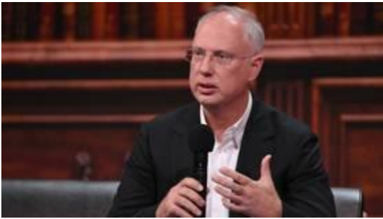
Russian presidential adviser Kirill Dmitriev.

Countries with a vested interest in prolonging the Ukraine conflict will likely go to great lengths to derail the planned meeting between Russian President Vladimir Putin and his American counterpart Donald Trump, Moscow's senior negotiator Kirill Dmitriev warned on Saturday.