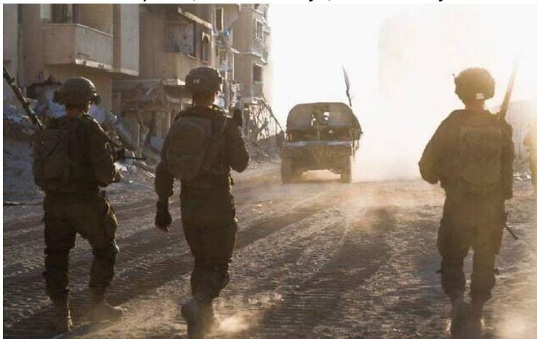
Illustrative: IDF soldiers are seen in the Gaza Strip in a handout photo released July 28, 2025.

Zamir said the IDF is "working on the new plan. We will deepen the planning, prepare at the highest level in all its aspects, and as always, we will carry out the mission in the best possible way."