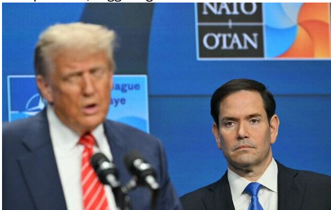
US Secretary of State Marco Rubio (R) listens as US President Donald Trump addresses a press conference during a North Atlantic Treaty Organization (NATO) Heads of State and Government summit in The Hague on June 25, 2025.

Macron announced on July 25 that France would recognize a Palestinian state at the UN General Assembly in September, triggering a wave of similar declarations by other countries, including Britain and Canada.