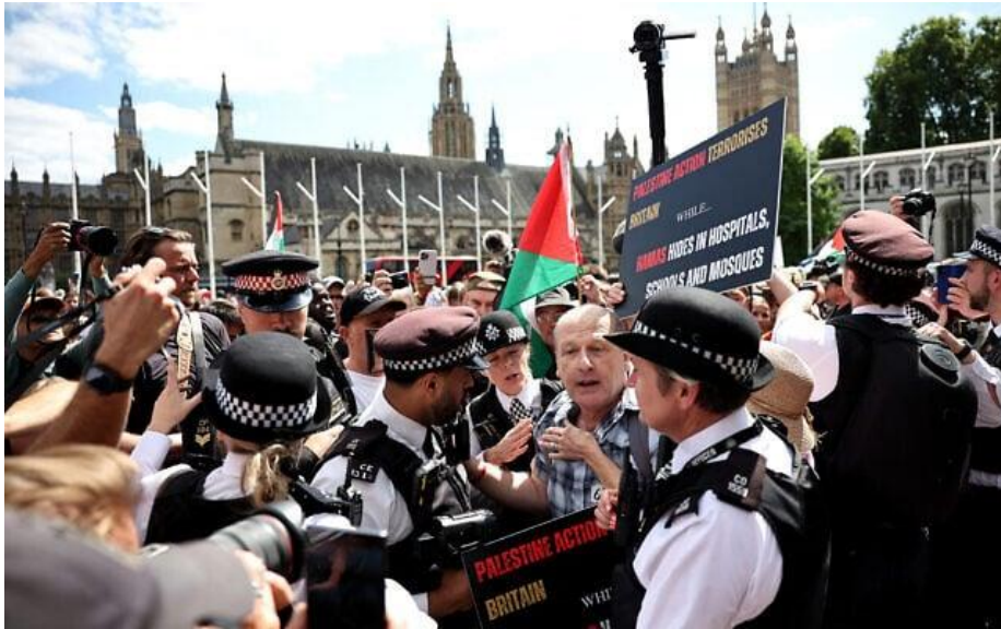
Police officers remonstrate with a protester during a "Lift The Ban" demonstration in support of the proscribed group Palestine Action, calling for the recently imposed ban to be lifted, in Parliament Square, central London, on August 9, 2025.

LONDON — Police in London arrested at least 365 people for supporting Palestine Action on Saturday at the latest and largest protest backing the group since the government banned it last month under anti-terror laws.