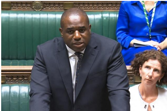
In this video grab taken from footage broadcast by the UK Parliamentary Recording Unit (PRU) via the Parliament TV website on September 2, 2024, Britain’s Foreign Secretary David Lammy makes a statement on arms sales to Israel.

British exports amount to less than one percent of the total arms Israel receives, and Lammy told parliament on Monday that the suspension would not have a material impact on Israel’s security.