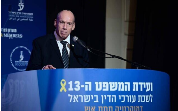
State Comptroller Matanyahu Englman speaks at an Israel Bar Association conference in Tel Aviv, September 3, 2024.

State Comptroller Matanyahu Englman excoriated the country’s political and military leaders in a speech on Tuesday, accusing them of impeding inquiries into Hamas’s October 7 massacre and refusing to take any responsibility for it.