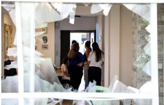
Residents check the damage caused by a rocket fired from Lebanon in the Israeli coastal town of Acre on August 25, 2024.

“As of now, we are still committed to meeting the deficit target for 2024 as we expect the deficit to be on a downward slope in the last quarter of the year,” Smotrich said.