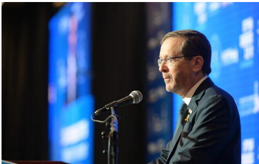
President Isaac Herzog speaks at the Israel Bar Association annual conference in Tel Aviv, September 3, 2024.

“Don’t you dare,” said Herzog, speaking to the Israel Bar Association. “Let us recover and heal after the terrible break. We must not make fateful decisions regarding the country’s core values without a broad consensus, and an in-depth and shared dialogue.”