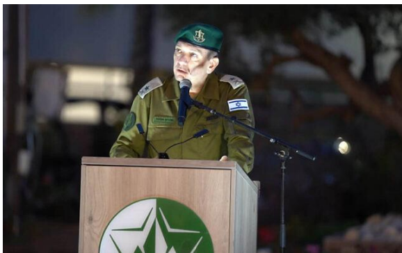
Military Intelligence Directorate chief Maj. Gen Aharon Haliva speaks at an intelligence officers’ graduation ceremony, January 3, 2024.

He said he believes that it is “very doubtful if it will be possible to restore this value in the future.”