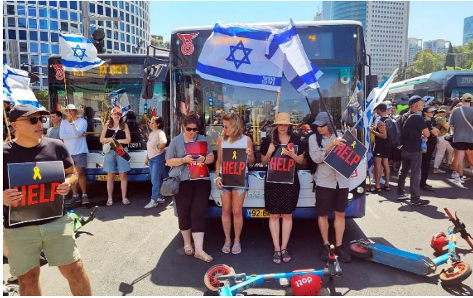
In Tel Aviv, protesters demanding a hostage release deal block the Ayalon Highway in Tel Aviv, September 2, 2024.

Turning to the terms of the ceasefire deal, Netanyahu said nobody is more committed to freeing the hostages than he is.