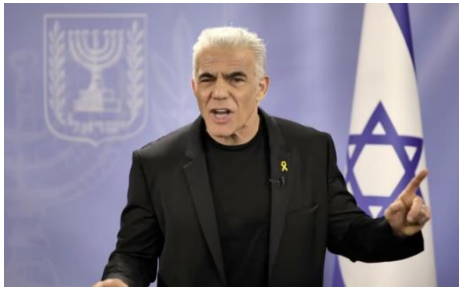
Opposition Leader Yair Lapid makes a video statement on September 2, 2024.

Lapid appealed to the “more responsible” people in Netanyahu’s coalition to give him an ultimatum that is the opposite of far-right minister Itamar Ben Gvir’s: “You can tell him, if there is no deal, there’s no government.”