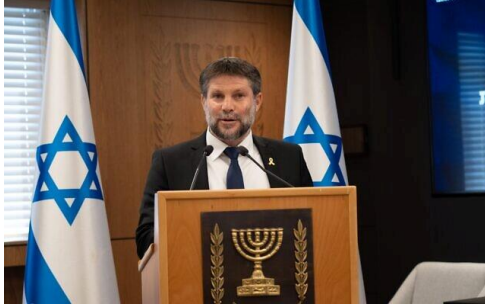
Finance Minister Bezael Smotrich speaks at a press conference in Jerusalem, Sept. 3, 2024.

Finance Minister Bezael Smotrich on Tuesday presented an initial state budget framework for 2025 based on a deficit target of up to 4 percent of gross domestic product, which will necessitate NIS 35 billion ($9.5 billion) in spending adjustments to finance the costs of the ongoing war.