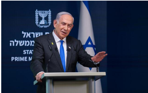
Prime Minister Benjamin Netanyahu speaks during a press conference in Jerusalem on September 2, 2024.

By Tol Staff and Agencies Today, 11:11 am