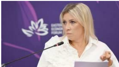
Russian Foreign Ministry spokeswoman Maria Zakharova

Russia will initiate an immediate and painful response to any further act of terrorism committed by Kiev, Foreign Ministry spokeswoman Maria Zakharova warned on Wednesday, directing her comments to EU and NATO leaders.