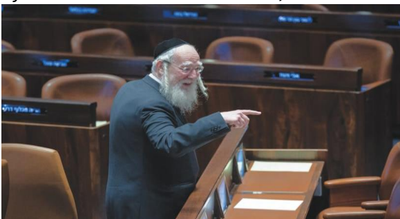
UTJ MK Yisrael Eichler points at a fellow lawmaker in the Knesset plenum.

By ELIAV BREUER SEPTEMBER 4, 2024 17:44 Updated: SEPTEMBER 4, 2024 18:12