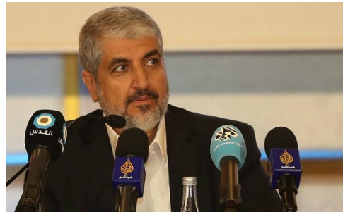
Former chief of Hamas' Political Bureau Khaled Mashaal speaks during a press conference in the Qatari capital, Doha on May 1, 2017.

Charging Hamas and Sinwar, who is in hiding, allows the federal government to add resources to tracking the group and subpoenaing individuals who are alleged to support it. Naming Mashaal suggests the Biden administration may plan to pressure Qatar, one of a handful of countries that has relations with Hamas, to hand over its leaders based in the country.