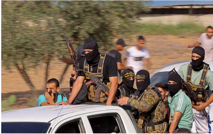
Palestinian Islamic Jihad terrorists are seen on their way to cross the Israel-Gaza border fence from Khan Younis during the Hamas-led onslaught of October 7, 2023.

"Those defendants... led Hamas' efforts to destroy the State of Israel and murder civilians in support of that aim in its attacks over the past three decades," Garland said.