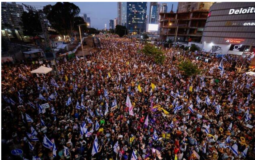
Large crowds of Israelis call for an urgent deal to secure the release of hostages held by Hamas in Gaza, outside the Defense Ministry headquarters in Tel Aviv, September 1, 2024.

After US President Joe Biden said Sunday that he was close to presenting a final proposal to the sides by the end of the week, Kan reported that Washington plans to do so by Friday.