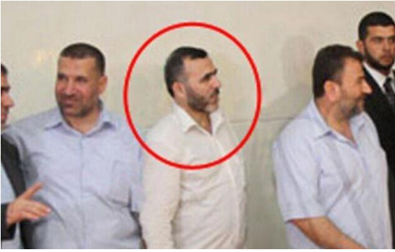
Marwan Issa, the deputy head of Hamas's military wing, circled in a photo circulated on social media in 2015. The photo or its source could not be immediately verified.