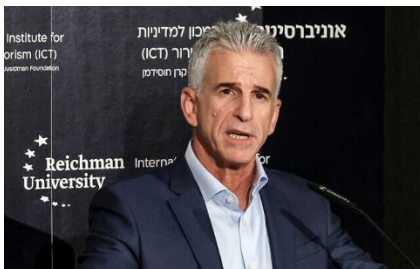
Israel's Mossad Director David Barnea speaks during the International Institute for Counter-Terrorism (ICT) World Summit in the central coastal city of Herzliya on September 10, 2023.

There is no replacement for the IDF's physical presence along the corridor — neither sensors nor alternative forces — Netanyahu said.