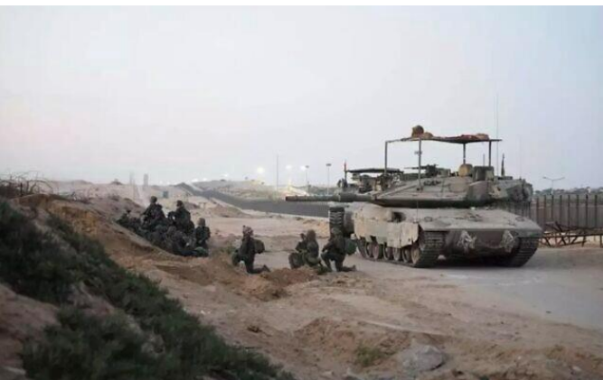
IDF troops operate along the Philadelphi Corridor at the Gaza-Egypt border in August 2024.