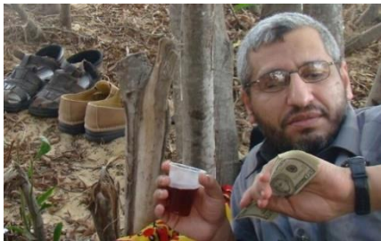
The head of Hamas's military wing Muhammad Deif in an undated photo

Sinwar was appointed the overall head of Hamas after the killing of Haniyeh in Iran and sits atop Israel's most-wanted list. He is believed to have spent most of the past 11 months since Hamas's October 7 massacre living in tunnels under Gaza, and it is unclear how much contact he has with the outside world. He was a long-serving Palestinian prisoner freed in a 2011