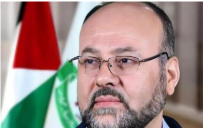
Ali Baraka of Hamas (Screenshot)

The criminal complaint describes the massacre as the “most violent, large-scale terrorist attack” in Hamas’s history. It details how Hamas operatives arrived in southern Israel with “trucks, motorcycles, bulldozers, speedboats, and paragliders” and engaged in a brutal campaign of violence that included rape, genital mutilation and machine-gun shootings at close range.