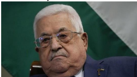
Palestinian Authority Chair Mahmoud Abbas

Dozens of bereaved families, including those who lost loved ones in the past year, filed a lawsuit against the PA in the Jerusalem District Court back in July demanding NIS 210 million from the authority.