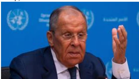
Sergey Lavrov holds a press briefing at the United Nations headquarters in New York City, July 17, 2024

The US is well aware that any decision to supply Ukraine with long-range missiles crosses Moscow's "red lines" and could trigger a third world war, Russian Foreign Minister Sergey Lavrov has warned.