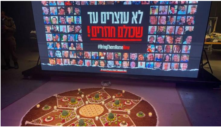
Memorial ceremony for victims of the Nova Music Festival

The lawsuit claims the Palestinian Authority initiates, supports and encourages terrorism against Israeli citizens and financially rewards terrorists through payments to them and their families. The lawsuit argues that the PA uses the "more blood equals more money" paradigm in these payments.