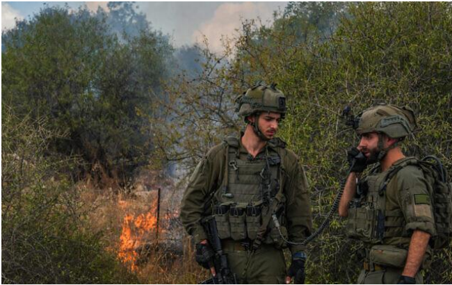
Security forces at the scene where a missile fired from Lebanon hit an open area near the northern city of Kiryat Shmona, September 4, 2024.

Since October 8, Hezbollah-led forces have attacked Israeli communities and military posts along the border on a near-daily basis, with the group saying it is doing so to support Gaza amid the war against the Hamas terror group there. More than 8,000 rockets have been fired at Israel from Lebanon since the start of the war.