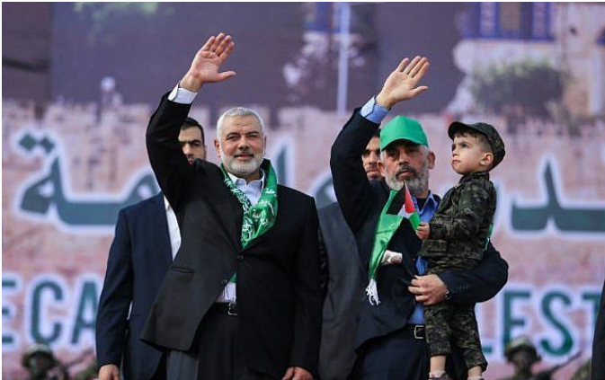
Hamas leader Ismail Haniyeh (L) and Hamas's leader in the Gaza Strip Yahya Sinwar wave during a rally marking the 30th anniversary of the founding of the Islamist terror movement, in Gaza City, on December 14, 2017.