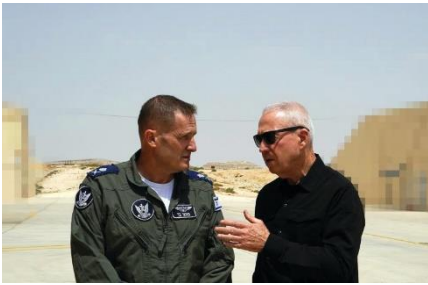
Yoav Gallant with IAF chief Maj.-Gen. Tomer Bar.

Defense Minister Yoav Gallant has had to dance his way through at least three “acts” in the lifetime of the current coalition.