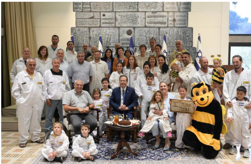
President Isaac Herzog meets with beekeepers ahead of Rosh Hashanah, September 10, 2023

In his Rosh Hashanah message to Jewish communities worldwide, President Isaac Herzog called for greater engagement in an "inclusive, vibrant, empowering" Jewish dialogue across the world.