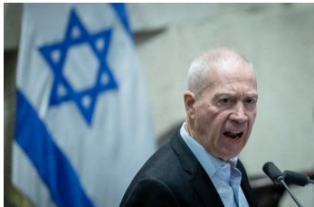
Defense Minister Yoav Gallant during a discussion and a vote at the assembly hall of the Knesset in Jerusalem. July 30, 2023

According to Gallant, all of his positions have been consistent in protecting the IDF from harm as his first priority. The Jerusalem Post understands that he is insisting Netanyahu compromise on the judicial overhaul less because he might oppose elements of government policy in principle, but because his primary focus as defense minister has to be to maintain the military’s strength.