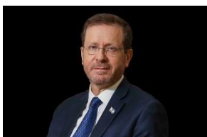
Israel's President Isaac Herzog.

The president has been struggling to get power brokers from all sides, to sit and negotiate an exit from the political and legal crisis the country has entered into as a result of the judicial reform .