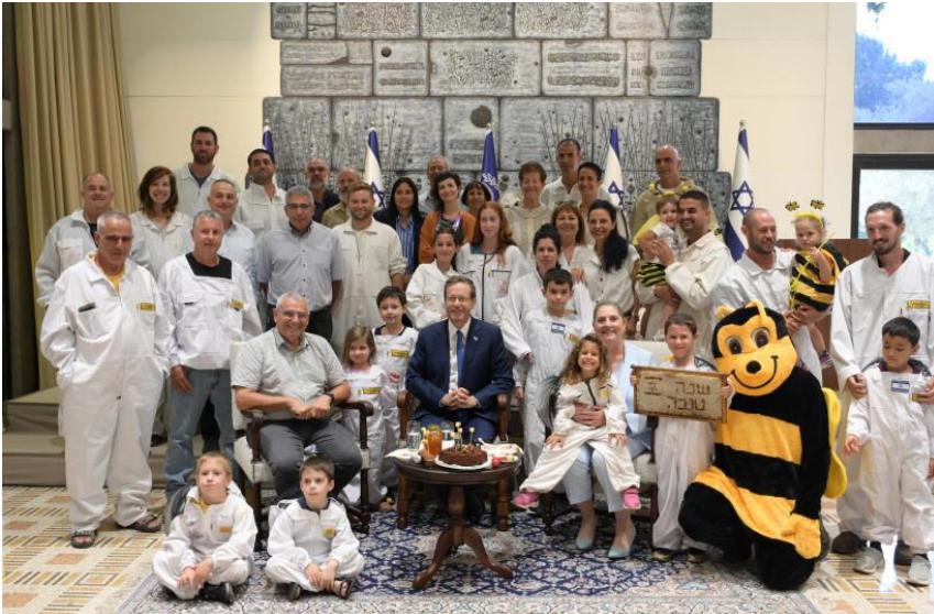
President Isaac Herzog meets with beekeepers ahead of Rosh Hashanah, September 10, 2023

In his Rosh Hashanah message to Jewish communities worldwide, President Isaac Herzog called for greater engagement in an "inclusive, vibrant, empowering" Jewish dialogue across the world.