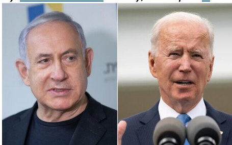
Prime Minister Benjamin Netanyahu (L) and US President Joe Biden (R).

Prime Minister Benjamin Netanyahu is preparing to take off for the United States early Monday, hours after the end of the Rosh Hashanah holiday, on a visit that will feature a series of meetings with world leaders at the United Nations General Assembly but will still be far from what he'd hoped for.