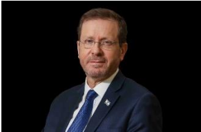
Israel's President Isaac Herzog.

The president has been struggling to get power brokers from all sides, to sit and negotiate an exit from the political and legal crisis the country has entered into as a result of the judicial reform .