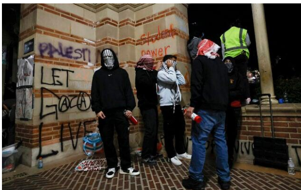
File: Protesters inside the encampment set up by pro-Palestinian students and activists wrap scarves on their faces as they demonstrate on the campus of the University of California, Los Angeles (UCLA) in Los Angeles, California, on May 1, 2024.

As antisemitism continues to rise on university campuses, more than three-quarters of Jewish students around the world are afraid to share their identities publicly, a new study has found.