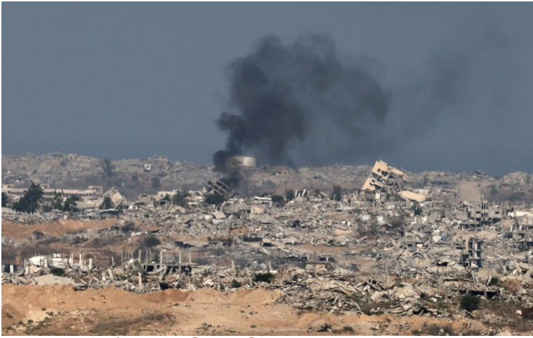
This picture taken from a position at Israel's border with the Gaza Strip shows smoke amid Israeli strikes on September 16, 2025

Last week, the IDF ordered Palestinians in all areas of Gaza City to evacuate immediately ahead the offensive. However, moving can be costly, and space is at a premium in the overcrowded south of the Strip. Many had said they would not leave, exhausted from repeated displacement over the course of the 23-month-old war.