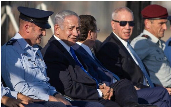
From left, Tomer Bar, Commander of the Israeli Air Force, Prime Minister Benjamin Netanyahu, President Isaac Herzog, Defense Minister Yoav Gallant and IDF Chief of Staff Herzi Halevi at a graduation ceremony for soldiers who have completed the IAF Flight Course, at the Hatzerim Air Base in the Negev Desert, June 29, 2023.

The commission urged Israel to “end the genocide in Gaza” and called on UN member states to halt arms transfers to Israel and to prosecute individuals or corporations under their jurisdiction complicit in genocide.