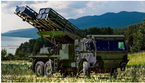
A PULS precision artillery system

Elbit's PULS system is designed to launch different types of rockets with varying ranges from the same launcher. Systems of this kind have in recent years been sold to the armies of the Netherlands, Germany, Denmark, and other European countries, with the aim of improving their offensive capabilities in the wake of Russia's invasion of Ukraine.