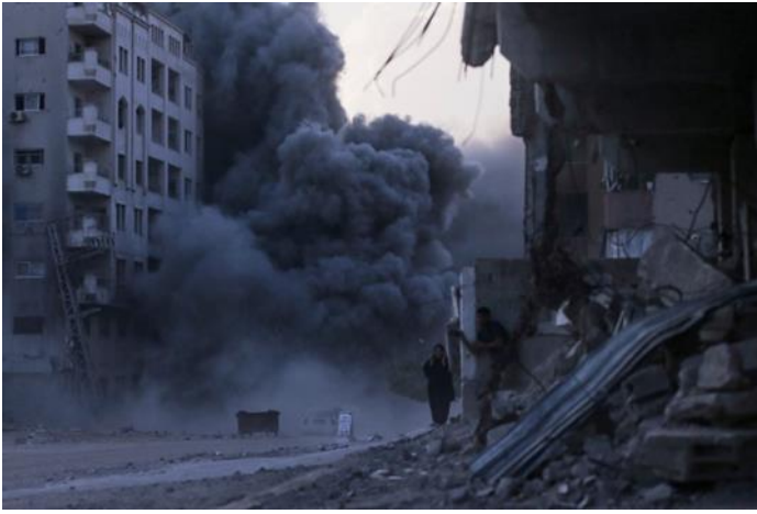
Palestinians take cover during an Israeli strike on a building in Gaza City, September 7, 2025, after the Israeli army issued a prior warning.

“The Commission finds that Israel is responsible for the commission of genocide in Gaza,” said Navi Pillay, chair of the commission. “It is clear that there is an intent to destroy the Palestinians in Gaza through acts that meet the criteria set forth in the Genocide Convention.”