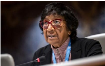
Chairwoman of the the United Nations Independent International Commission of Inquiry on the Occupied Palestinian Territory, including East Jerusalem, and in Israel, South Africa’s Navi Pillay, speaks during a briefing to UN member states about ongoing investigations of the Commission at the UN offices in Geneva, on April 16, 2024.

Pillay told AFP the commission was also cooperating with prosecutors for the International Criminal Court, which litigates acts committed by individuals. “We’ve shared thousands of pieces of information with them,” she said.