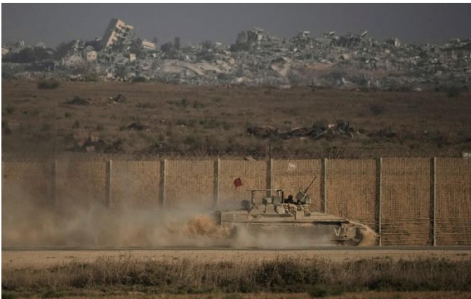
An Israeli armored vehicle moves along the Israeli-Gaza border as seen from southern Israel on September 16, 2025.

"We can hear their screams," the 25-year-old said.