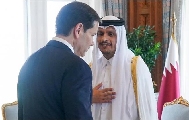
Qatar's Prime Minister and Minister for Foreign Affairs Sheikh Mohammed bin Abdulrahman bin Jassim Al-Thani greets US Secretary of State Marco Rubio, back to camera, at Amiri Diwan, in Doha, Qatar, Sept. 16, 2025.

Rubio also said that there was short period of time for a potential hostage-ceasefire deal to be reached. “The Israelis have begun to take operations there,” Rubio said. “So we think we have a very short window of time in which a deal can happen. We don’t have months anymore, and we probably have days and maybe a few weeks to go.”