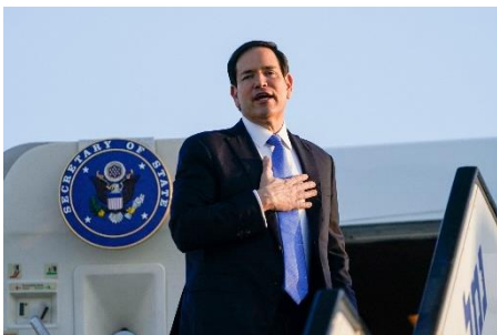
US Secretary of State Marco Rubio boards a plane as he departs Tel Aviv for Qatar following an official visit, at Ben Gurion International Airport, September 16, 2025

“We’re going to ask Qatar to continue to do what they’ve done, and we appreciate very much, and that is, play a constructive role in trying to bring this to an end,” Rubio told reporters as he flew out of Ben Gurion Airport to Doha after meetings with Netanyahu and other top officials.