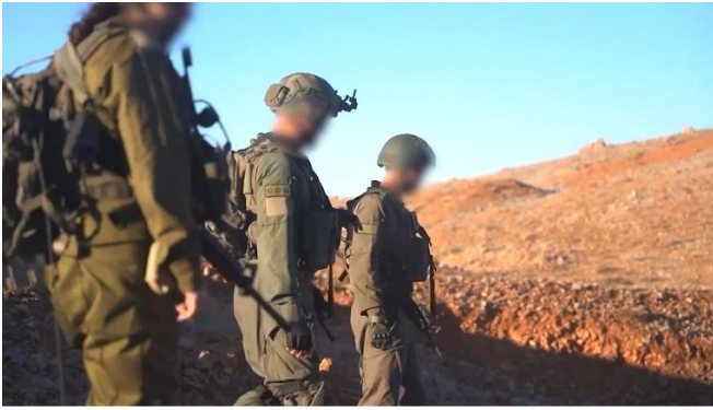
IDF forces in Syria

Last month, several Druze factions announced the creation of the “National Guard,” a new military body endorsed by senior spiritual leader Sheikh Hikmat al-Hijri. The group is described as representing the Druze community in Sweida.