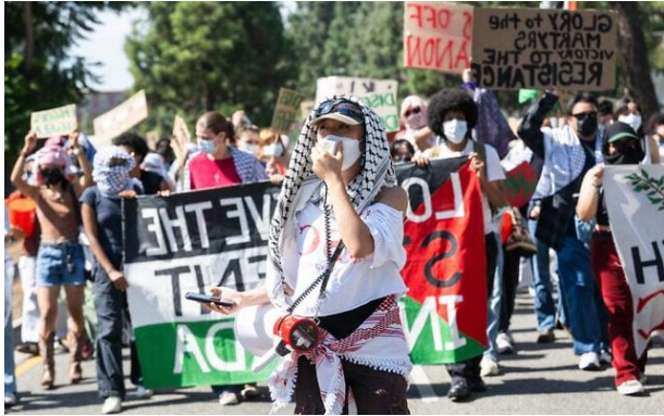
On the anniversary of the October 7, 2023, Hamas onslaught, anti-Israel, pro-Palestinian protesters march in support of the Boycott, Divestment and Sanctions movement against Israel, on the Los Angeles campus of the University of Southern California, October 7, 2024 in Los Angeles.

Nearly one in three Jewish students (29%) said they experienced discrimination from their classmates, and 9% faced it from professors and other university employees, the survey found.