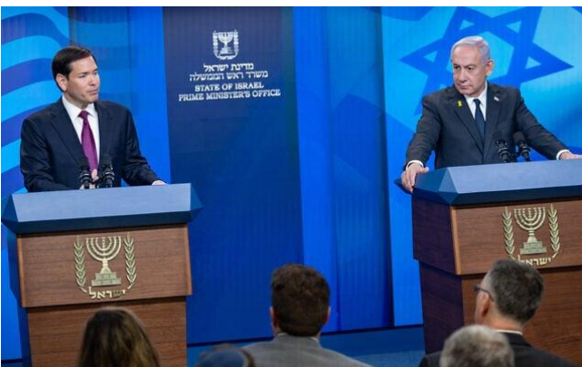
Israeli Prime Minister Benjamin Netanyahu, right, and US Secretary of State Marco Rubio give a press statement, after their meeting at the Prime Minister Office in Jerusalem, on September 15, 2025.

The US State Department said Monday that Rubio “will reaffirm America’s full support for Qatar’s security and sovereignty following Israel’s strike in Doha,” though the secretary of state also had said that the attack will not shake the US-Israel relationship.