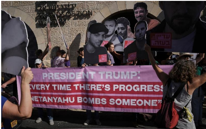
Demonstrators hold photos depicting the faces of hostages who are being held in the Gaza Strip, during a protest demanding their release from Hamas captivity and against the Israeli offensive in Gaza City, in Jerusalem, Sept. 16, 2025.

Additionally, a number of hostages abducted from Israel are believed to be held in the city.