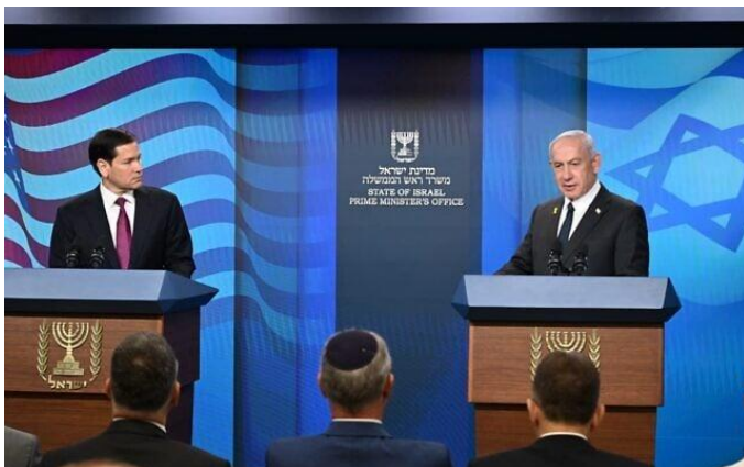
Prime Minister Benjamin Netanyahu (R) speaks alongside US Secretary of State Marco Rubio at the Prime Minister's Office in Jerusalem, on September 15, 2025.

Speaking at a press conference alongside Prime Minister Benjamin Netanyahu on Monday, Rubio called the park "one of the most important archaeological sites on the planet — one that has deep meaning to so many people in the United States as well."