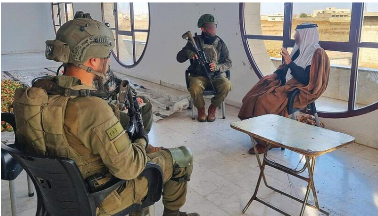
IDF forces with Druze leaders in Syria

quickly faltered when Syrian troops entered Sweida to quell clashes between Druze and Bedouin fighters. Israel said the move violated long-standing security arrangements and retaliated with strikes on Syria’s Defense Ministry in Damascus. Al-Sharaa accused Israel of seeking pretexts to intervene in the south.