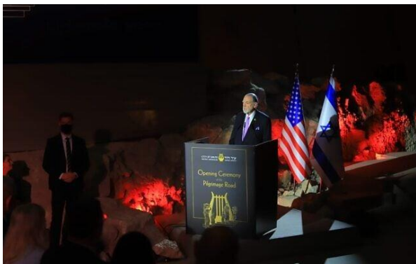
US Ambassador to Israel Mike Huckabee speaks at the inauguration of Pilgrims' Road, in the City of David archeological park in Jerusalem, on September 15, 2025.

“And I welcome today [Rubio,] who understands that this is the foundation of our common Judeo-Christian heritage...This is our city. It is forever our city. It will never be divided again,” he declared.