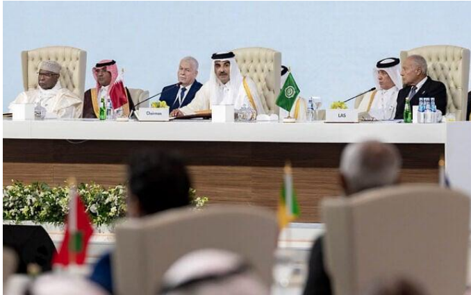
This handout picture released by the Qatar News Agency (QNA) shows Qatar’s Emir Sheikh Tamim bin Hamad Al-Thani (C) chairing the 2025 Arab-Islamic emergency summit in Doha on September 15, 2025.

“The White House rendition of events is correct,” he wrote. “Israel’s action against Hamas leaders in Doha was a wholly independent Israeli operation. Israel initiated it, carried it out, and takes full responsibility.”