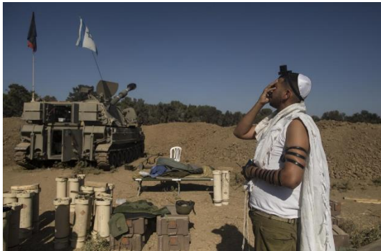
In prayer on the Gaza border

Under the revised policy, military kashrut supervisors will be restricted to religious oversight only and will no longer be allowed to perform kitchen duties —a significant change expected to ease tensions for many observant soldiers.