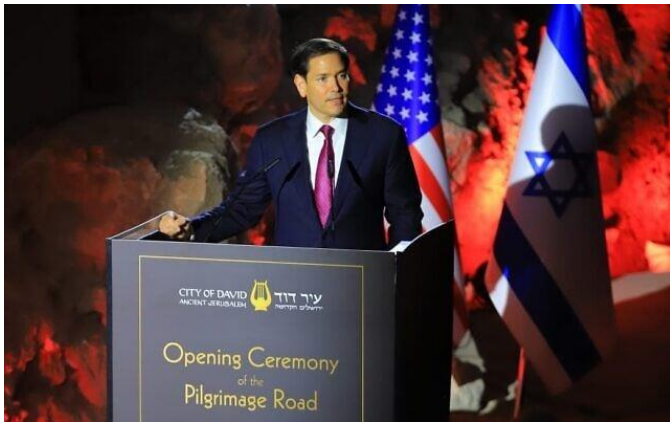
US Secretary of State Marco Rubio speaks at the inauguration of Pilgrims' Road, in the City of David archeological park in Jerusalem, on September 15, 2025.