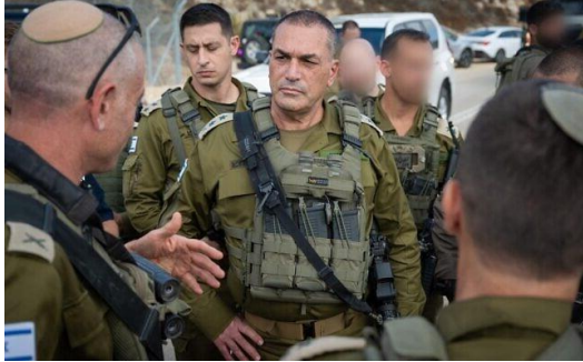
IDF Chief of Staff Lt. Gen. Eyal Zamir speaks to officers in the West Bank, September 8, 2025.

“I think it is absolutely unacceptable that leaks that are often false, and briefings that are almost always biased and agenda-driven, are being released,” he said.