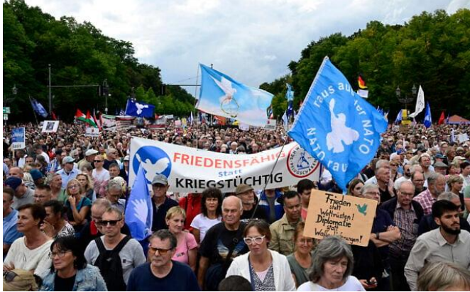
Demonstrators take part in an anti-Israel, pro-Palestinian rally titled “Stop the genocide in Gaza! No weapons in war zones! Peace instead of arms race!” on September 13, 2025, at the Brandenburg Gate in Berlin.

Several EU countries have announced in recent days that they would move towards arms embargoes on Israel and stop buying Israeli weapons amid the Gaza war.