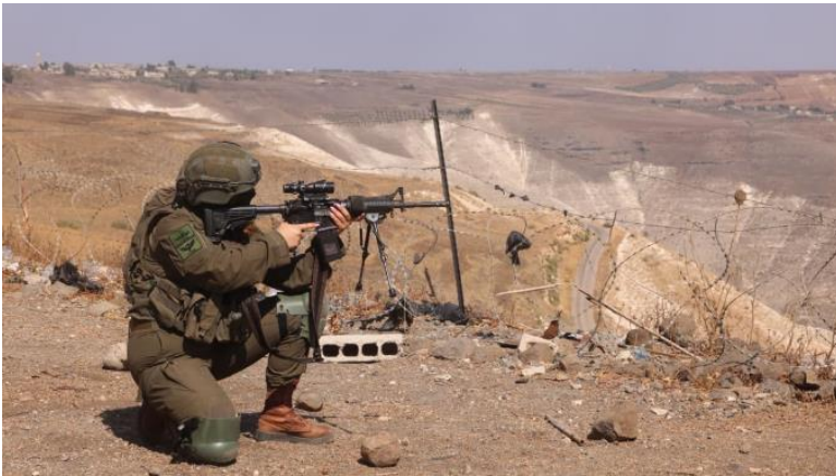
IDF soldier operating on Israel's border with Syria, September 9, 2025.

By JERUSALEM POST STAFF SEPTEMBER 16, 2025 23:38 Updated: SEPTEMBER 17, 2025 00:56