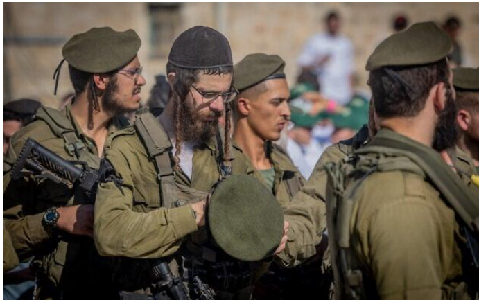
Soldiers from the Hasmonean Brigade take part in a ceremony at the Western Wall in Jerusalem's Old City on August 6, 2025.

Despite this, “You don’t want us to invest massive resources in building bases and brigades for the Haredim when we don’t know how they will arrive,” he noted, adding that the military was “committed to creating a General Staff order and an advisor on Haredi affairs — and the chief of staff has already approved it.”