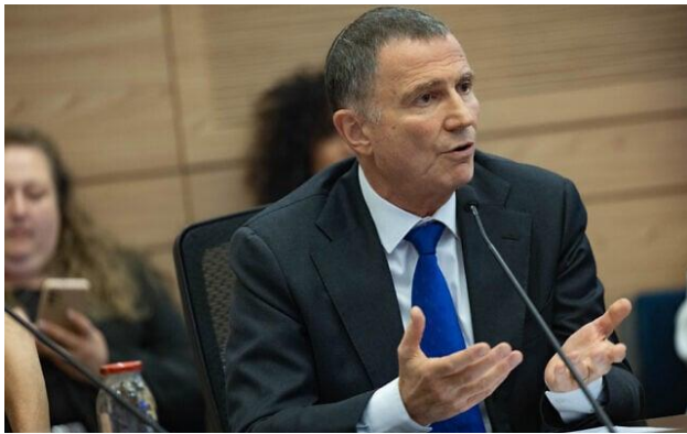
Likud MK Yuli Edelstein attends a meeting of the Knesset House Committee, August 4, 2025.

In a Facebook post after the debate, former Foreign Affairs and Defense Committee chairman Yuli Edelstein (Likud) insisted that the reservists “who have been deployed time and time again have no time to waste.”