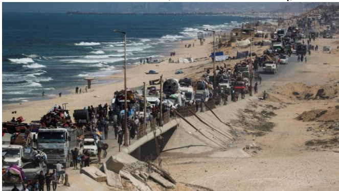
Displaced Palestinians flock to the southern Gaza Strip