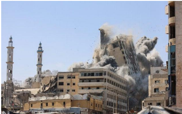
Smoke billows as Israeli airstrikes destroy the al-Ghafari tower in Gaza City on September 15, 2025.

“Right now, [Gazans] are leaving Gaza City, and so far almost 400,000 have already left, ” Netanyahu said , adding that in a discussion at the IDF command bunker in Tel Aviv earlier in the day, “I instructed them to find ways to make it easier for them to leave.”