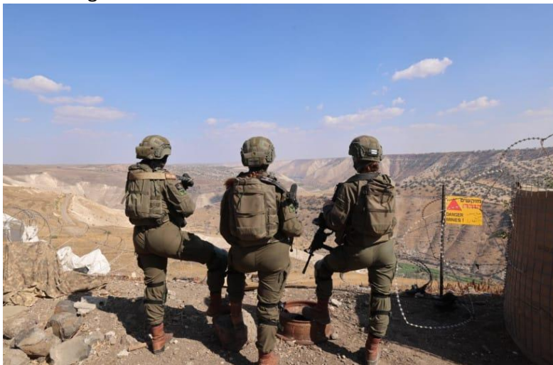
IDF soldiers on Israel's border with Syria, September 9, 2025.

In exchange for these conditions, Israel would gradually withdraw from all of its positions in Syria except Mount Hermon. One official said that Israel plans on maintaining a presence there in all versions of a future agreement.