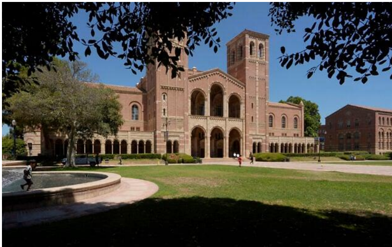
Children play outside Royce Hall at the University of California, Los Angeles, campus, August 15, 2024.

"Federal cuts to research funding threaten lifesaving biomedical research, hamper US economic competitiveness and jeopardize the health of Americans who depend on the University's cutting-edge medical science and innovation," he said in a statement.