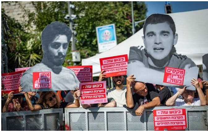
Families of hostages held in Gaza and their supporters protest outside the Prime Minister's Residence in Jerusalem, calling for their release, September 16, 2025.

which would help us free all of our hostages in the first months of the war.”