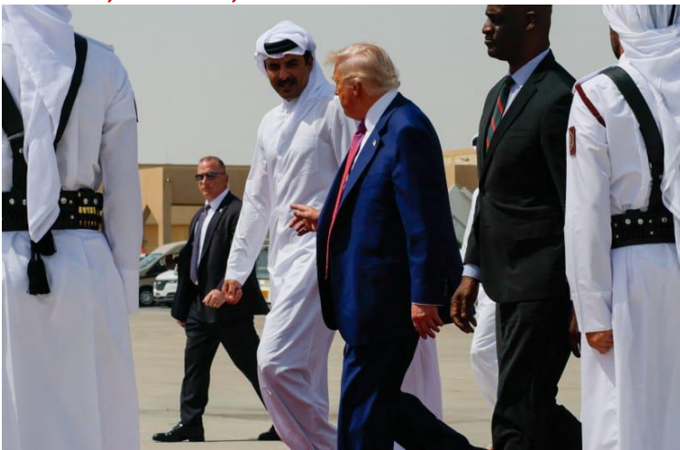
US President Donald Trump is escorted by Qatar's Emir Tamim bin Hamad Al Thani towards Air Force One, as he departs Al Udeid Air Base, en-route to Abu Dhabi, United Arab Emirates, in Doha, Qatar, May 15, 2025.