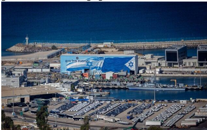
View of the Haifa port in the northern Israeli city of Haifa, November 17, 2024.

Kallas said the measures are meant to “leverage the tools at our disposal to pressure the Israeli government into changing course.”