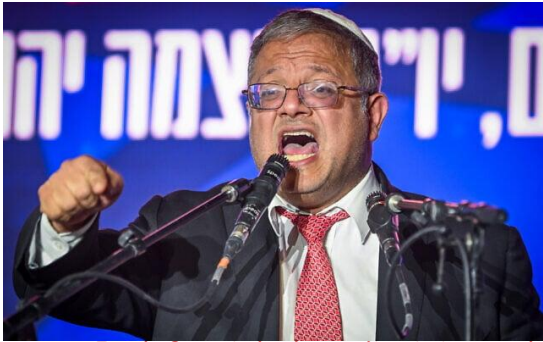
National Security Minister Itamar Ben Gvir speaks during a rally outside the Supreme Court in Jerusalem, June 5, 2025.

The measures against Finance Minister Bezalel Smotrich, National Security Minister Itamar Ben Gvir, violent settlers and 10 Hamas political leaders need unanimous support to be enacted.