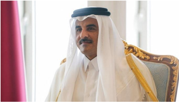
Qatar's Emir Sheikh Tamim bin Hamad Al Thani, in Doha, Qatar, September 16, 2025.