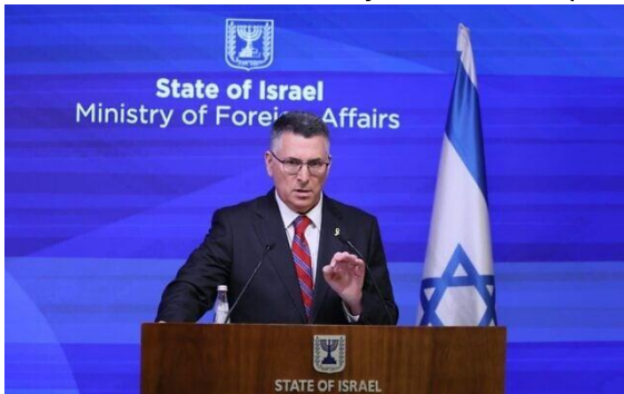
Foreign Minister Gideon Sa'ar speaks during a press conference in Jerusalem, July 29, 2025.

Sparta.” A day later, he held a press conference aimed at damage control, saying that he was speaking specifically about the defense industry, and that the problem was largely with “Western European governments.”