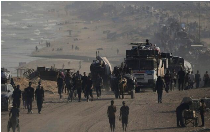
Displaced Palestinians flee Gaza City on foot and vehicles, carrying their belongings along the coastal road toward southern Gaza, Sept. 17, 2025.

Specifically, this breach refers to the rapidly deteriorating humanitarian situation in Gaza following the military intervention of Israel, the blockade of humanitarian aid, the intensifying of military operations and the decision of the Israeli authorities to advance the settlement plan in the so-called E1 area of the West Bank, which further undermines the two-state solution."