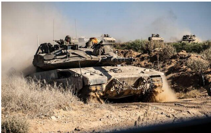
An IDF tank moves towards Gaza City at the start of an IDF operation to capture the city in a picture released on September 16, 2025

With the Israel Defense Forces carrying out massive strikes in Gaza City, and desperate Israeli families of hostages said they were “terrified” for their loved ones, questions at Netanyahu’s press conference also focused on the push into Gaza’s biggest city.