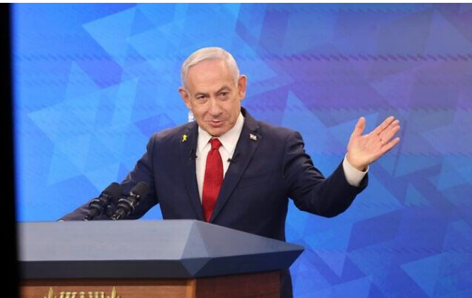
Prime Minister Benjamin Netanyahu holds a press conference at the Prime Minister's office in Jerusalem, September 16, 2025.

By Lazar Berman and Nava Freiberg Today, 2:44 am