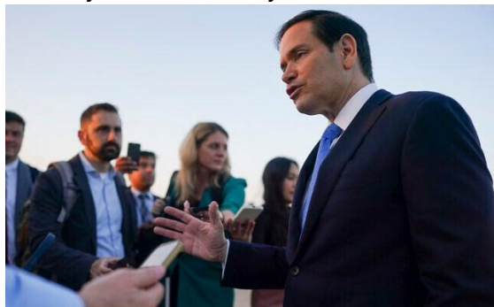
US Secretary of State Marco Rubio speaks to the press as he departs Tel Aviv for Qatar following an official visit, at Ben Gurion International Airport, near Lod, Israel, September 16, 2025.

It would come amid US backing for Israel's major offensive in Gaza City , which kicked off early Tuesday as US Secretary of State Marco Rubio took off for Qatar.