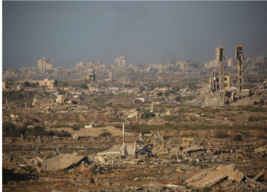
People walk near destroyed buildings following an Israeli airstrike in Gaza City, September 16, 2025, after Israel launched a large-scale operation in the city.

Sources reported that direct confrontations have occurred between clan operatives and Hamas fighters in multiple locations.