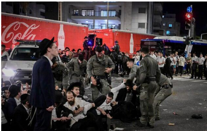
Ultra-Orthodox Jews clash with police during a protest against the conscription of yeshiva students on Route 4 near Bnei Brak, September 11, 2025.

By Sam Sokol and Emanuel Fabian Today, 8:14 pm