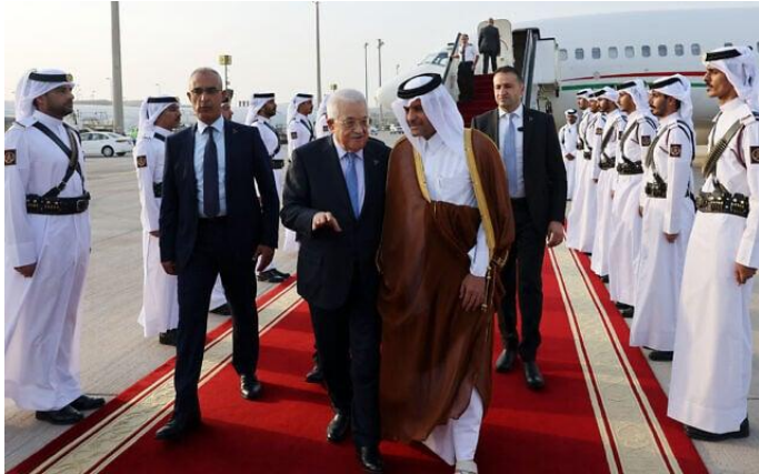
This handout picture provided by the Palestinian Authority's press office shows Palestinian Authority President Mahmoud Abbas (L) received by Qatar's Deputy Prime Minister Saoud bin Abdulrahman Al Thani upon arrival in Doha on September 14, 2025, ahead of an Arab-Islamic emergency summit.

The strike — which killed five non-leading members of Hamas and a Qatari security officer, but apparently none of its five key intended Hamas leadership targets — elicited fury from Arab governments, which convened for an emergency gathering Monday over the attack.