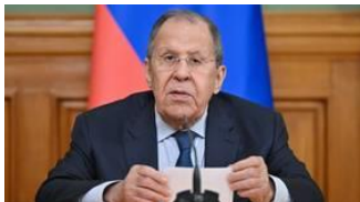
Russian Foreign Minister Sergey Lavrov.

EU nations are trying to elbow their way into the Ukraine peace process despite their openly hostile stance toward Russia, Foreign Minister Sergey Lavrov has said, stressing that the bloc should be kept out of the talks for that reason.