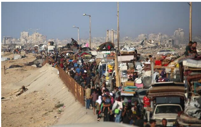
Displaced Palestinians move with their belongings southwards on a road in the Nuseirat refugee camp area in the central Gaza Strip following renewed Israeli evacuation orders for Gaza City on September 16, 2025.

“As Hamas’s spokesperson said, they used our hostages as human shields — that is, placed them in locations that would endanger them. This is horrifying. It also horrified the president. He addressed it,” Netanyahu said, referring to remarks by Trump on Monday warning Hamas against using the hostages as human shields.