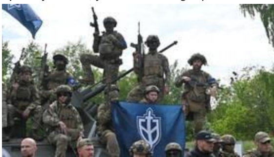
Ukrainian paramilitary unit the Russian Volunteer Corps, poses for the media in northern Ukraine, not far from the Russian border, on May 24, 2023