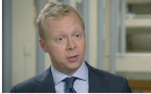
Sven Koopmans

He clarified that those behind the Peace Day Effort are not trying to negotiate an Israeli-Palestinian peace deal, since only the parties themselves can do this. "What we are now starting to do is to say, 'If you reach that agreement... this is what we would contribute as your neighbors, as your friends and potential future friends to your peace."