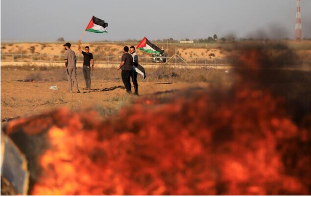
Palestinian rioters clash with Israeli soldiers at the Israel-Gaza border barrier, east of Khan Yunis, in the southern Gaza Strip, on September 17, 2023.

Hundreds of Palestinians in the Gaza Strip rioted on the border with Israel on Monday afternoon, for the third time in days, despite Israeli sanctions and an airstrike on a post belonging to the Hamas terror group that rules the territory.