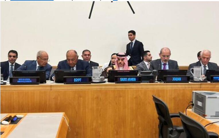
Arab League Secretary-General Ahmed Aboul Gheit, Egyptian Foreign Minister Sameh Shoukry, Saudi Arabian Foreign Minister Faisal bin Farhan, Jordanian Foreign Minister Ayman Safadi, and EU foreign policy chief Joseph Borrell at an event on the sidelines of the UN General Assembly aimed at reviving the Israeli-Palestinian peace process on September 18, 2023.

Nearly 30 foreign ministers from countries in Europe and the Middle East met on the sidelines of the United Nations General Assembly on Monday to unveil a new initiative aimed at reviving the long-dormant Israeli-Palestinian peace process.