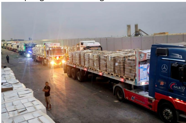
Trucks carrying humanitarian aid line up near the Rafah border crossing between Egypt and the Gaza Strip, amid the ongoing conflict between Israel and Hamas, in Rafah, Egypt, August 13, 2025.

One of these threats to national security is the possible displacement of refugees from the Gaza Strip attempting to cross through the Rafah Border Crossing into Egypt's Sinai Peninsula, Rashwan noted.