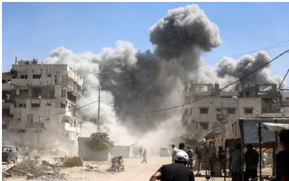
The Mhanna tower collapses amid heavy smoke, after an Israeli strike following an evacuation order in the Tal el-Hawa neighborhood of Gaza City on September 14, 2025

The document has also gone through a few rounds of edits since it was obtained by The Times of Israel, as Blair continues to receive feedback from stakeholders, the source said.