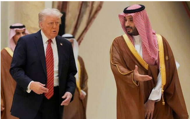
US President Donald Trump (right) arrives with Saudi Crown Prince Mohammed bin Salman for the group photo with Gulf Cooperation Council leaders during the GCC Summit in Riyadh, Saudi Arabia, May 14, 2025.

That deadline has since expired, but the time period was one the president has announced somewhat regularly without sticking to it.