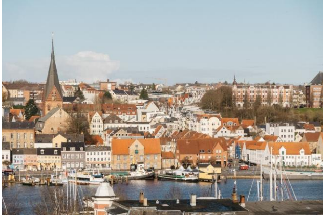
Flensburg, Germany