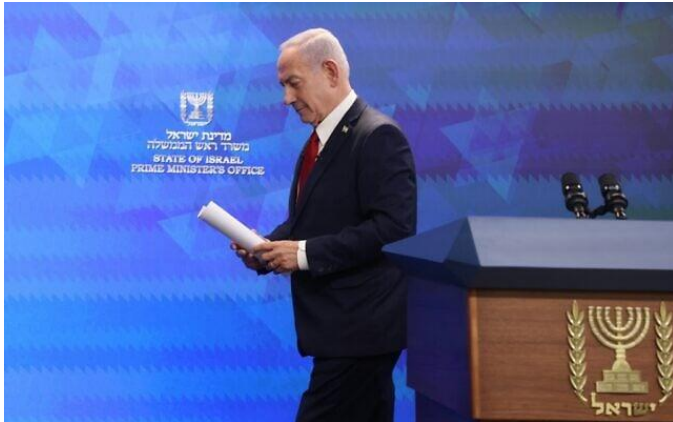
Prime Minister Benjamin Netanyahu holds a press conference at the Prime Minister's office in Jerusalem, September 16, 2025.

the Ynet news outlet reported at the time. Gulf countries have since expressed their condemnation of the attack and solidarity with Qatar.