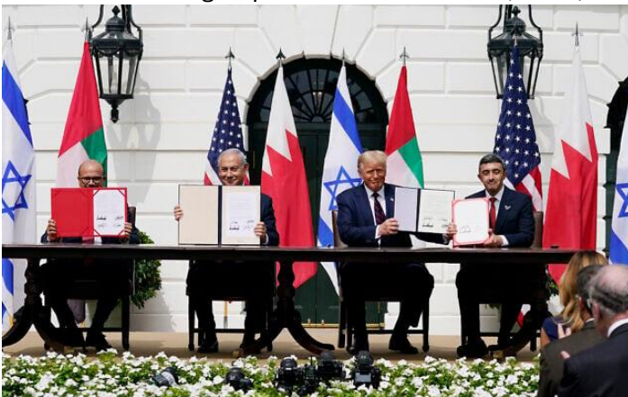
From left, Bahrain Foreign Minister Khalid bin Ahmed Al Khalifa, Prime Minister Benjamin Netanyahu, then-US president Donald Trump, and United Arab Emirates Foreign Minister Abdullah bin Zayed al-Nahyan, sit during the Abraham Accords signing ceremony on the South Lawn of the White House, in Washington, September 15, 2020.

The sources, who all spoke on condition of anonymity, said Abu Dhabi was not considering completely severing ties, although tensions have mounted during the almost two-year-old Gaza war that was triggered by the Palestinian terror group Hamas on October 7, 2023, when it led a devastating invasion of southern Israel.