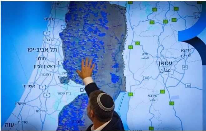
Finance Minister Bezael Smotrich gestures toward a map of the West Bank during a press conference at the Finance Ministry in Jerusalem, September 3, 2025.

The United Arab Emirates may downgrade its diplomatic ties with Israel if Prime Minister Benjamin Netanyahu's government annexes part or all of the West Bank, but it is not weighing the option of severing the relationship completely, according to three sources briefed on the Gulf Arab state's deliberations.