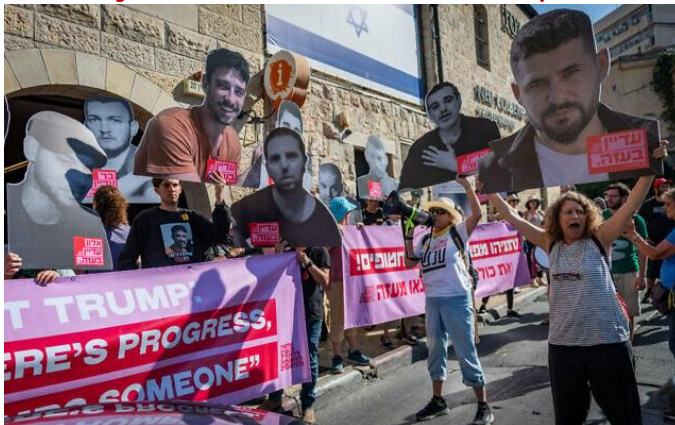
Demonstrators protest against Gaza City operation outside the Jerusalem Post conference in Jerusalem, call for the release of hostages held in the Gaza Strip, September 16, 2025.

The source involved in the discussions stressed that the reforms that the Blair plan expects of the PA “are not cosmetic,” and that part of the reason there’s not a set timeline for GITA to hand over authority of Gaza to the PA is that the process is “performance-based.”