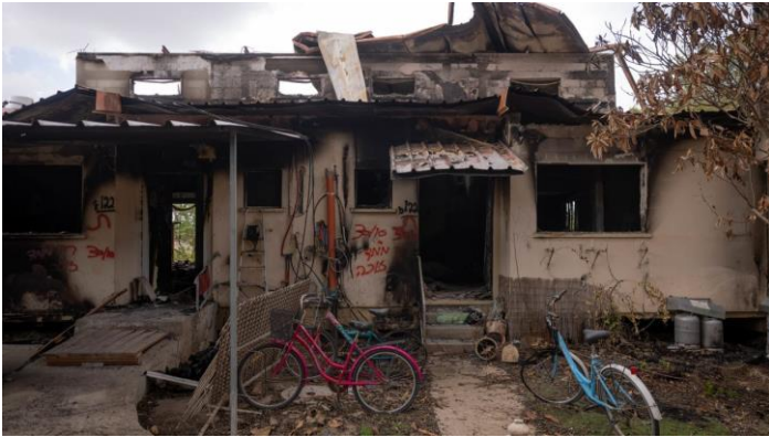
The destruction caused by Hamas terrorists in Kibbutz Kissufim on October 7, 2023, near the Israeli-Gaza border, in southern Israel, November 20, 2023.

A lawsuit by over 140 family members and victims of the October 7 Massacre against the terrorist organization perpetrators and their state sponsors was filed by the Anti-Defamation League and Crowell & Moring LLP with the Columbia District Court on Thursday, in their second legal action on behalf of US citizens impacted by the 2023 Hamas-led pogrom.