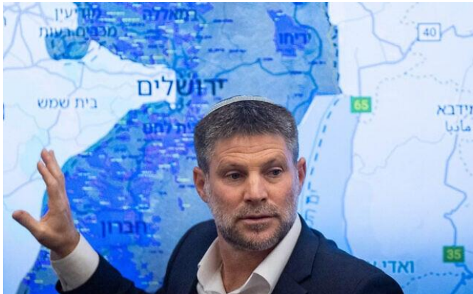
Finance Minister Bezalel Smotrich gestures toward a map of the West Bank during a press conference at the Finance Ministry in Jerusalem, September 3, 2025.

As part of the Abraham Accords, Netanyahu promised to hold off on annexing the West Bank for four years. But that deadline has passed, and some Israeli ministers are now pressing for action.