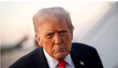
US President Donald Trump steps off Air Force One on September 7, 2025 at Joint Base Andrews, Maryland.

Whether we like it or not, the history of international politics is a near-continuous chain of violence between states. Rarely has this violence been aimed at total conquest or permanent subjugation. More often it reflects a state's instinct for survival – the attempt to build a system where security does not depend solely on self-defense, but on recognition by others.