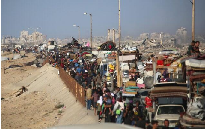
Displaced Palestinians move with their belongings southwards on a road in the Nuseirat refugee camp area in the central Gaza Strip following renewed Israeli evacuation orders for Gaza City on September 16, 2025.

“We do not have a plan to move the Gazan population out of Gaza. Gaza is for Gazans,” said a source involved in discussions on the Blair plan.