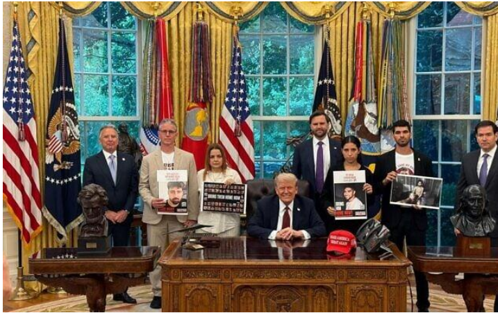
US President Donald Trump hosts families of hostages held by Hamas in Gaza, at the White House on September 10, 2025.

“It ensures border integrity, deters armed group resurgence, protects humanitarian and reconstruction operations, and supports local law enforcement through coordination — not substitution,” the plan states.