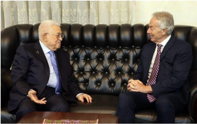
This handout picture released by the Palestinian Authority's press office (PPO) shows President Mahmoud Abbas (R) meeting with Britain's former prime minister Tony Blair in Amman, Jordan, on July 13, 2025.

Though that is a development Netanyahu has fought fiercely to prevent, the source familiar with discussions said that Israel has engaged constructively with Blair's effort.