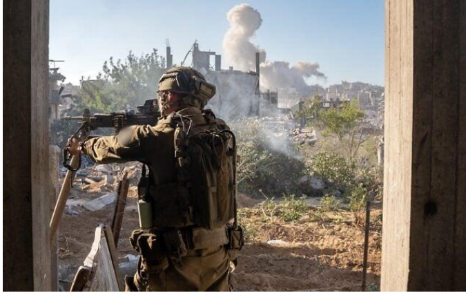
IDF troops operate in Gaza City, in a handout photo issued on September 17, 2025.

The latter body is what has often been referred to as the committee of independent Palestinian technocrats who will be responsible for administering Gaza after the war.