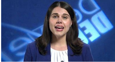
Colorado Secretary of State Jena Griswold

Elected as Mesa County clerk in 2018, Peters served as the county's chief election official, responsible for ensuring compliance with federal and state election laws.