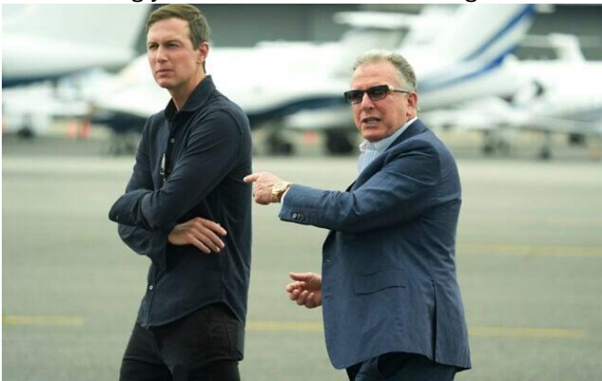
White House special envoy Steve Witkoff, right, and Jared Kushner wait for the arrival of US President Donald Trump at Teterboro Airport in Teterboro, N.J. on July 13, 2025.

Like Kushner in his time, Witkoff has been handed a variety of portfolios. The current special envoy has hired limited support staff, though, and Kushner has been helping with the Gaza day-after planning, as it is increasingly seen as critical for securing a war-ending hostage release deal.