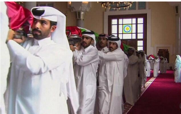
This grab from video footage released by Qatar TV shows men carrying the flag-draped bodies of six people killed in an Israeli strike on Hamas figures two days earlier, inside the Sheikh Mohammed bin Abdul Wahhab Mosque in Doha on September 11, 2025.

Alongside establishing an alternative to Hamas through GITA, the plan also explicitly refers to the concept of "disarmament, demobilization, and reintegration" or DDR.