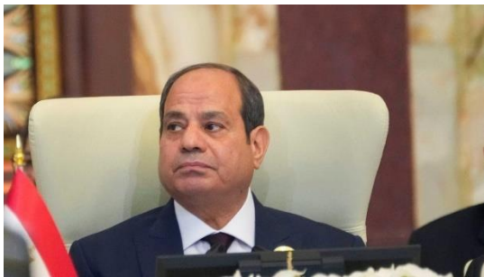
President of Egypt Abdel Fattah al-Sisi attends the 34th Arab League summit, in Baghdad, Iraq, May 17, 2025; illustrative.

Egyptian President Abdel Fattah al-Sisi referred to Israel as an "enemy" during his closing speech at the Arab-Islamic summit in Doha earlier this week.