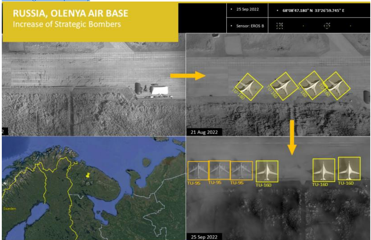
Four TU-160s and three TU-95s detected by Israeli intelligence firm ImageSat International

The bombers, capable of carrying cruise missiles and strategic nuclear weapons, have been active in the Ukrainian war since Moscow invaded in February. Throughout the war against Ukraine, the Russian Air Force has been unable to gain air superiority and has lost numerous aircraft.