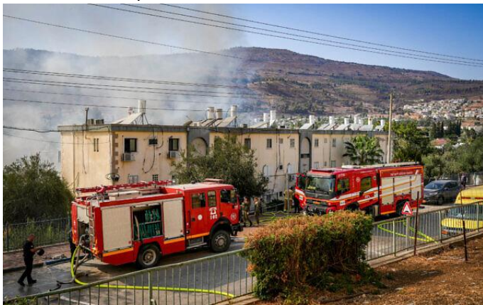
Israeli security and rescue forces at the site where a missile fired from Lebanon hit in the northern town of Kiryat Shmona, October 9, 2024.

Medics declared the two dead at the scene, according to the Magen David Adom rescue service, which said the pair had been in their 40s.