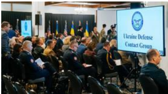
FILE PHOTO. General view of the seventh meeting of the Ukraine Defense Contact Group at Ramstein air base on March 19, 2024 in Ramstein-Miesenbach, Germany.

This week’s planned meeting of the heads of state of Ukraine’s backers in Germany has been canceled after US President Joe Biden announced he will not attend, Reuters reported on Wednesday, citing an e-mail sent by the US public affairs office at Ramstein Air Base. Radio Free Europe/Radio Liberty (RFE/RL) also reported the development, citing anonymous NATO