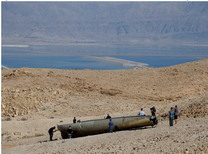
People stand around apparent remains of a ballistic missile lying in the desert, following an attack by Iran on Israel, near the southern city of Arad, Israel October 2, 2024.

By YONAH JEREMY BOB OCTOBER 9, 2024 20:07 Updated: OCTOBER 9, 2024 20:18