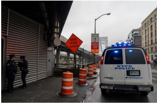
NYPD, Police Officers stand guard near an entrance to the George Washington Bridge in New York, U.S., May 15, 2024.

bigotry. Not every reported hate crime results in an arrest or prosecution. The legal standard for proving bias is high, making prosecution difficult.