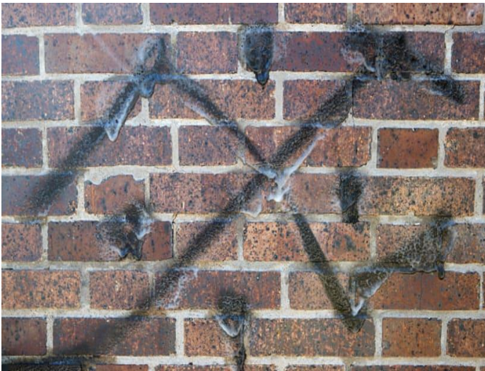
An apparent swastika and other wording was spray painted on the Buffalo Soldiers National Museum on Wednesday, July 29, 2020 in Houston, Texas.

"This act of hate and vandalism is counter to our university values," they wrote on a post to their social media.