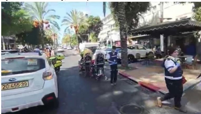
Emergency services and security forces at the scene of a terror attack in Hadera, October 9, 2024.

Six people were stabbed and injured, two of them critically, in a terror attack on Wednesday in Hadera that spanned four different locations in the central city.