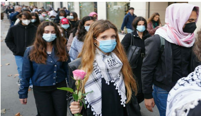
A university student of Institute of Political Studies (Sciences Po Paris) walks down the street wearing a Palestinian keffiyeh to demonstrate against Israel's war in the Gaza Strip, in Paris, on October 8, 2024.

By MATHILDA HELLER OCTOBER 9, 2024 14:23