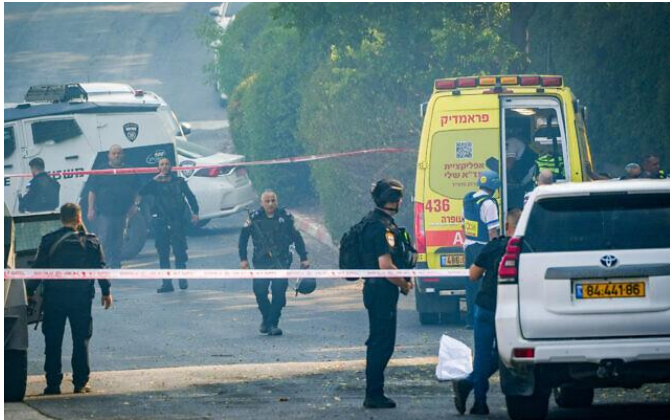
Israeli security and rescue forces at the site where a missile fired from Lebanon hit in the northern town of Kiryat Shmona, October 9, 2024.

By Emanuel Fabian and Tol Staff Today, 2:36 pm