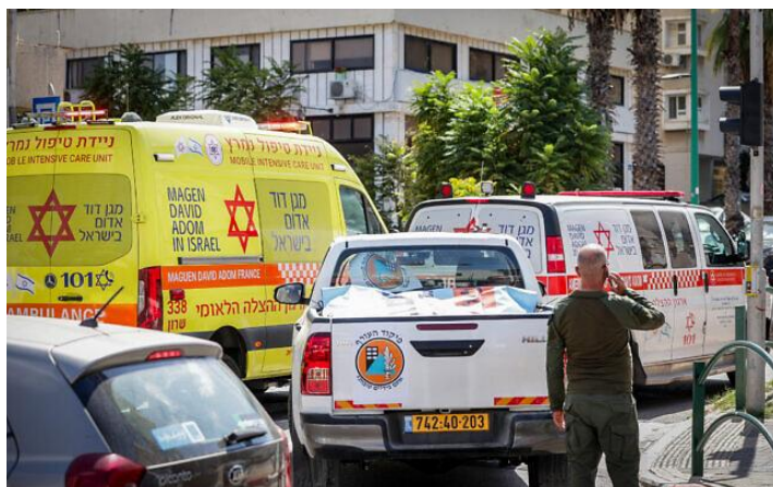
Emergency services and security forces at the scene of a terror attack in Hadera, October 9, 2024