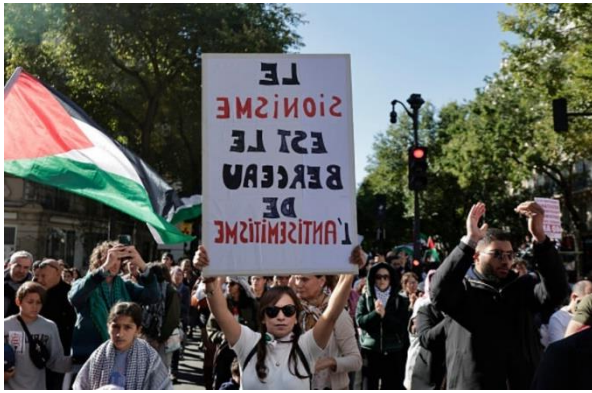
A woman holds a placard reading in French "Zionism is the cradle of anti-Semitism" take part in a rally organised by the association France Palestine Solidarite (AFPS) in support of the Palestinian people, in Paris, on October 5, 2024.