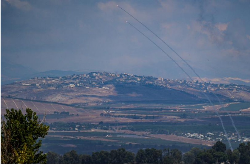
An Israeli anti missile system intercept rockets fired from Lebanon, near the Israeli border with Lebanon, northern Israel, September 4, 2024.

The Arbivs, who have four children and four grandchildren, described the frustration of living under constant threat. "We were always told we didn't understand or that we were imagining things."